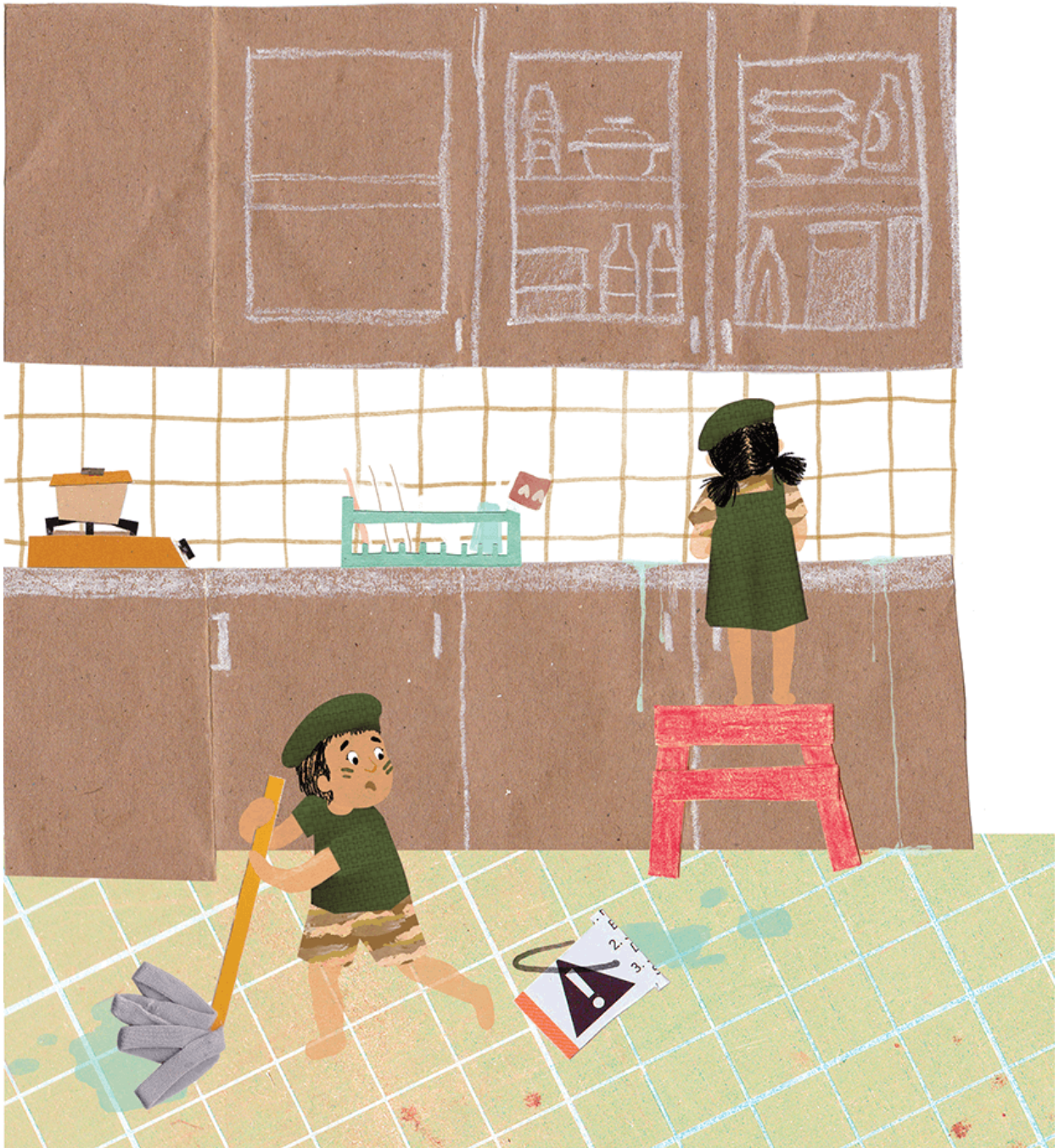
The twins' military-like training took place every day. They memorized