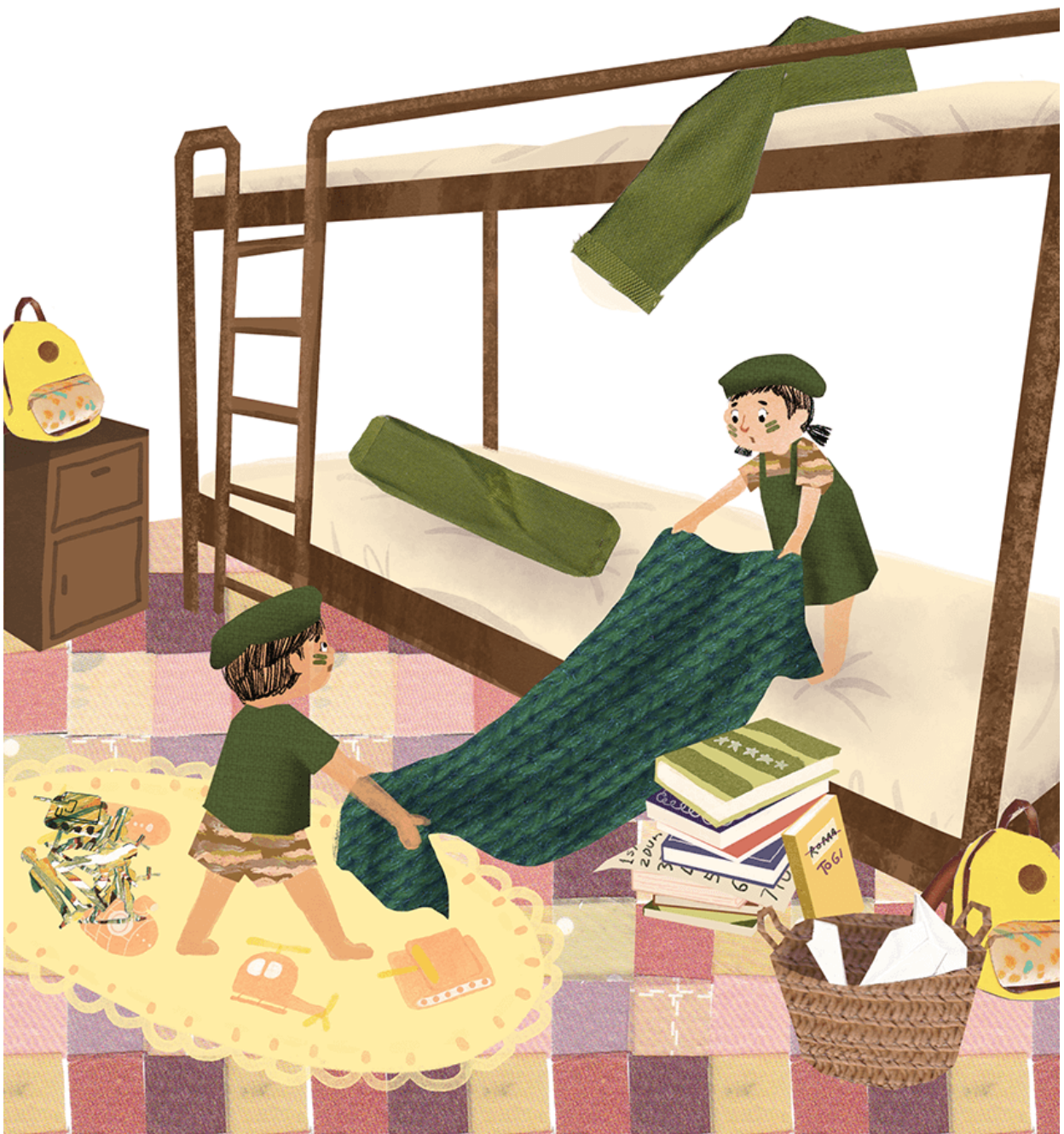
The twins moved while shouting, "Spread the blanket. One step