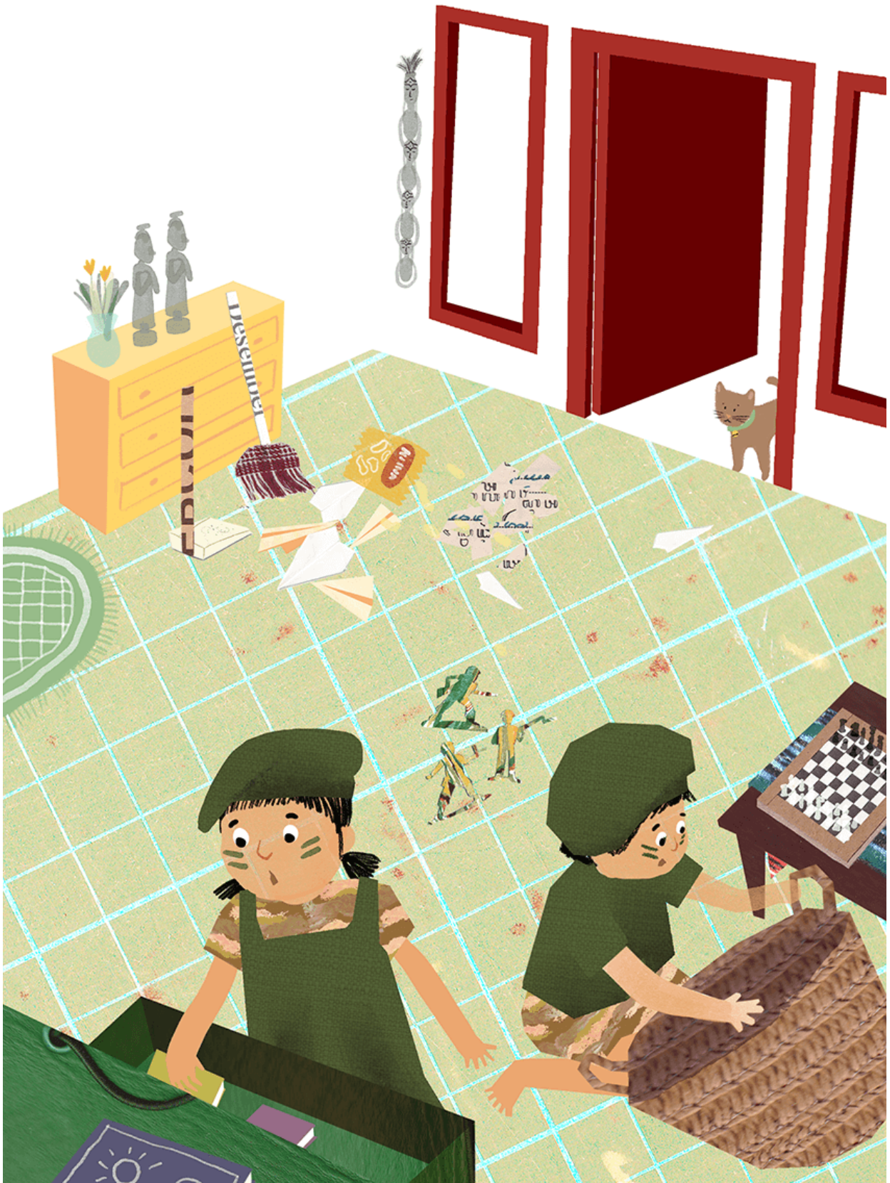
The twins were back in action. The toys were cleaned up in time.