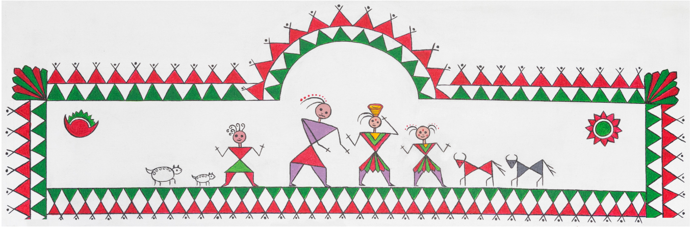
Kailari Chhabilal Kopila