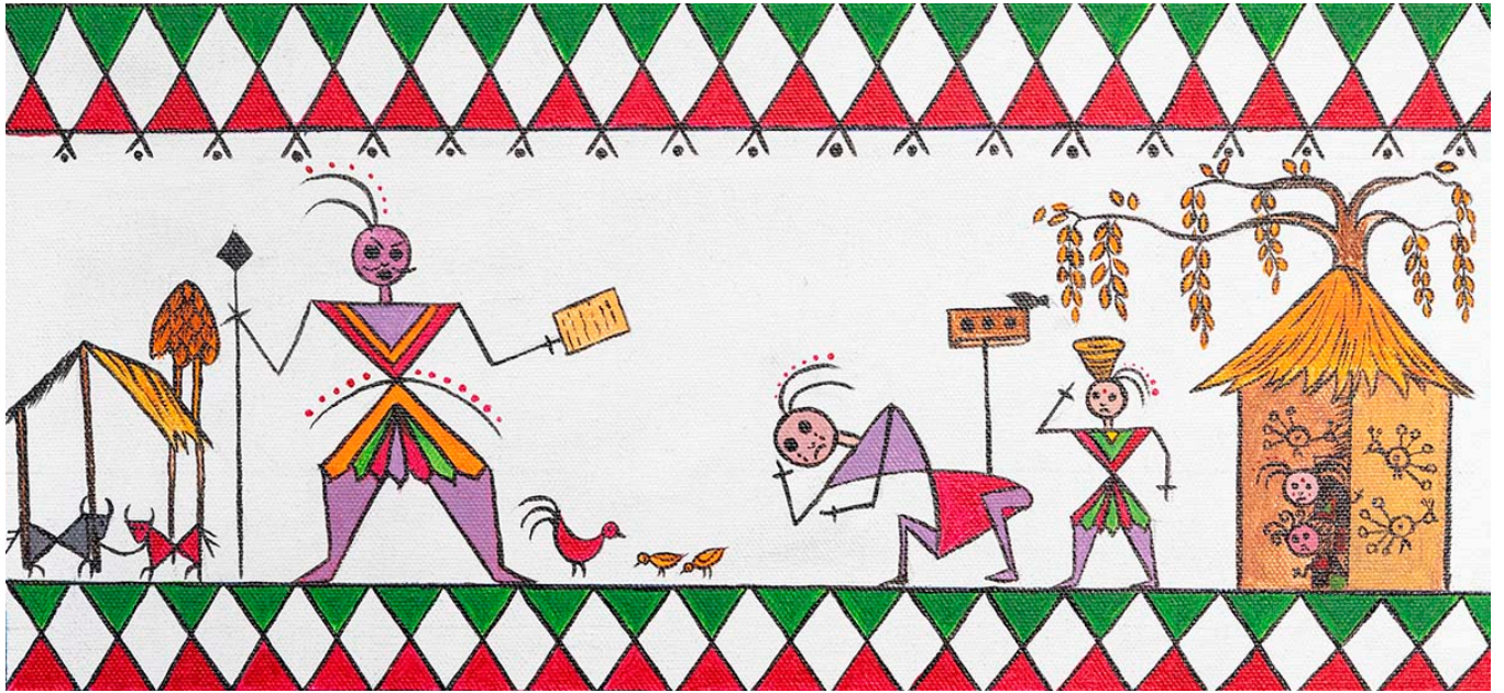
Dukhuwa Tharu works hard to put together a small plot of land in Deukhuri.