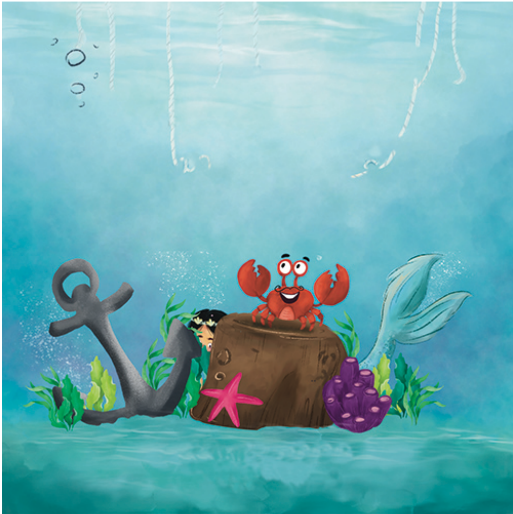
Blue Sea Squad