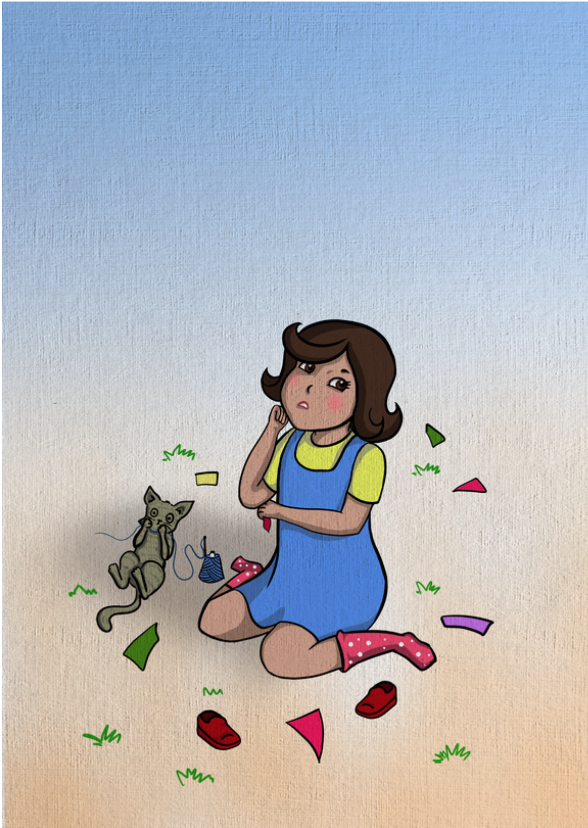
Nita's Beautiful Bag Pao Makara