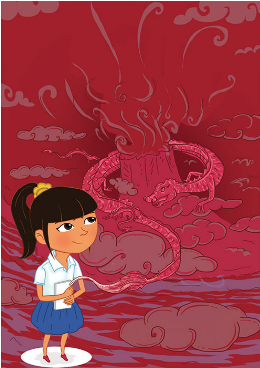
Finding Dragon Island The Asia Foundation - Let's Read