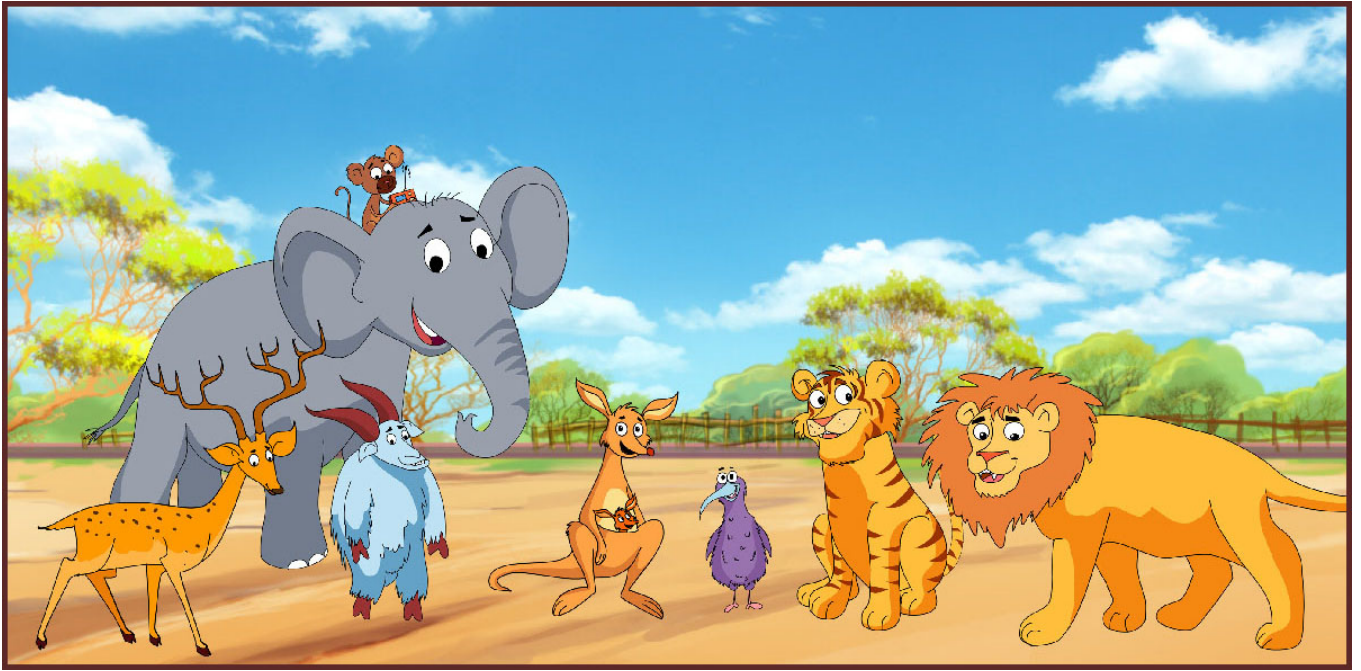
Cricket at the Zoo BookBox