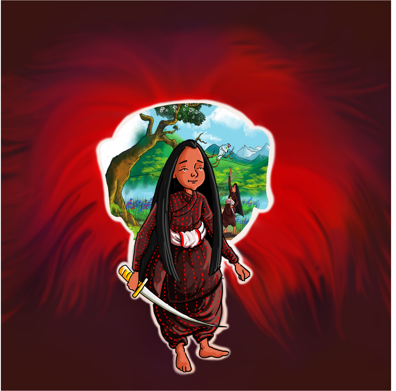
The Princess and the Sunpati Flower Binita Buddhacharya