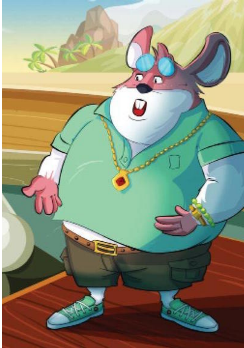
The New Neighbor Hijra AlSawi