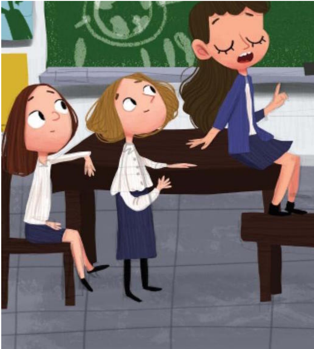
I Will Change the World Obai Al-Alloush