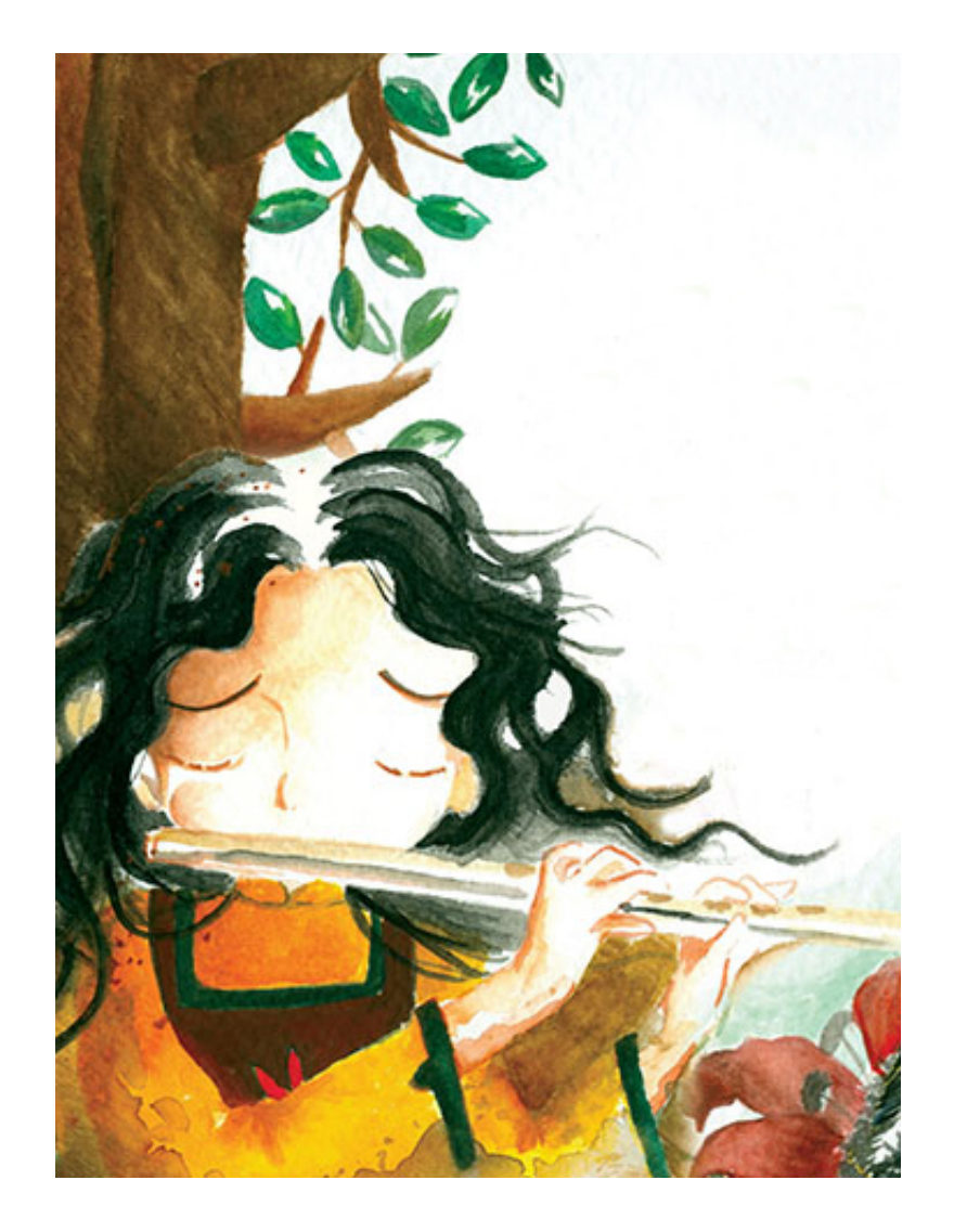
The Tale of a Piper

In the garden, a little girl plays a sad song on her flute. Why is she so sad? Maybe the inhabitants of the garden can help!