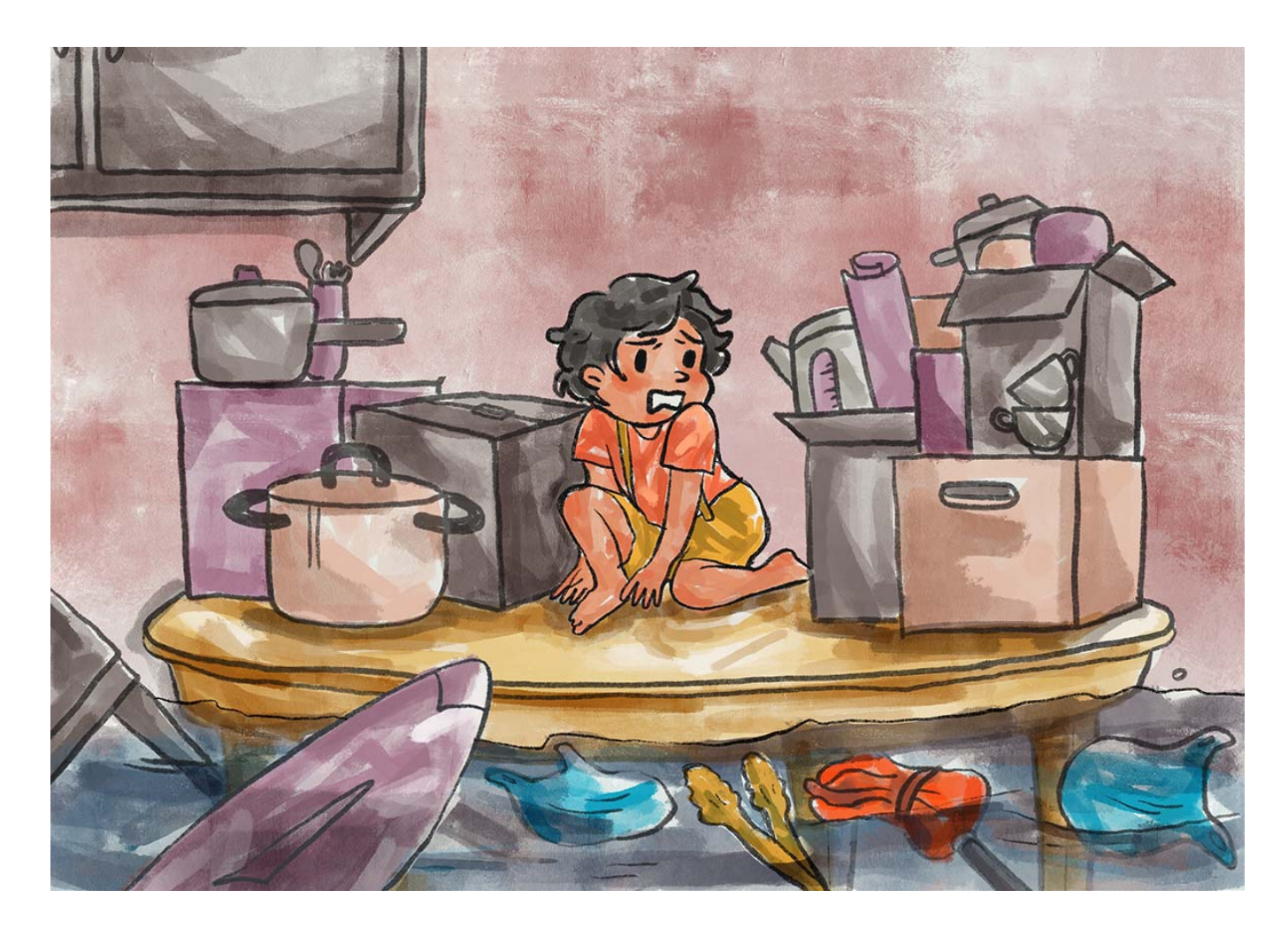
"Where should I go?"Hic! Hic! Hic!"Nilam," hic, "help me!"