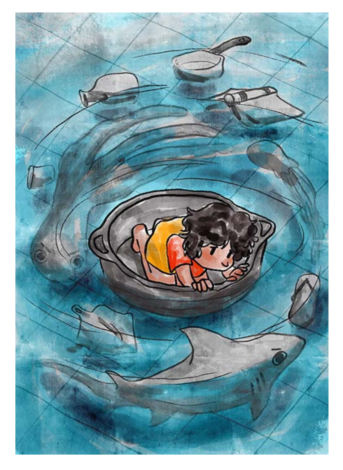
When the Flood Comes

When water floods his house, Banyu is scared. Is that sea water? Are those sea creatures? How can he stay safe?