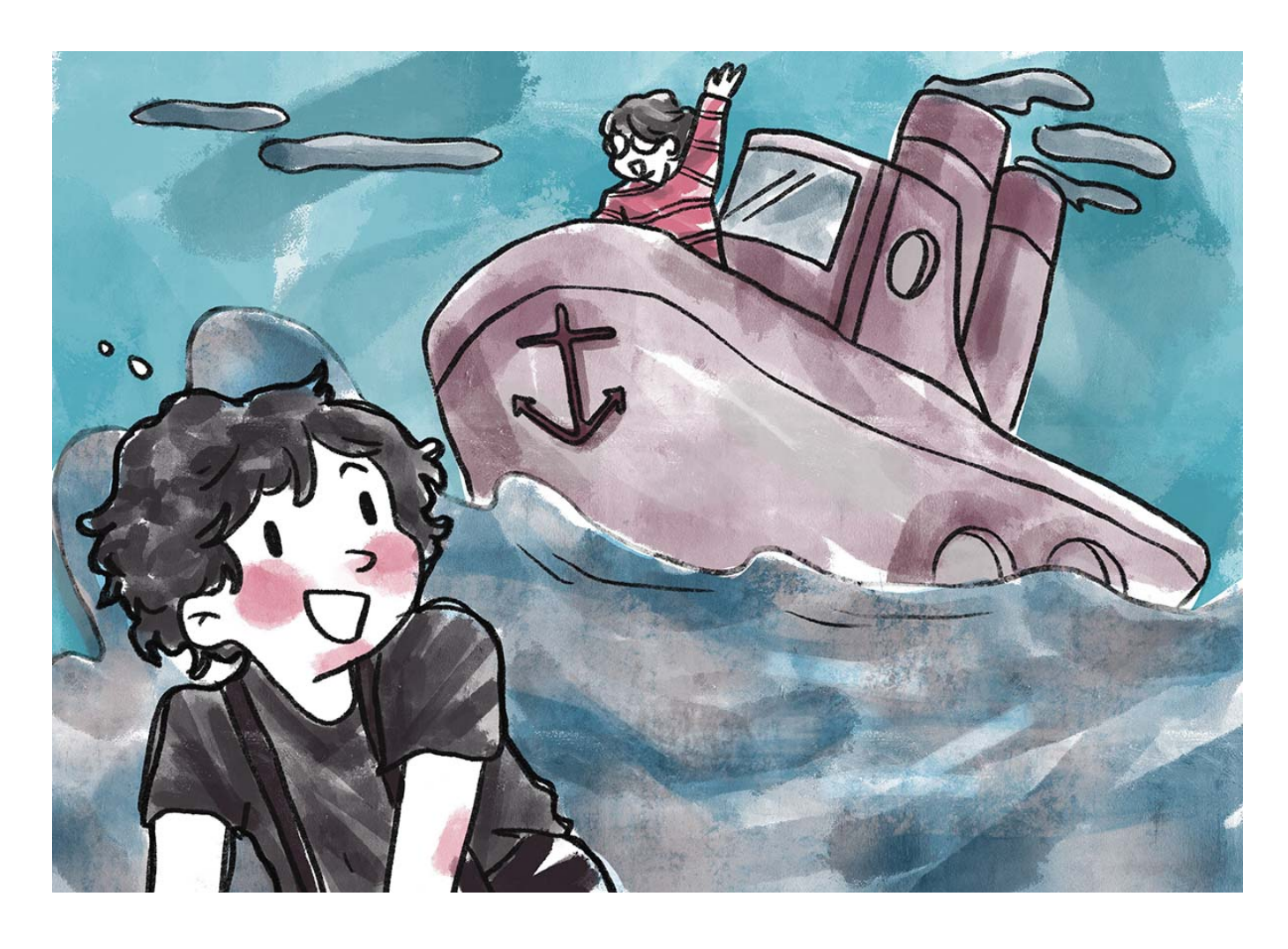
"Come up, Banyu. This ship will take us to a safer place," shouts Nilam.Tooot!Banyu feels so relieved.