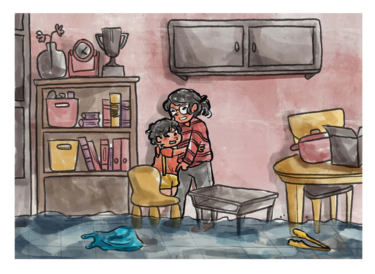
Hic! Hic! "No Banyu, that is not a jellyfish," says Nilam. "It's just a plastic bag." Banyu is still afraid. Tak! Tak! What is that sound? Something else is coming!