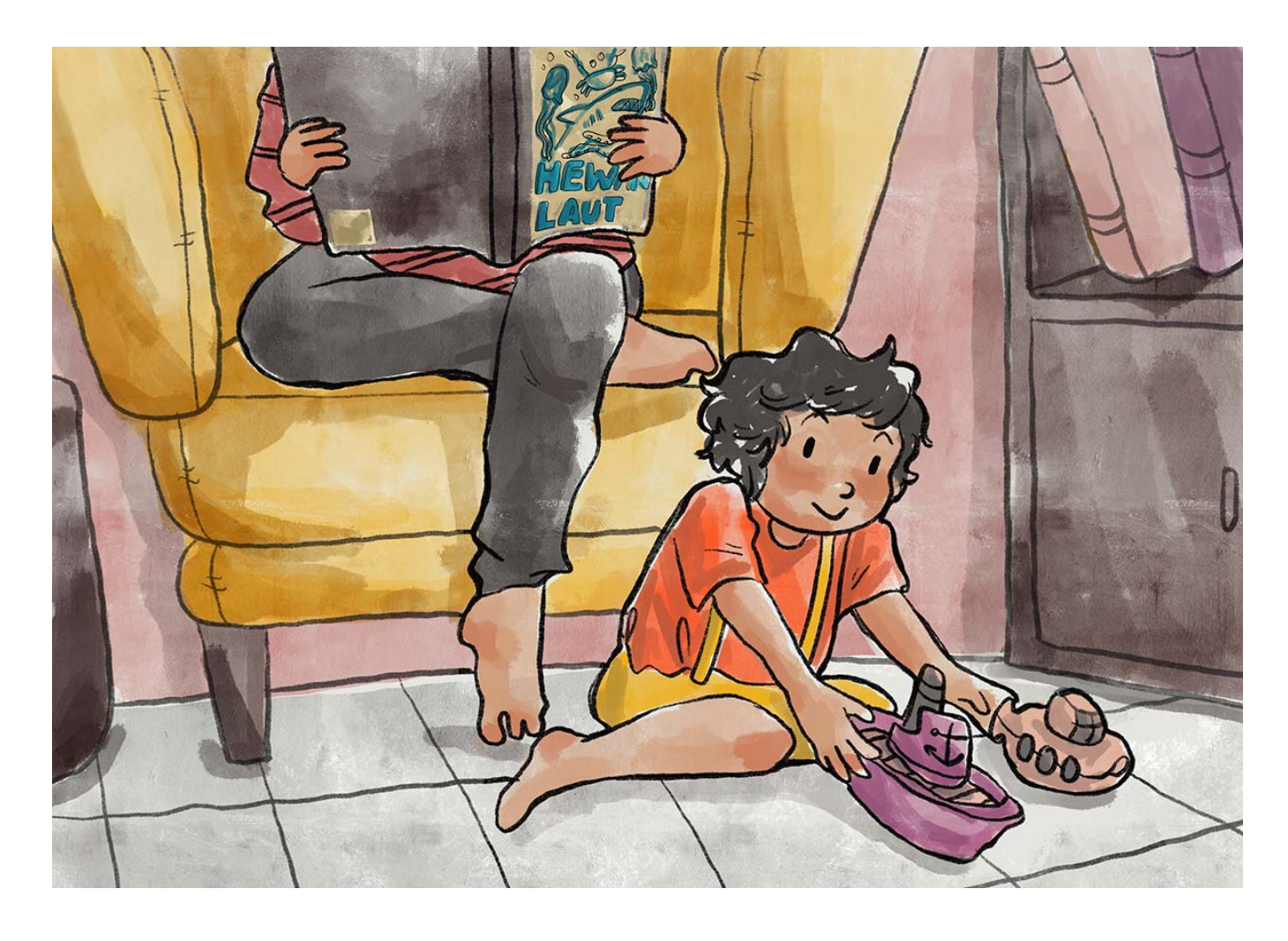
Banyu's older sister Nilam always reads a book to him before bed.