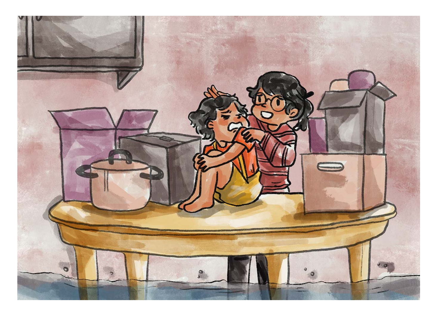
Hic! Hic! "No, Banyu. It's not a shark. It's an ironing board. Don't worry. I am here with you." But Banyu can't calm down. What if other sea creatures come?