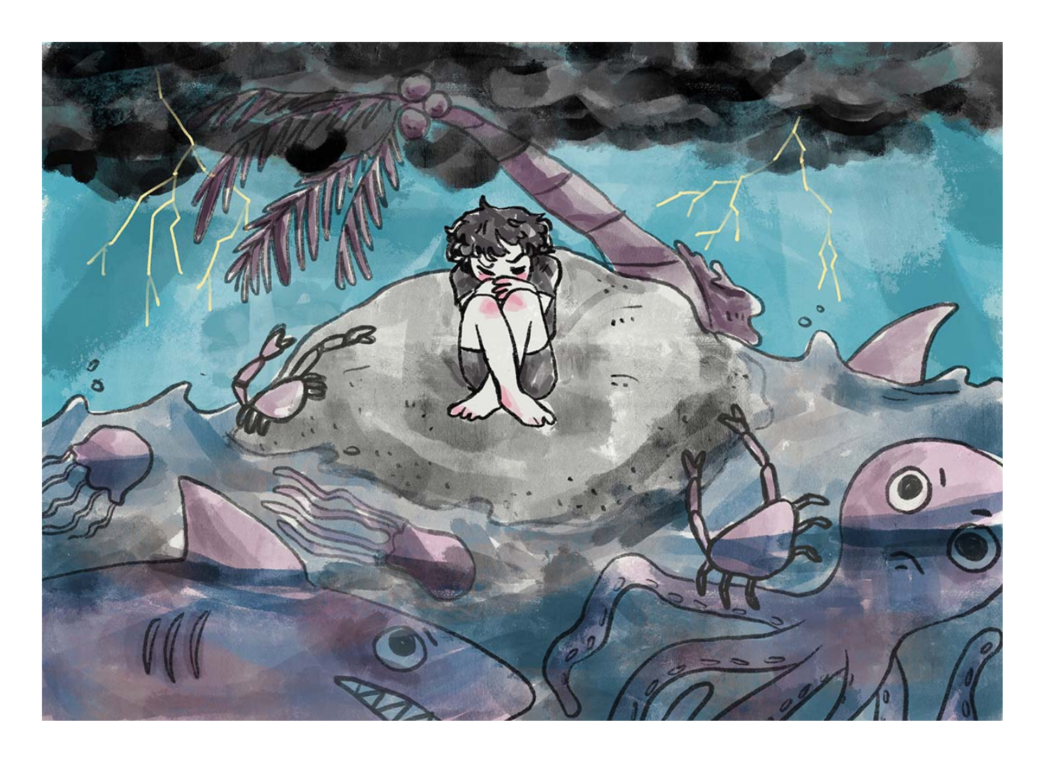
Hic! Hic!Hic! Hic!