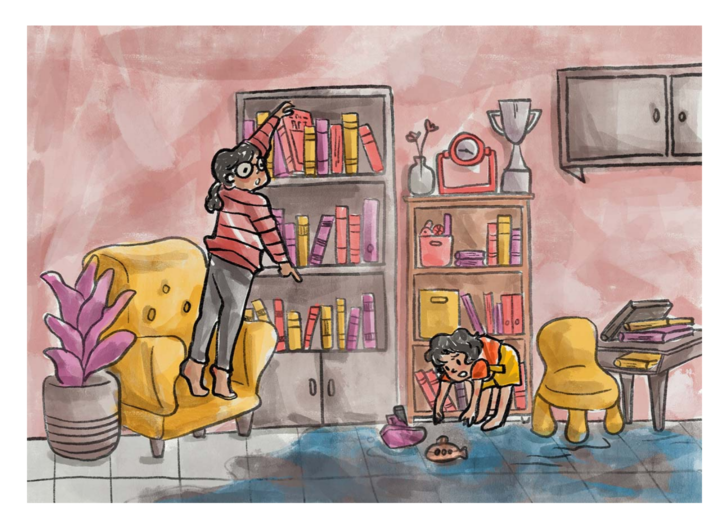
"Flood!" Nilam shouts while hurrying to save her books. "Banyu, come and help me!"The water keeps coming. There's more and more.Banyu starts to worry.