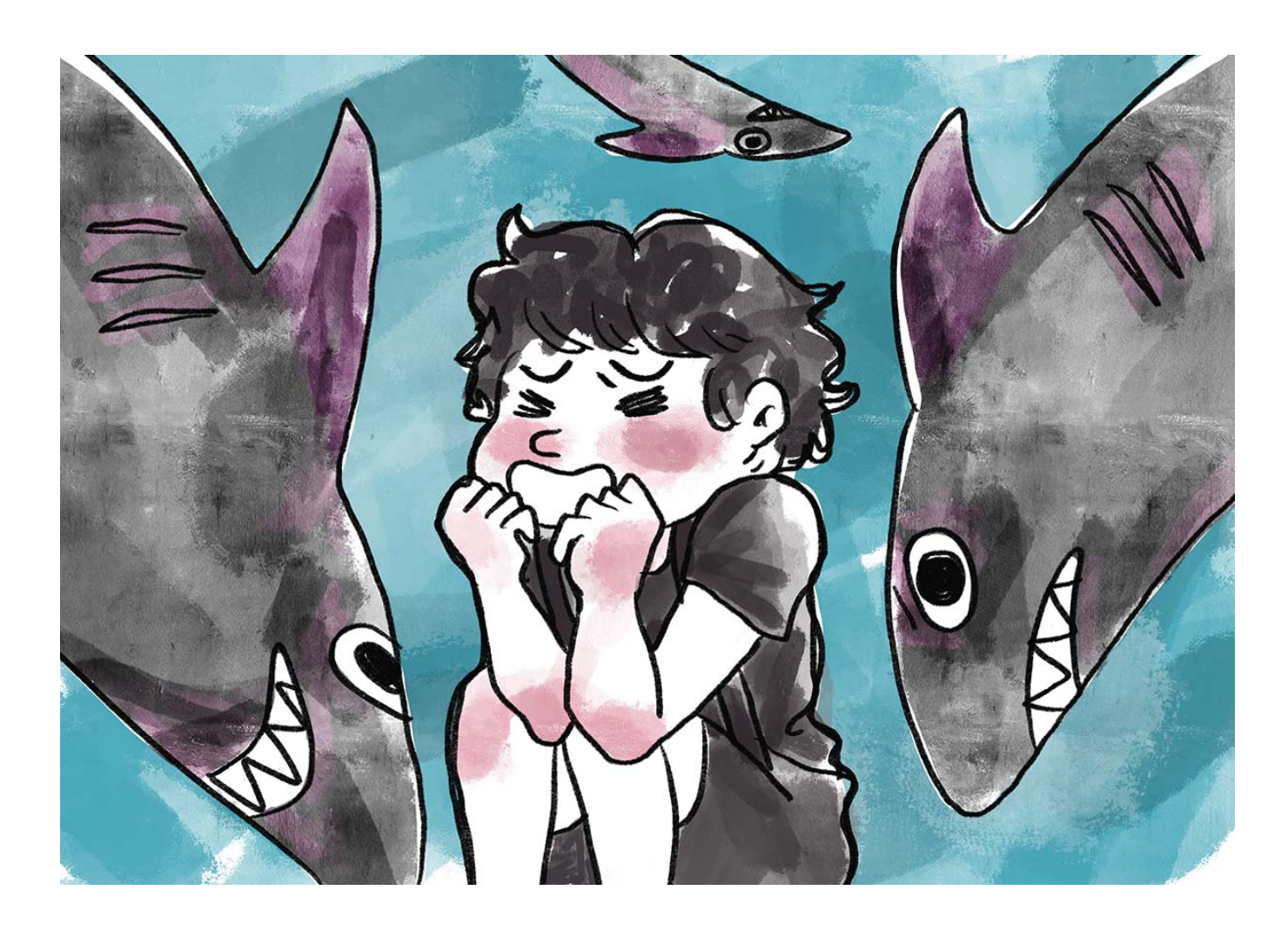
"If the fin is that big, the shark will also be big. And the teeth... Whoaaa! Help! I don't want to be bitten by the shark!"