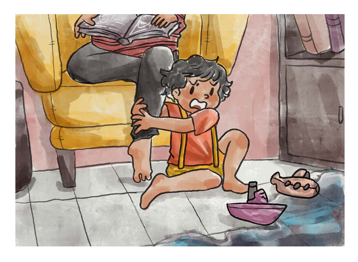
One night, Banyu feels something touch his feet.It's water! Where is it coming from?