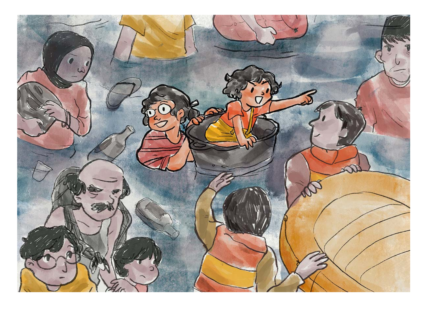
Splash! Splash!The ship rocks from side to side.Banyu's ship is not alone. There are more ships all around.They are filled with other people who are trying to stay dry.