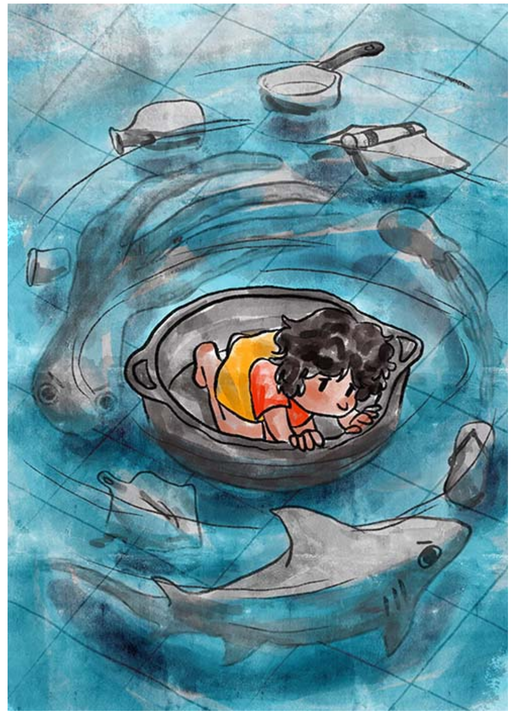
When the Flood Comes Witaru Emi