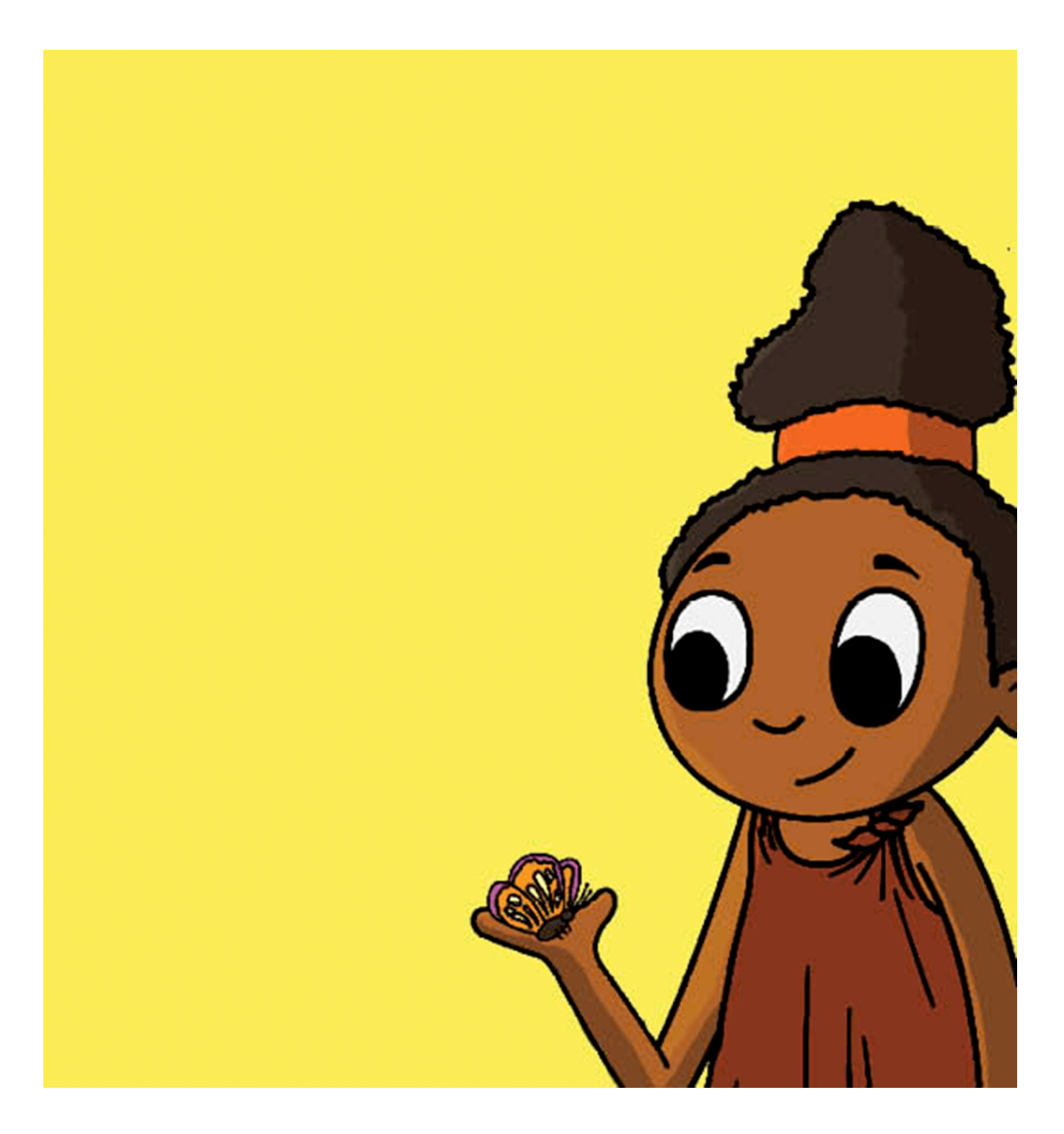
Searching for the Spirit of SpringWritten by Mosa Mahlaba Illustrated by Selina Morulane