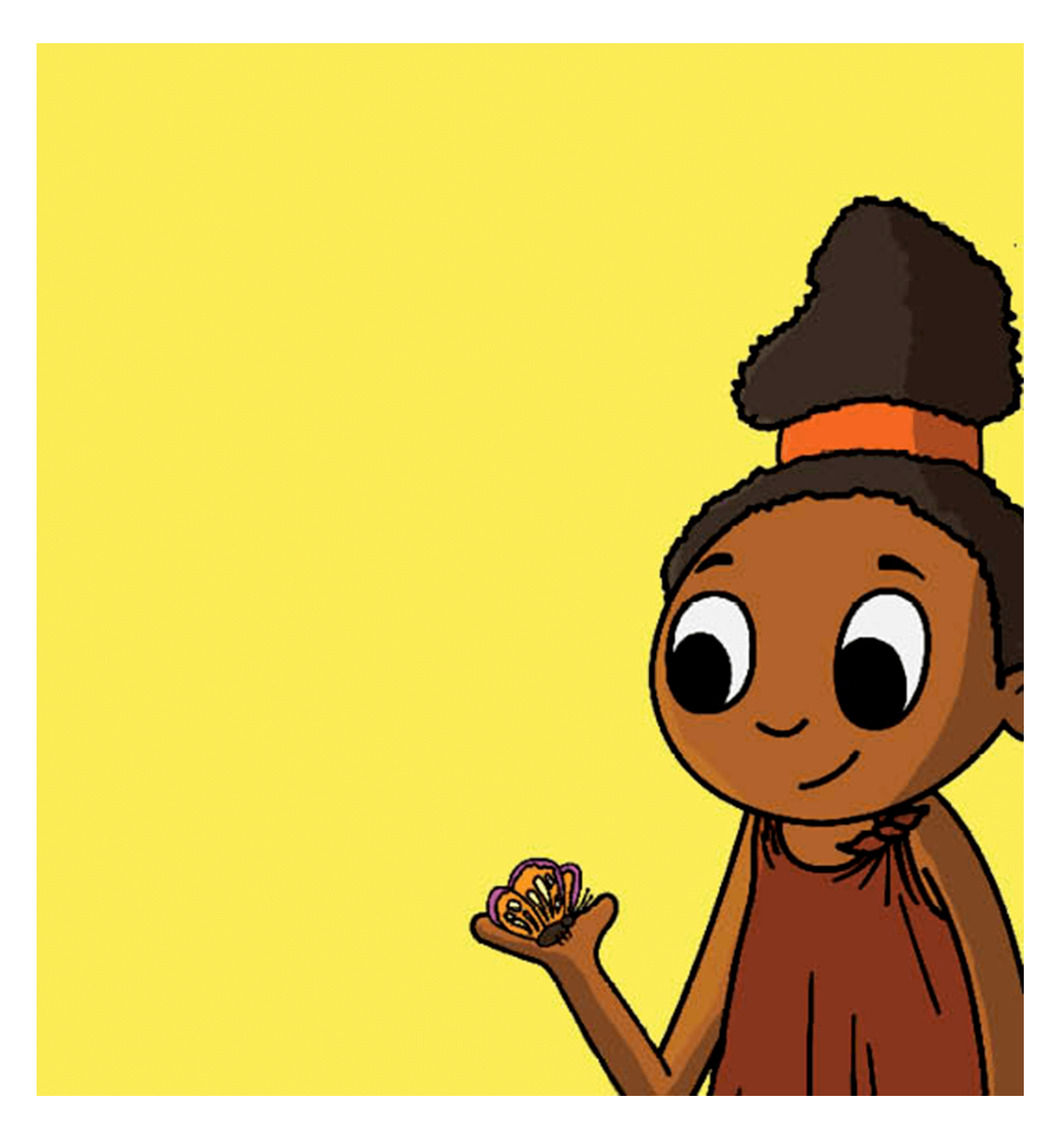
Searching for the Spirit of Spring Mosa Mahlaba