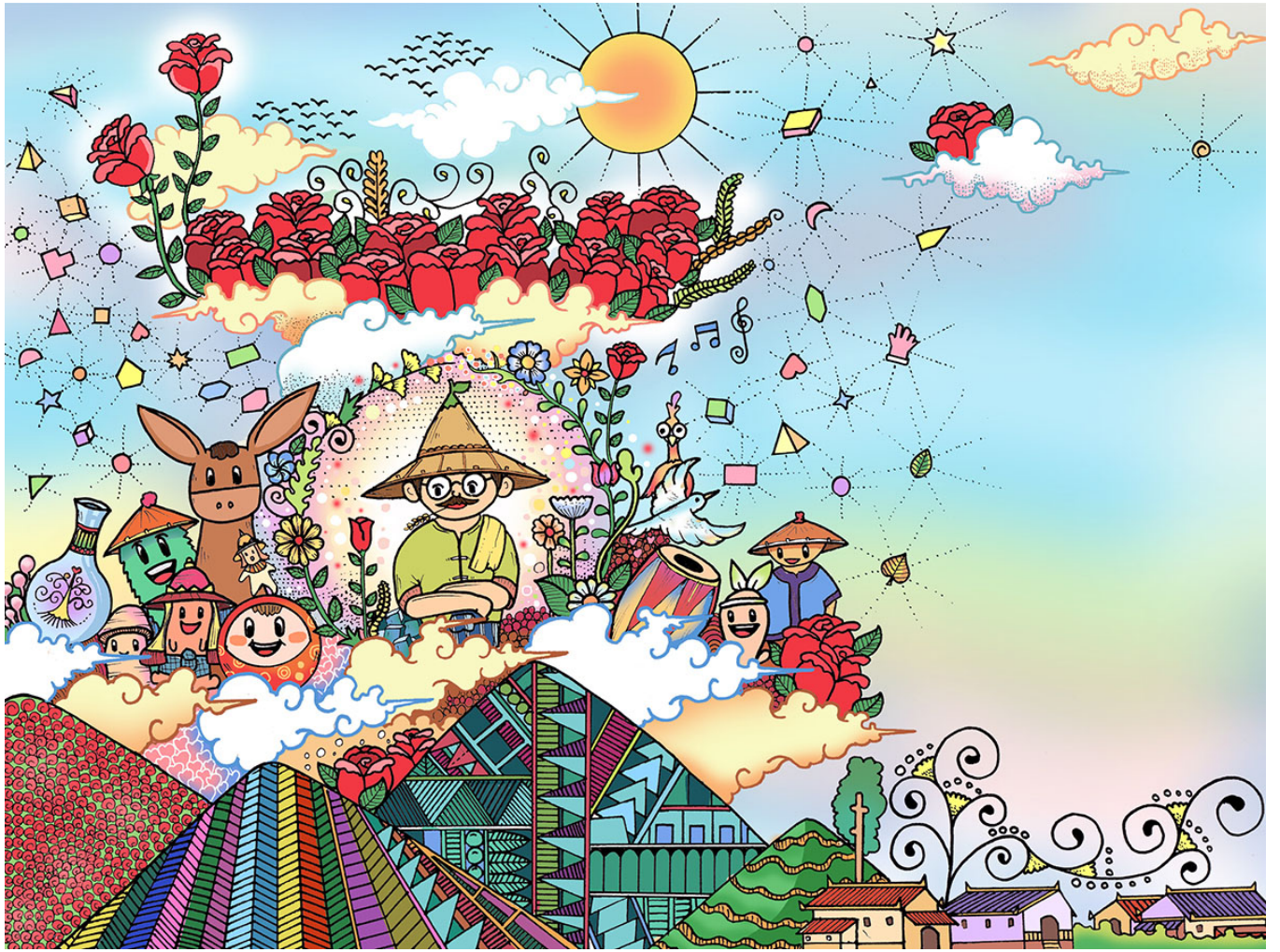
Rose Village Su Nyein Chan