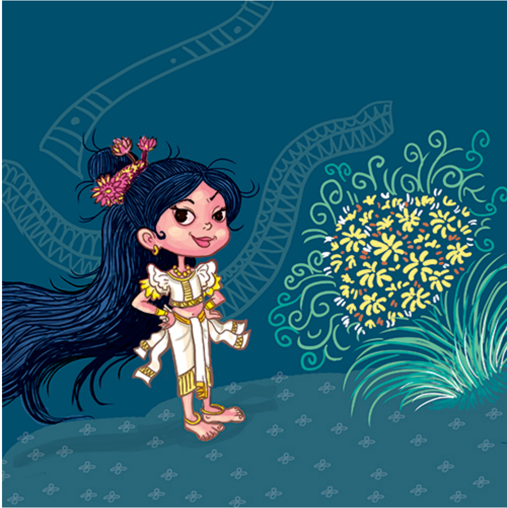
Commotion in the Palace Kaushalya Vijani