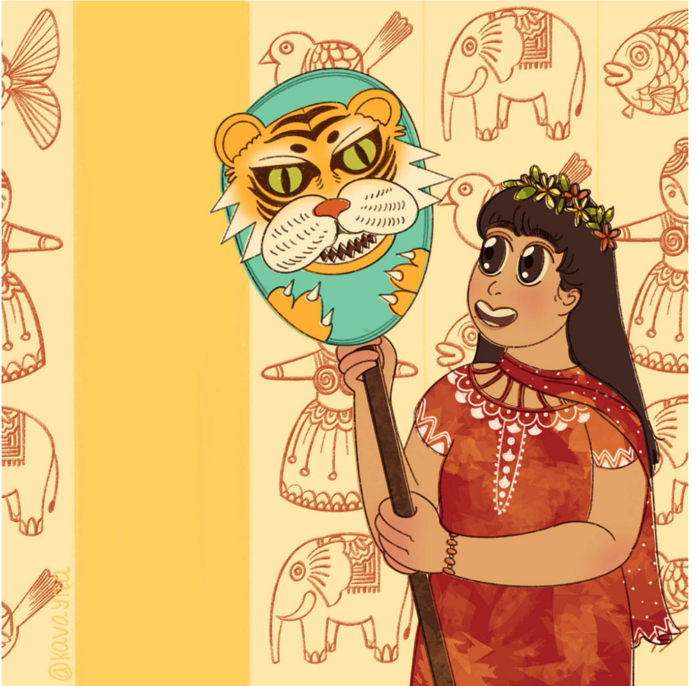
Pohela Boishakh HerStory Foundation