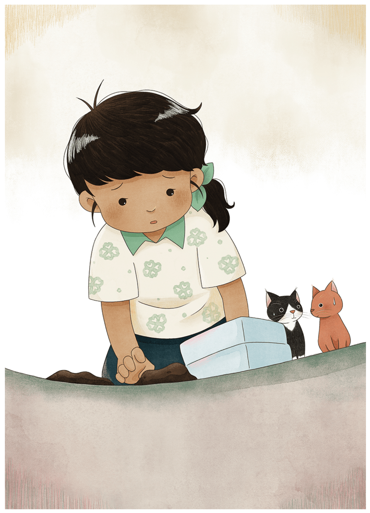
This was so troublesome. I had to start over again. I planted the