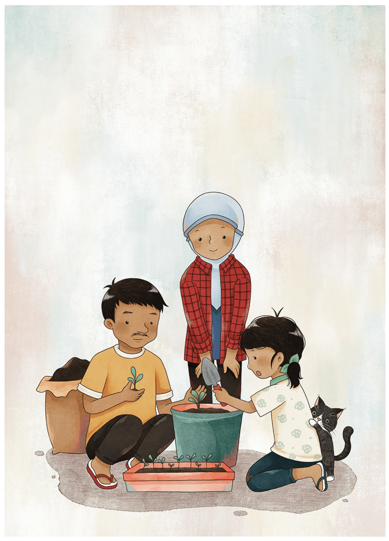
"Loosen the soil, add the compost, then mix well. Plant the seed in the