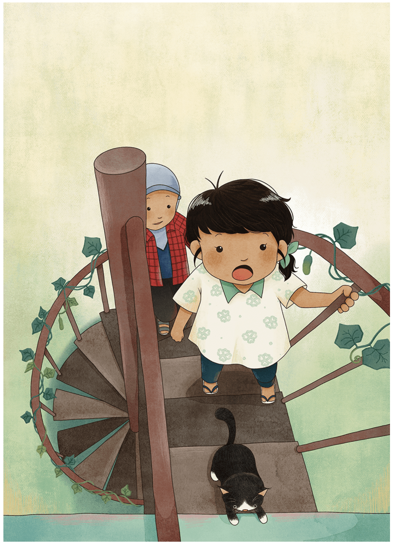
I definitely wanted to. I was curious what kind of plants were up there.