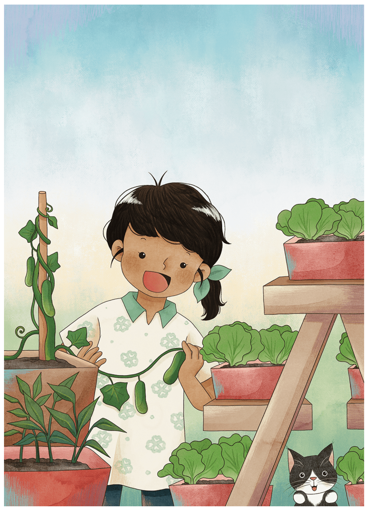
While walking around, I observed the leaves and the stems of the