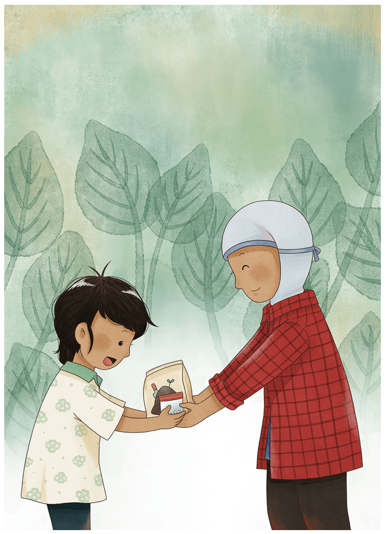
"Here are some spinach seeds and fertilizer. Try to plant them at