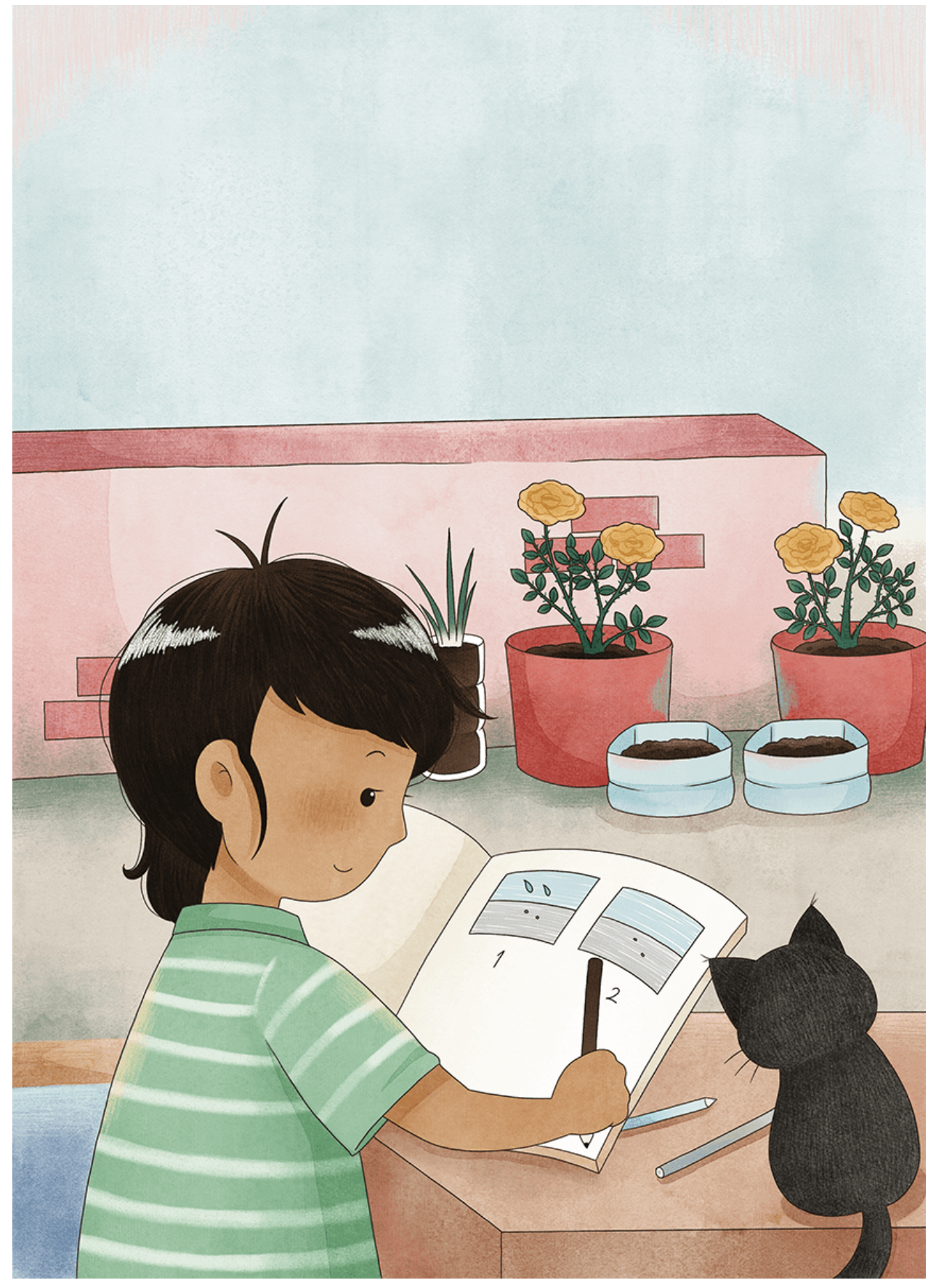
Every day I checked on my seeds. I also remembered to water them