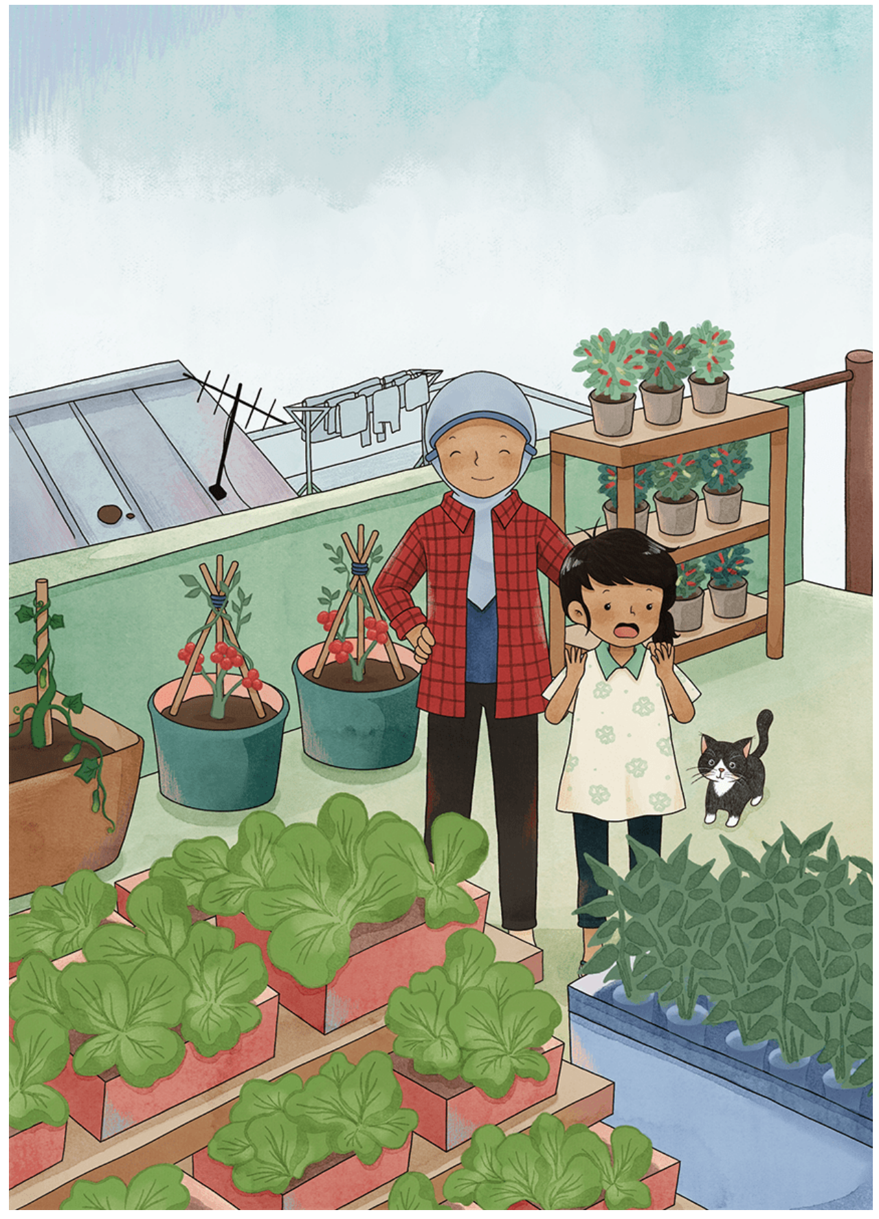
"Whoa! Why do you have so many vegetables, Mbak?" "To sell them.