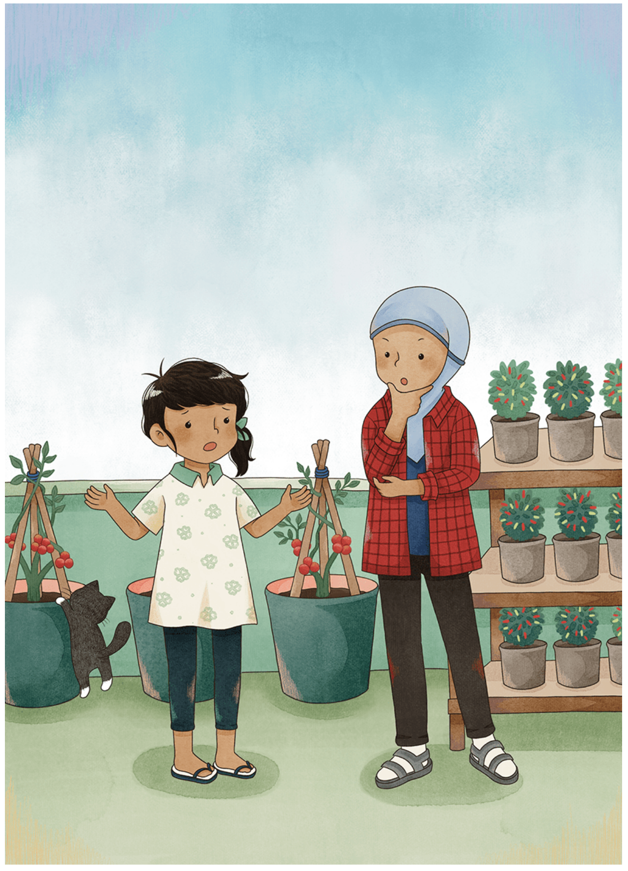
"Mbak, I'd also like to farm, but my plants are never this fertile. Please