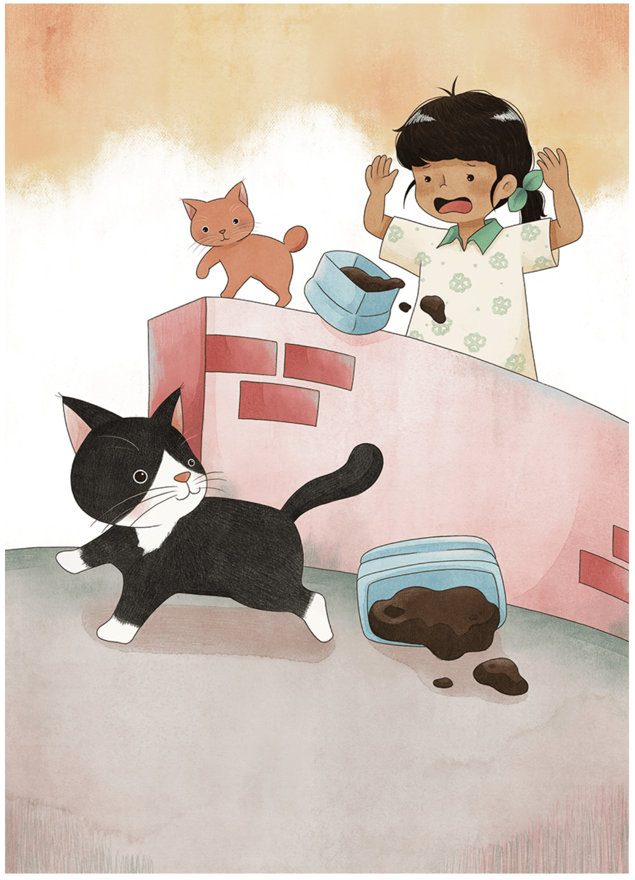
Done! I would wait for the spinach seeds to grow. I hoped this would