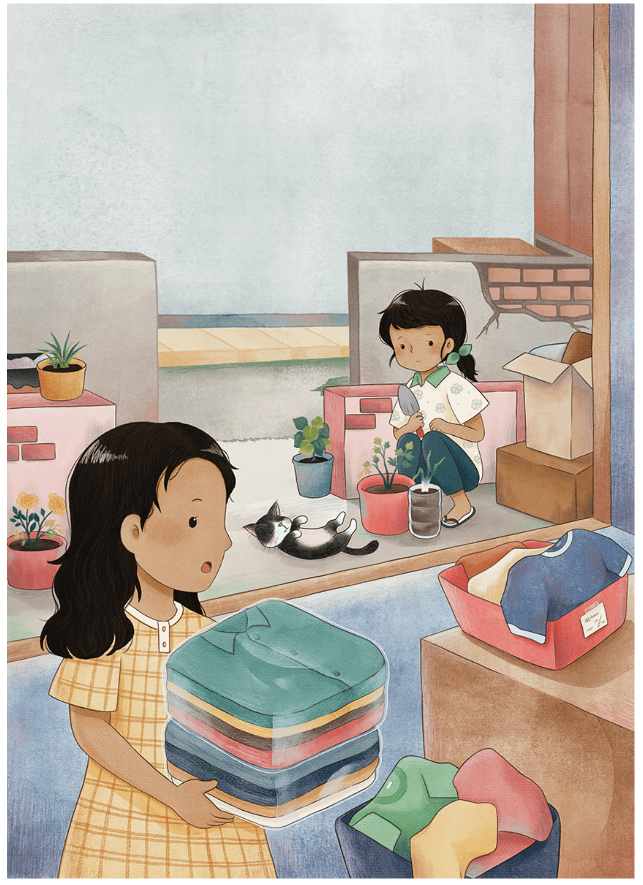
What was wrong with my plants? The stem was skinny, and some