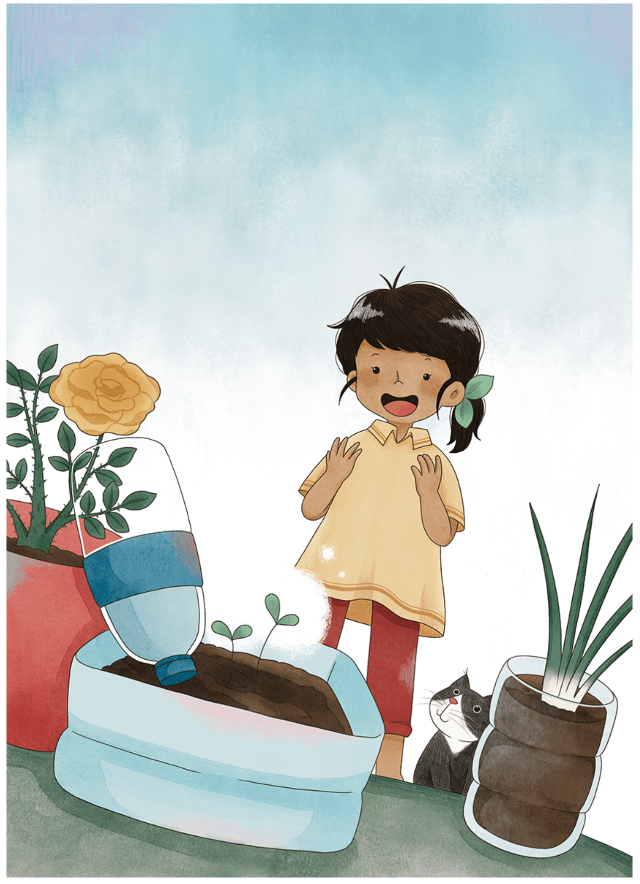
Whoa! My spinach seeds grew! Waiting for the seeds to grow had