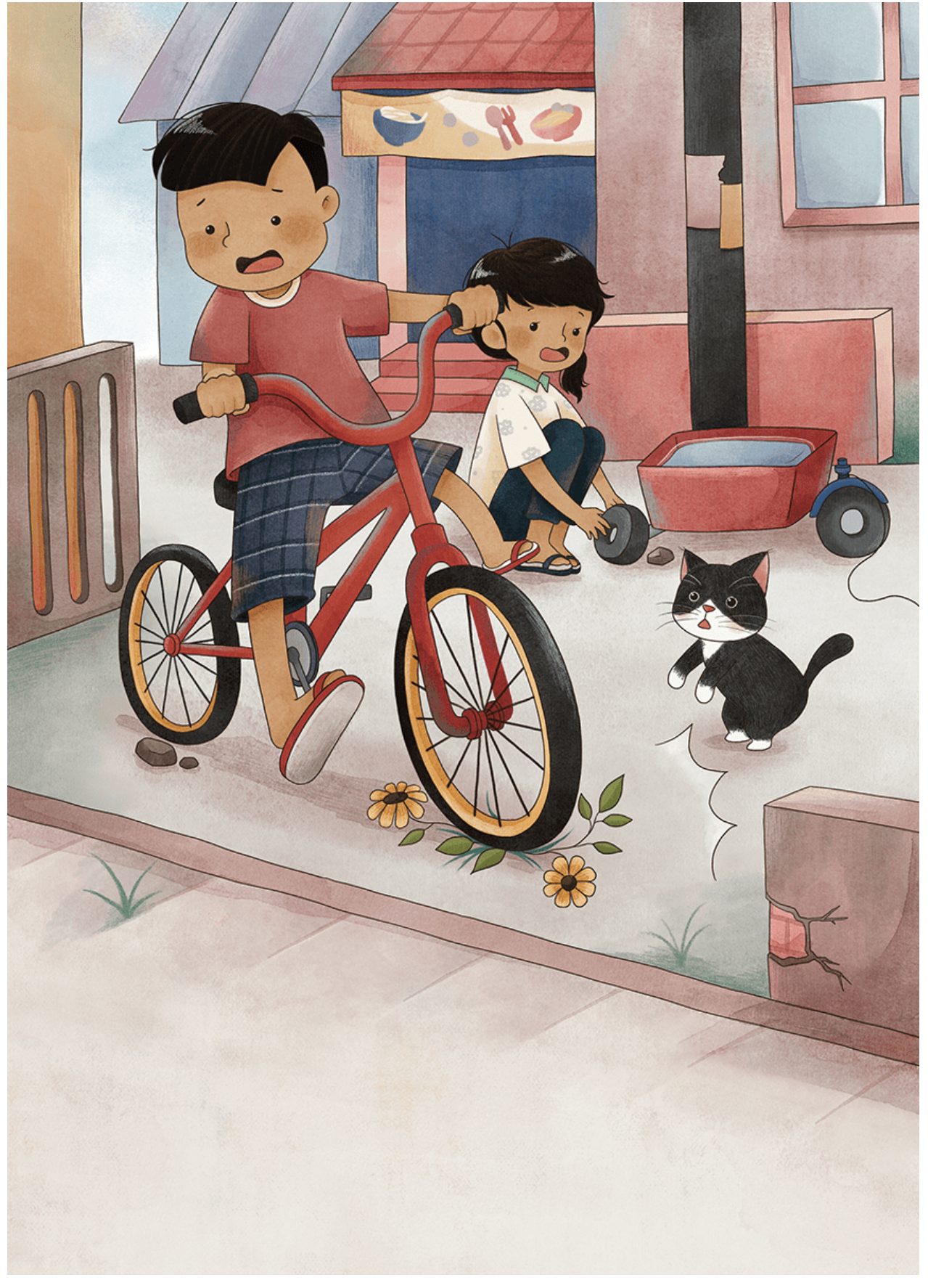
I sped up so I could quickly go back to my plants. Oh no, a wheel from