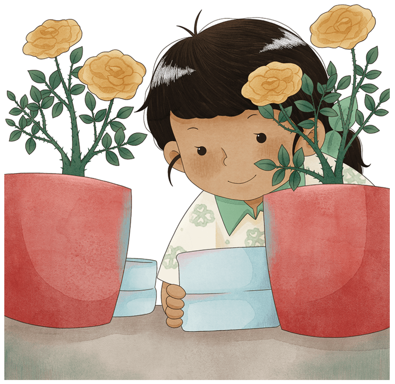
Aha! This place looked safe. Hopefully the thorns from the roses would