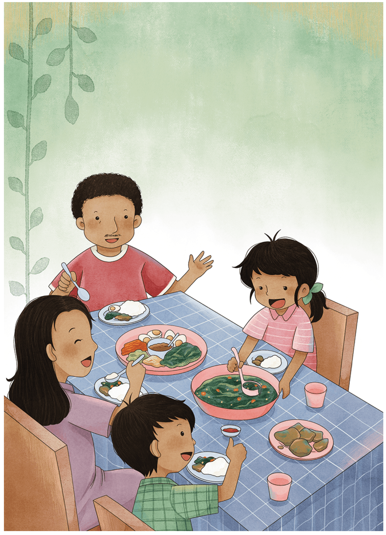
Day by day, the tiny buds grew bigger and bigger. The fresh leaves