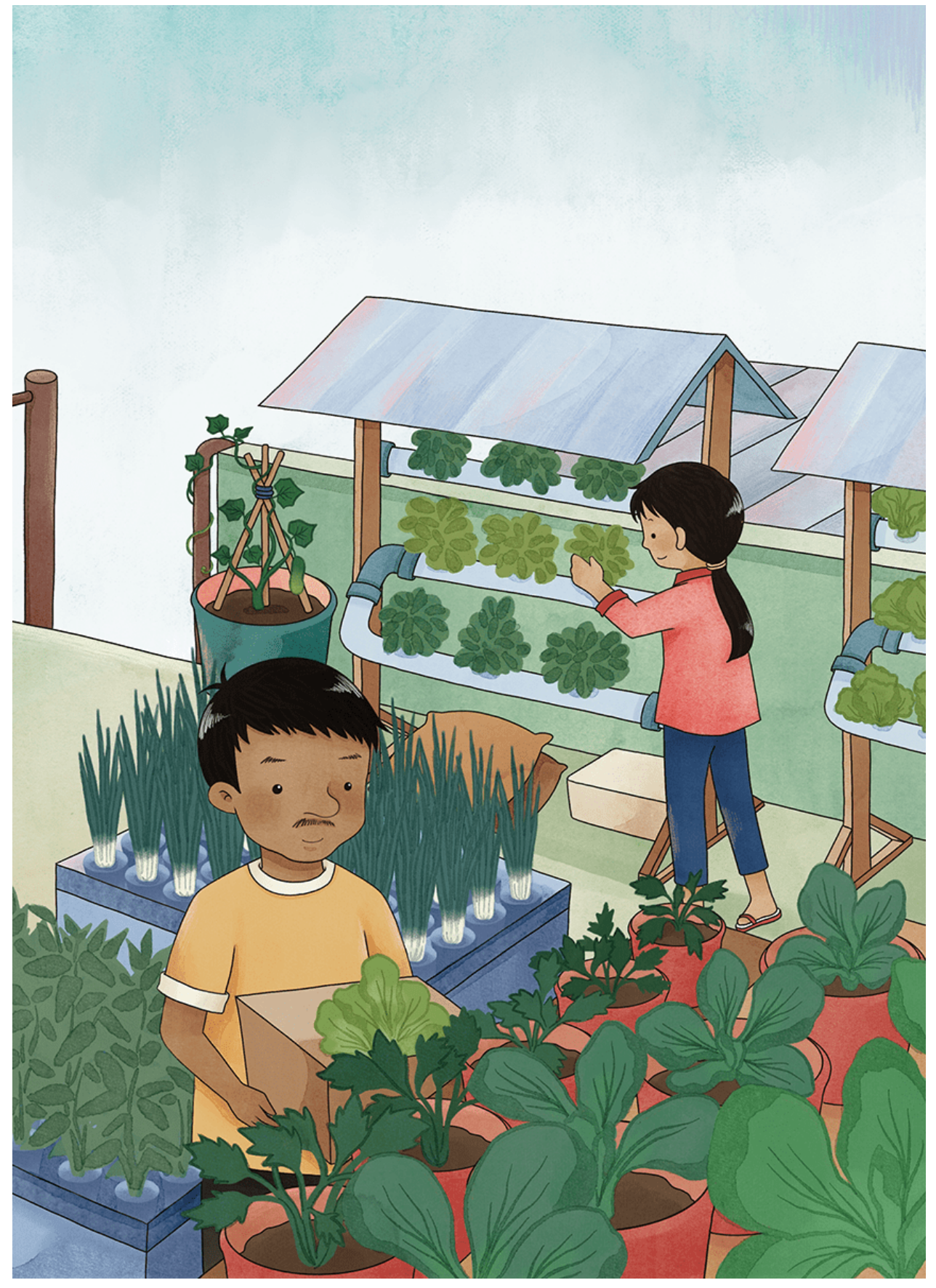
Mbak Kinan told me about all the steps from planting the seeds to