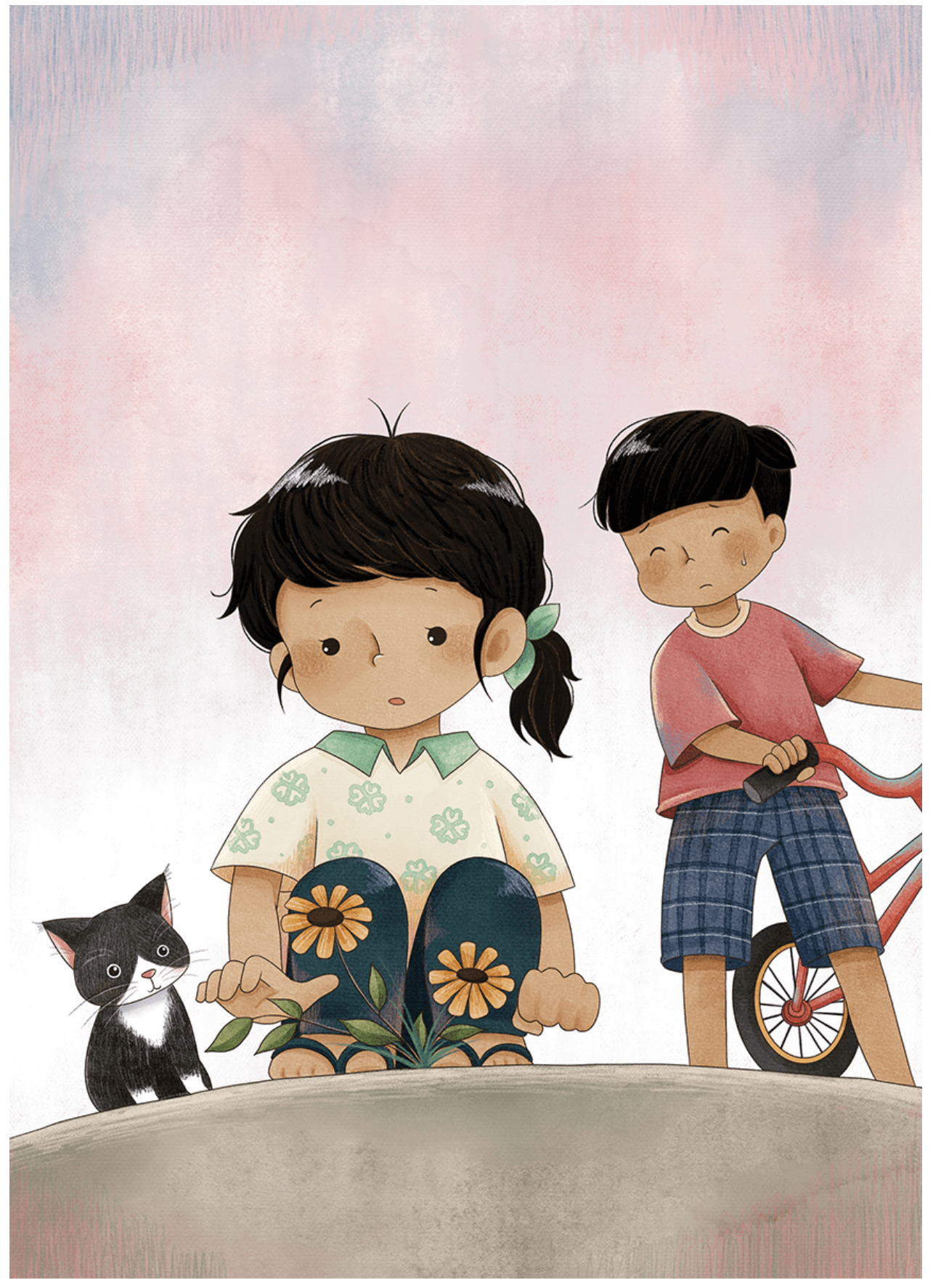
"Next time be careful. Look, you ruined this plant," I scolded