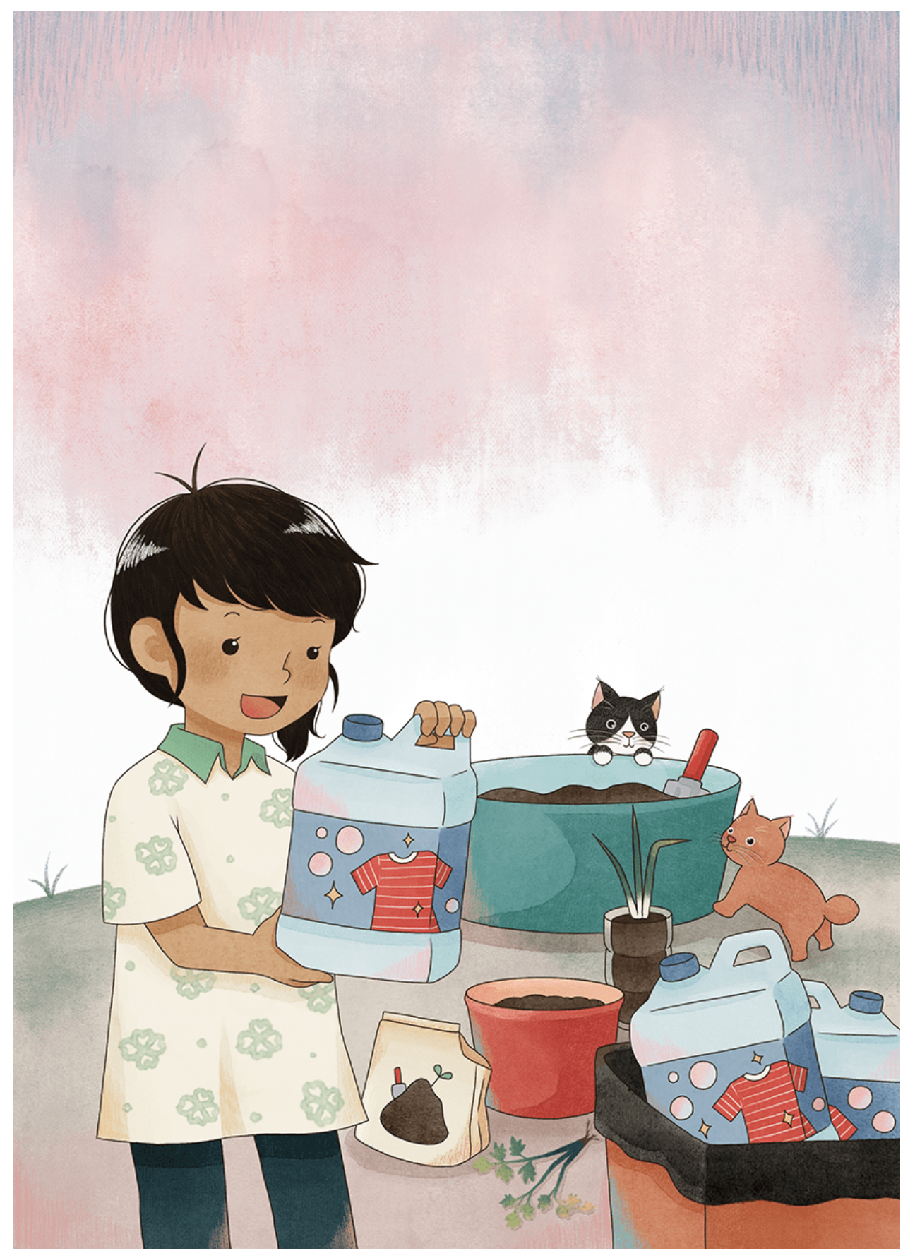
As soon as I got home, I jumped right in. Oh, I needed another pot. Aha!