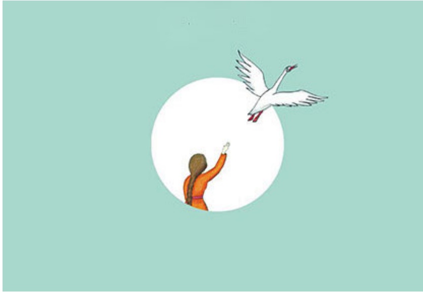
Swan Lake T.Narankhuu