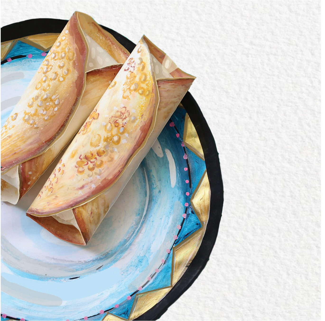
Wonderful WordsGur - molasses