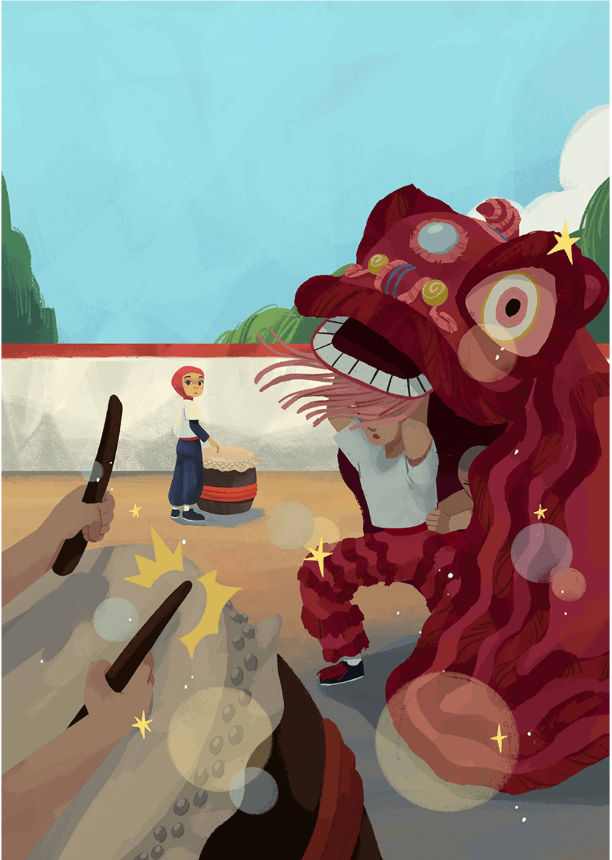
Meanwhile, the lion dance performers were able to easily lift the red