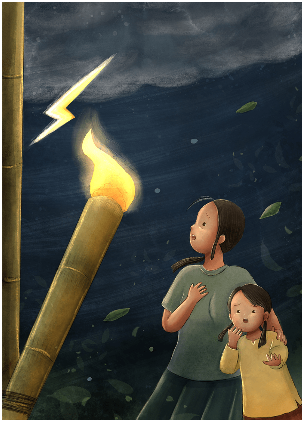
However, a gust of wind made the flames of the torch sway back and