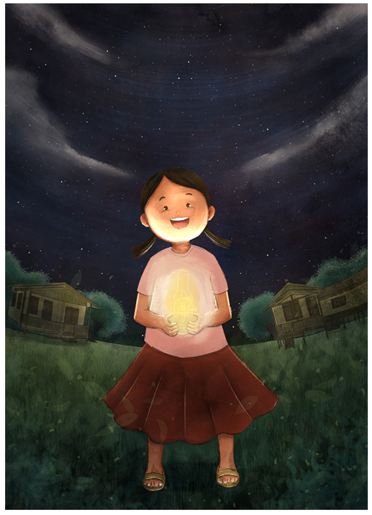
The Lantern Girl Rasya Swarnasta