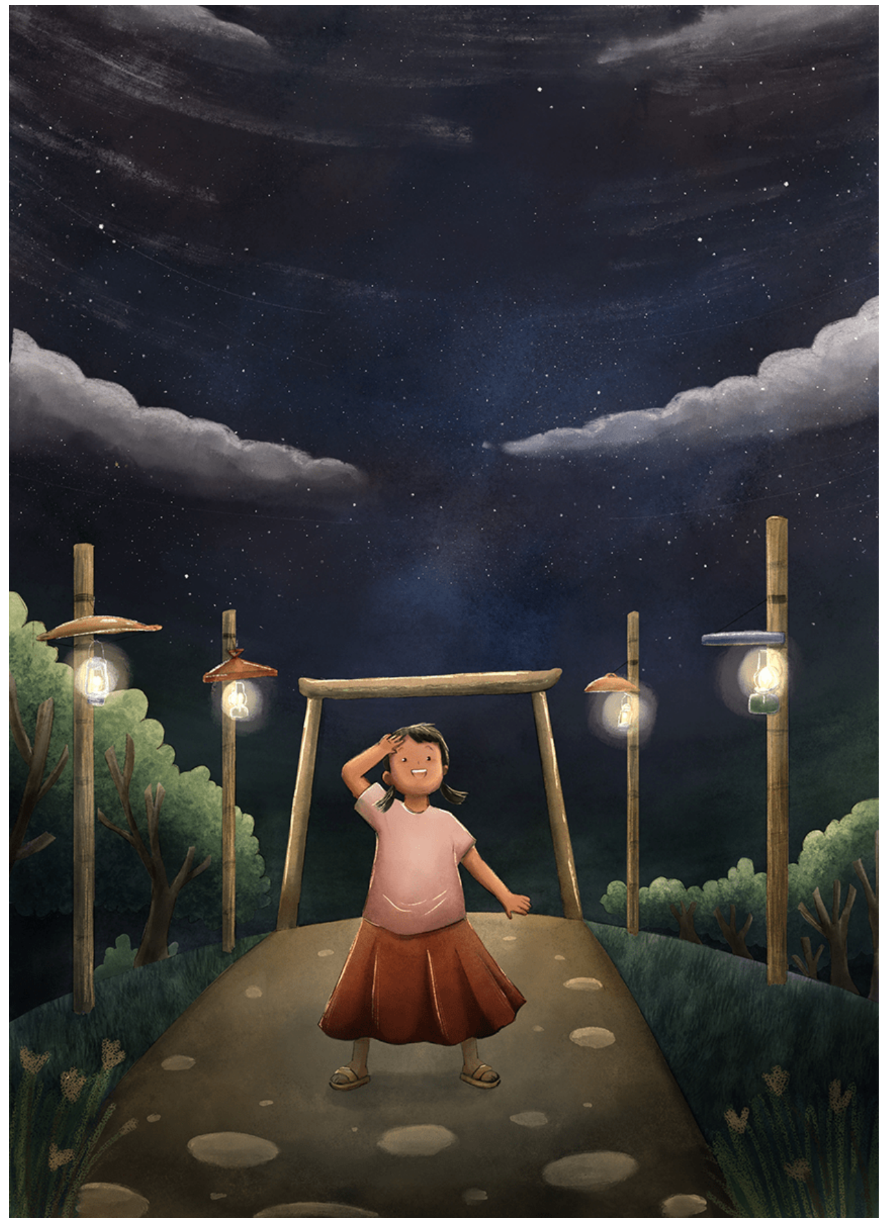
Now, the streets in Nora's village weren't as dark. Even though there