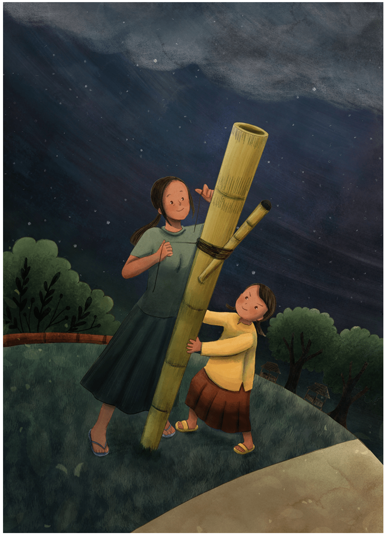
"Wow, that's a good idea," Mom replied. "Let's try it."