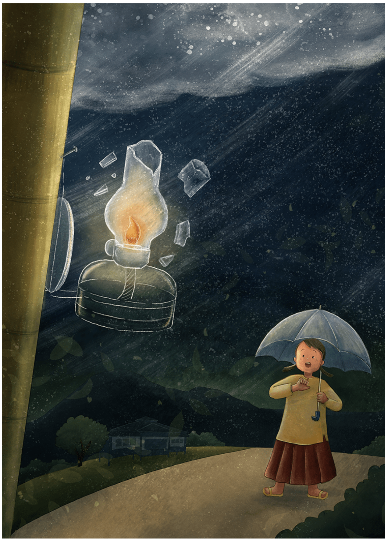
Pitter... Patter... rain!