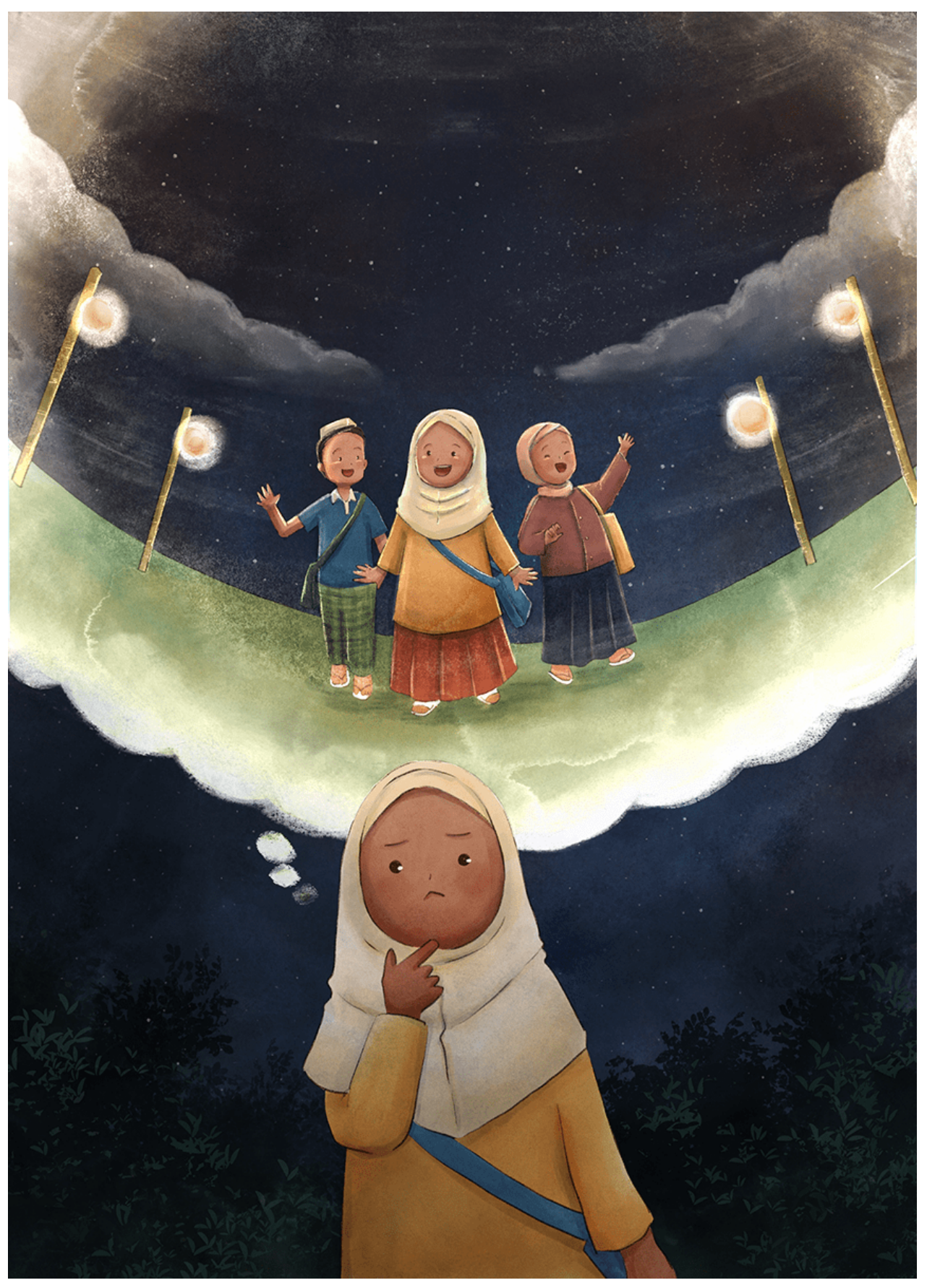
Nora walked home alone. Ah, if only they had electricity in their village.