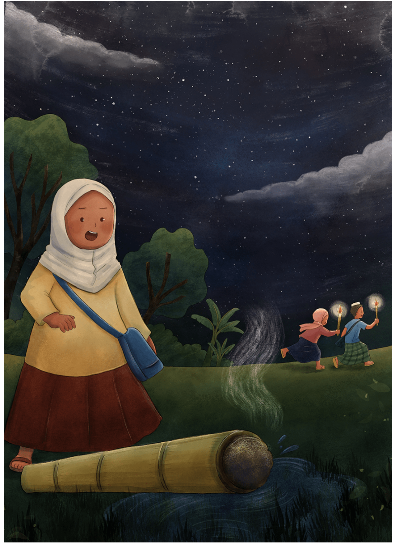
... Nora's torch fell and went out!