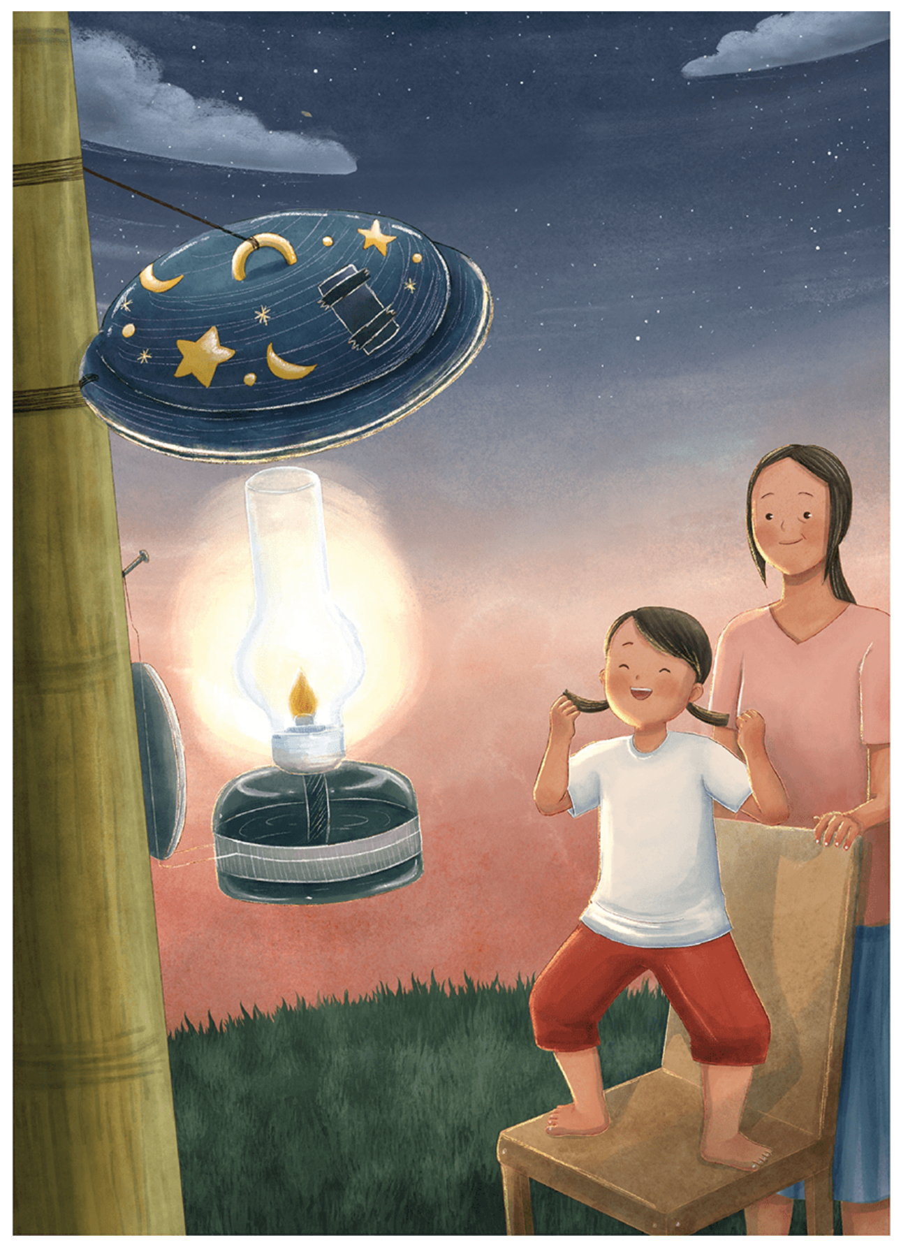
They erected a pole and attached the lamp to it.