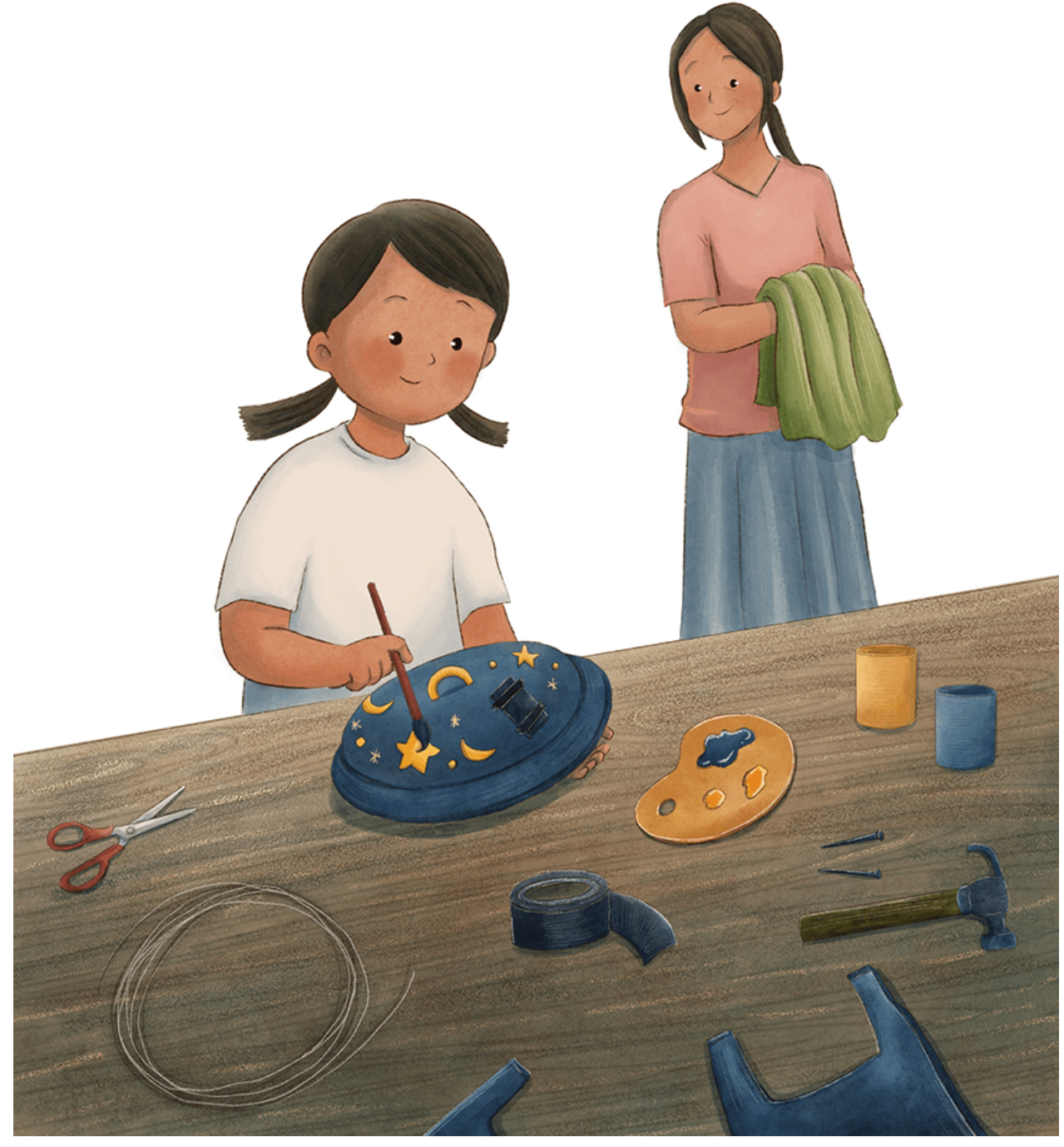
Nora covered the holes on the pot lid with used plastic bags. She