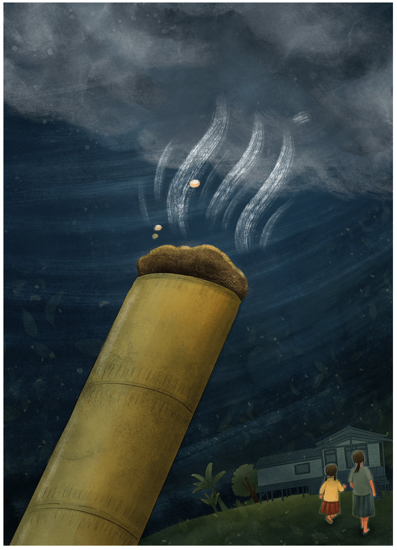
The wind grew stronger. Mom and Nora hurried back inside the house.