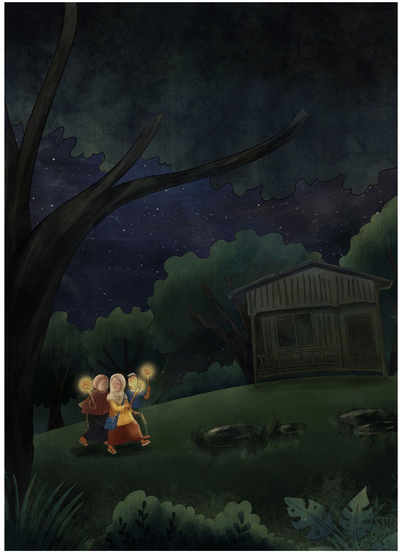
"It looks like it's going to rain soon. We have to get home quickly," said