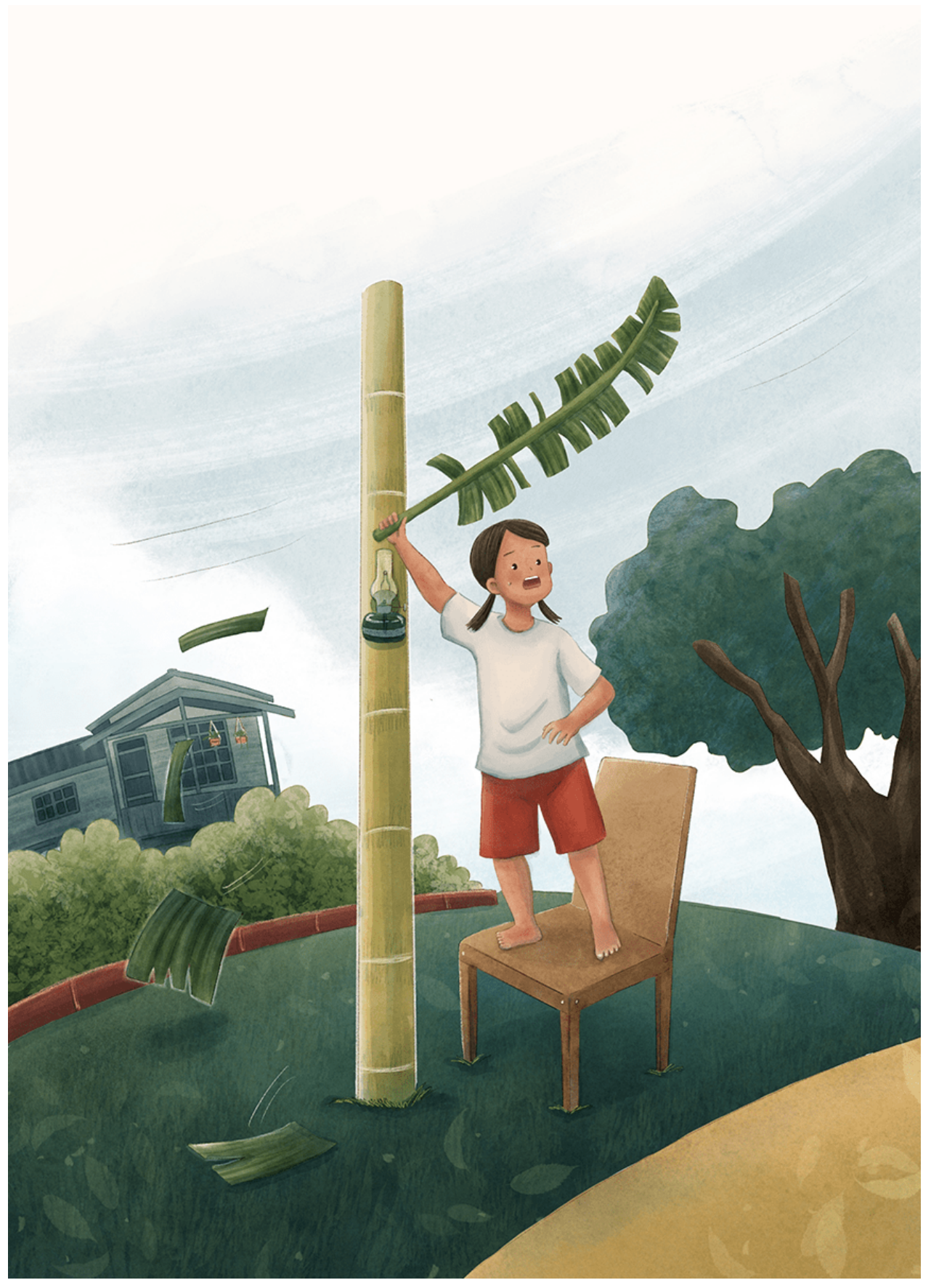
What about a banana leaf? No, that wouldn't work. A gust of wind would