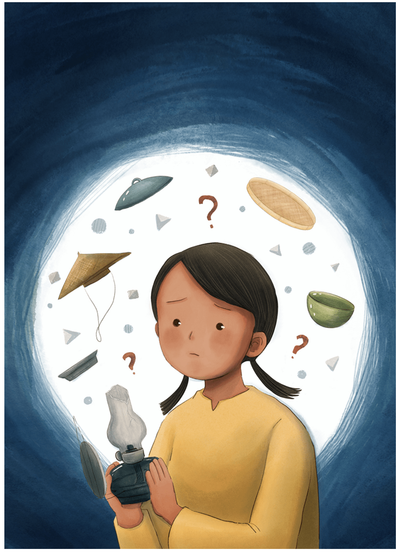
What could Nora use?