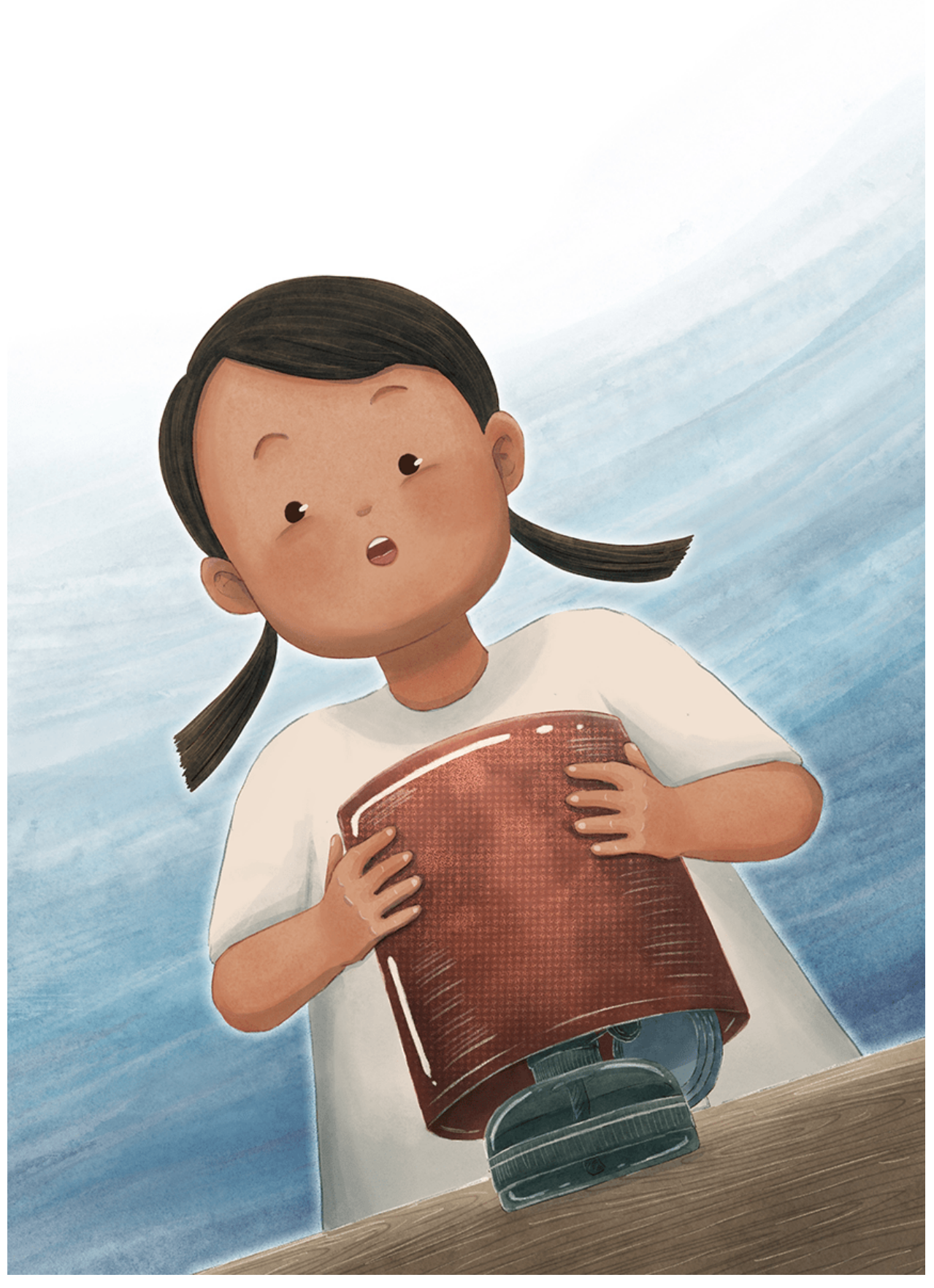
Nora tried a used can. Oh no, the lamp was completely covered. Not