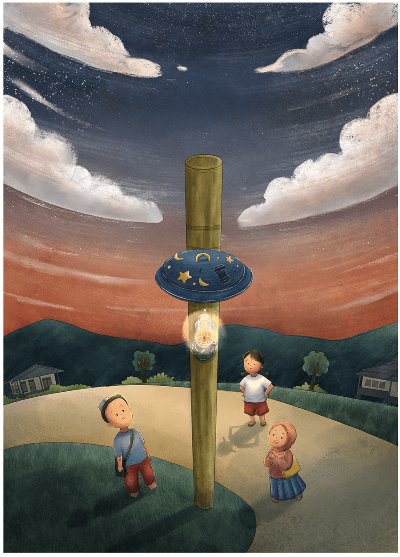
"Whoa, this is so cool!" exclaimed Devon.