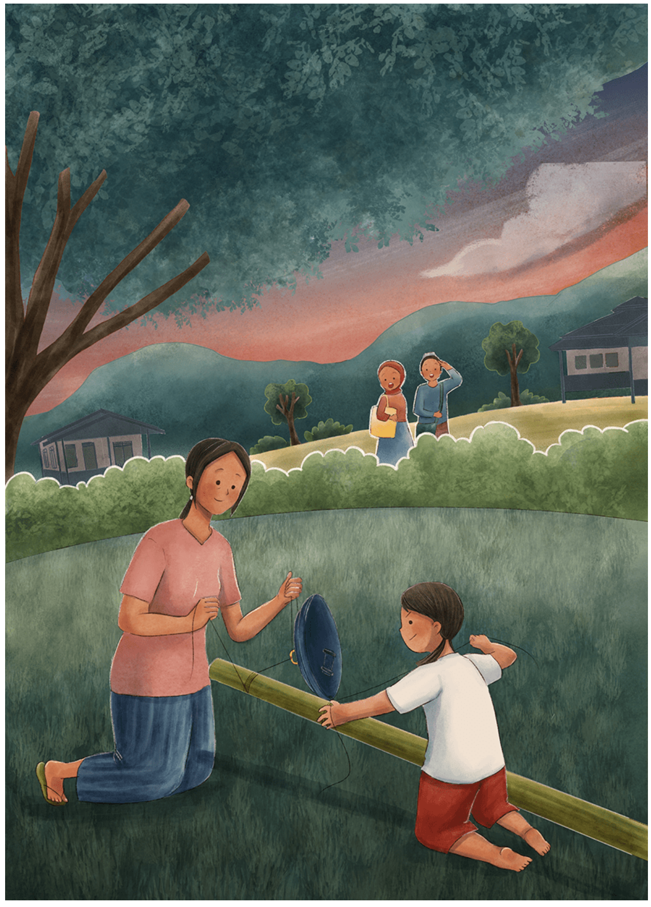
Now the pot lid was ready to be used.