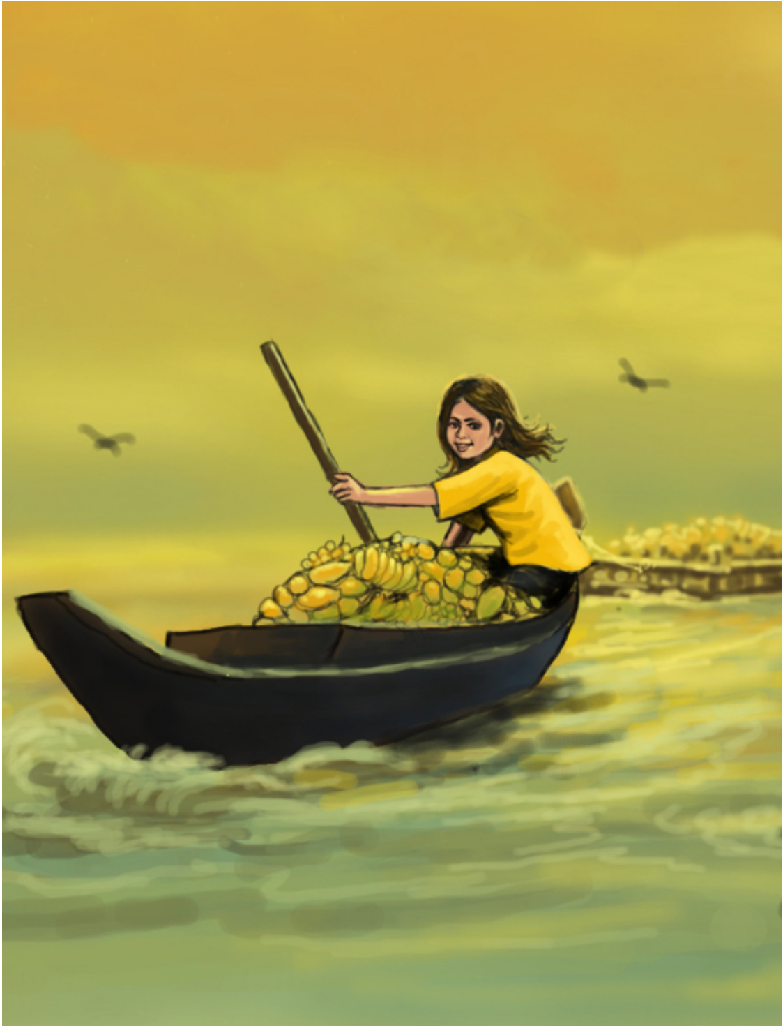
Floating Garden Iem Tithseiha