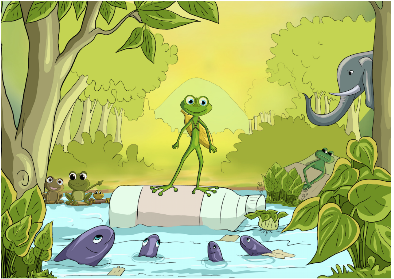
The Clever Frog Sat Dich