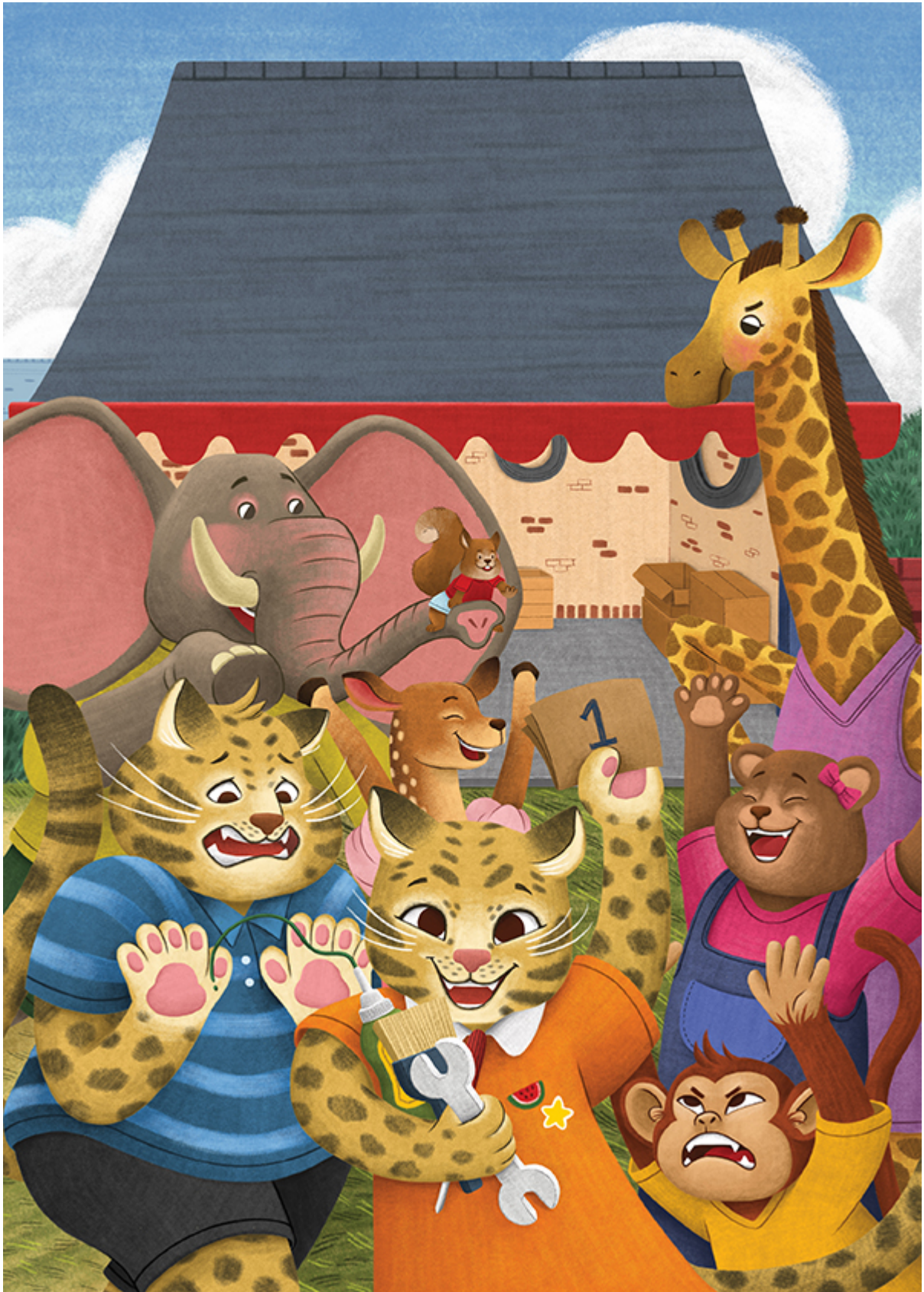
A Day at the Workshop Oky E. Noorsari