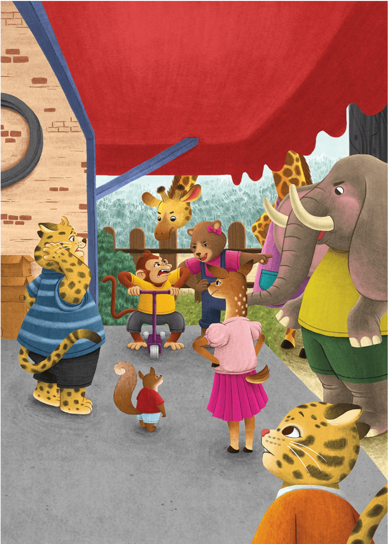
The workshop was bustling. The customers were arguing to get served