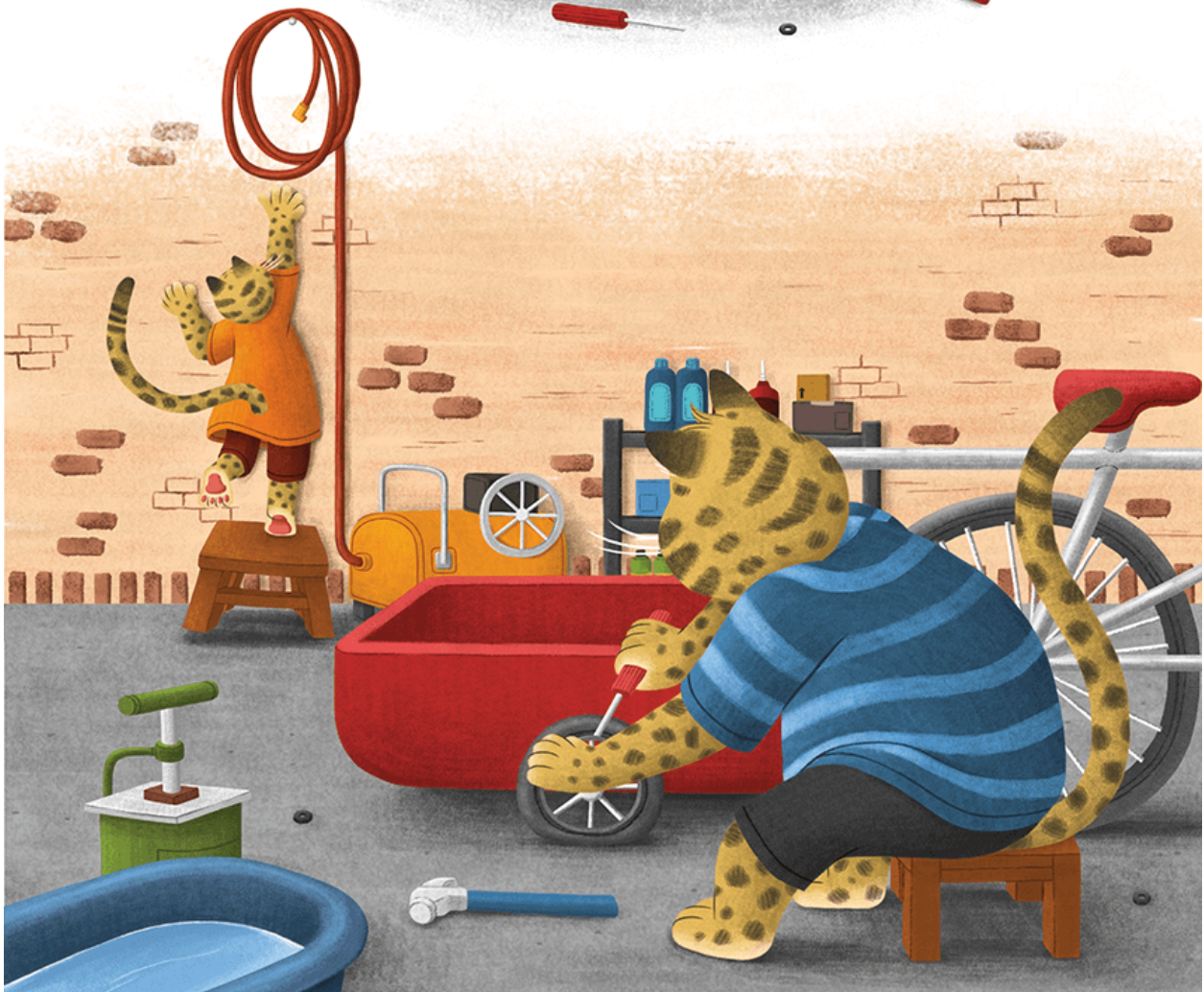
Oh no, Arum couldn't reach the hose.