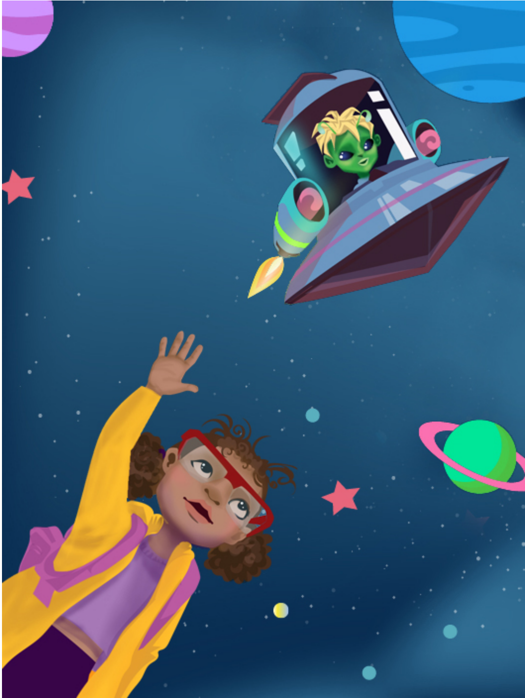
Green Star Prum Kunthearo