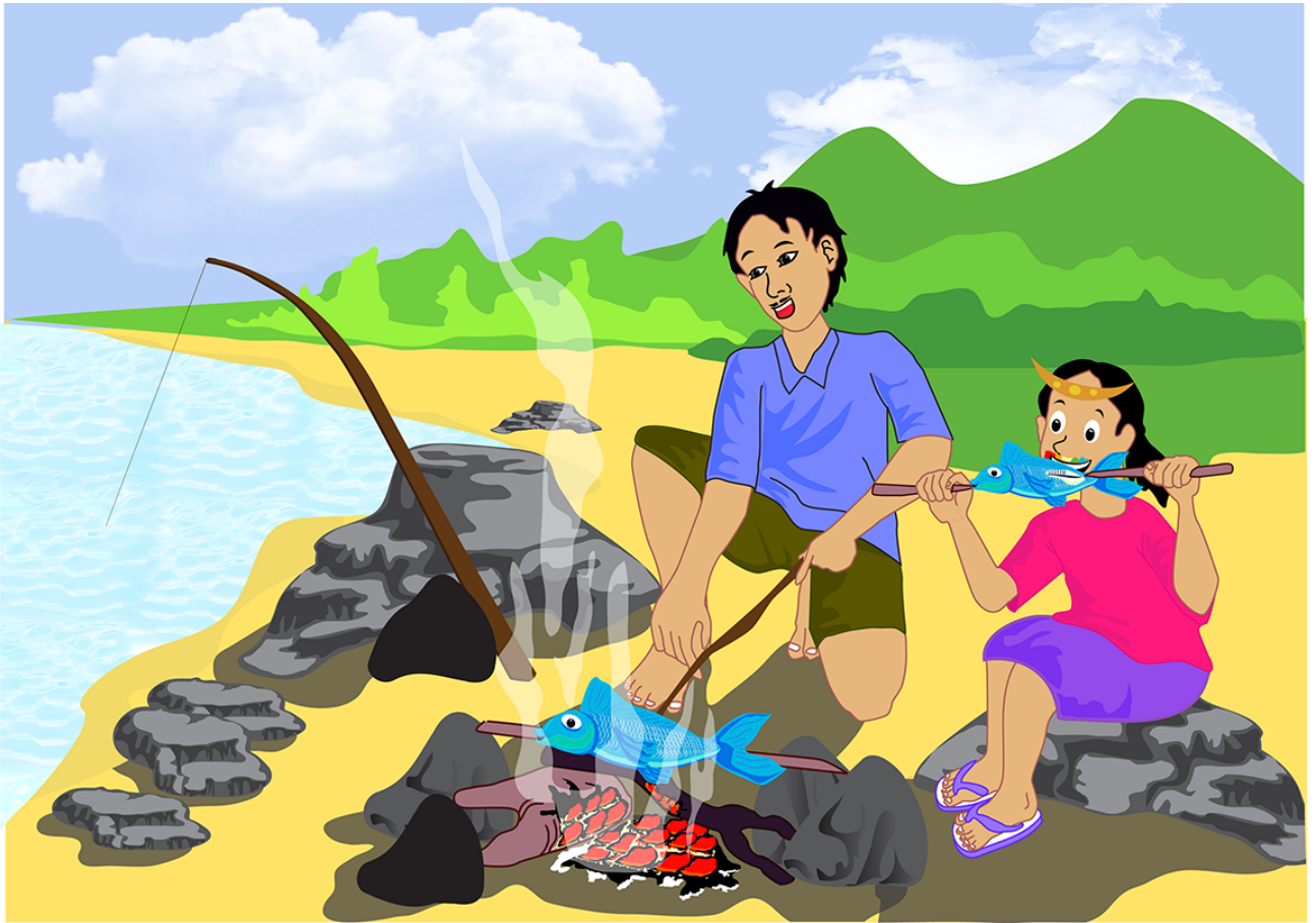
A blue fish.