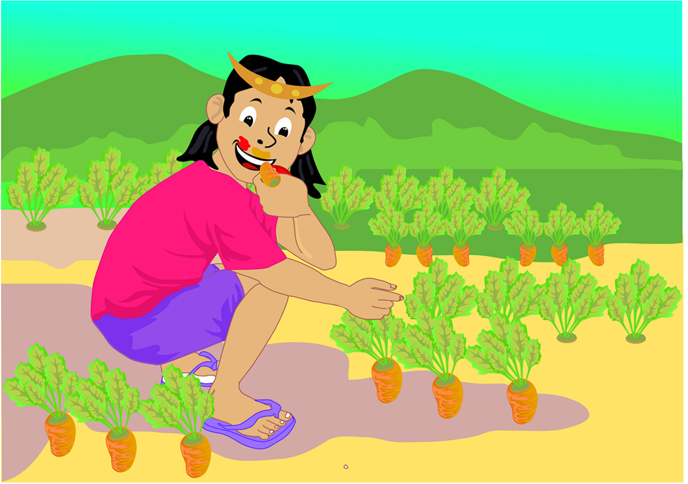
An orange carrot.