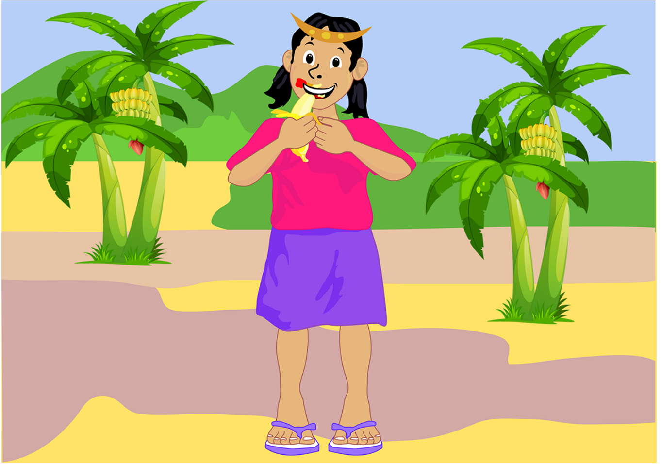
A yellow banana.