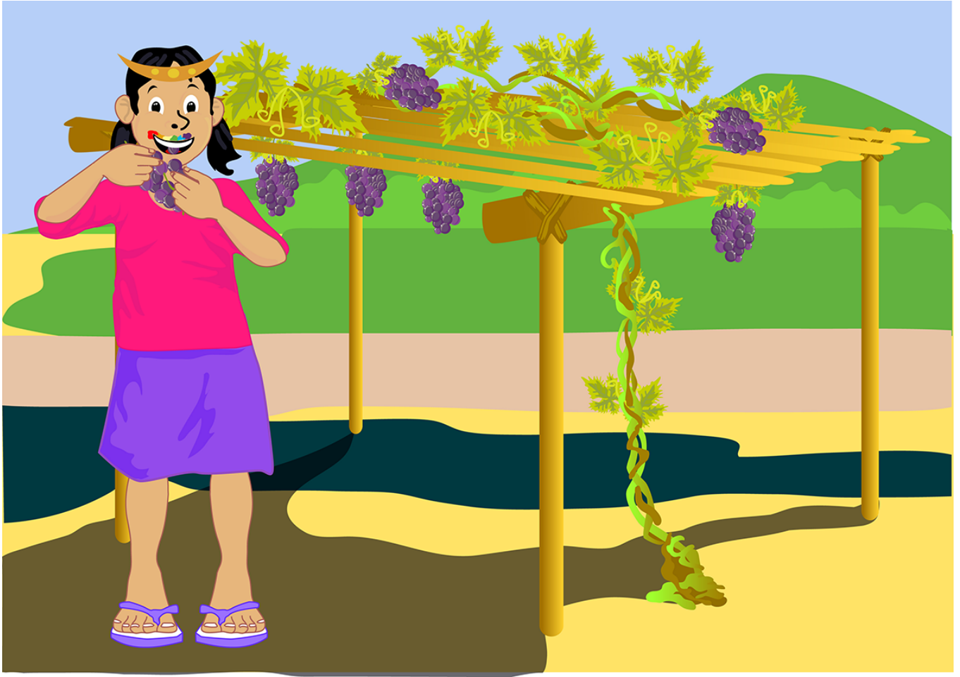
A purple grape.