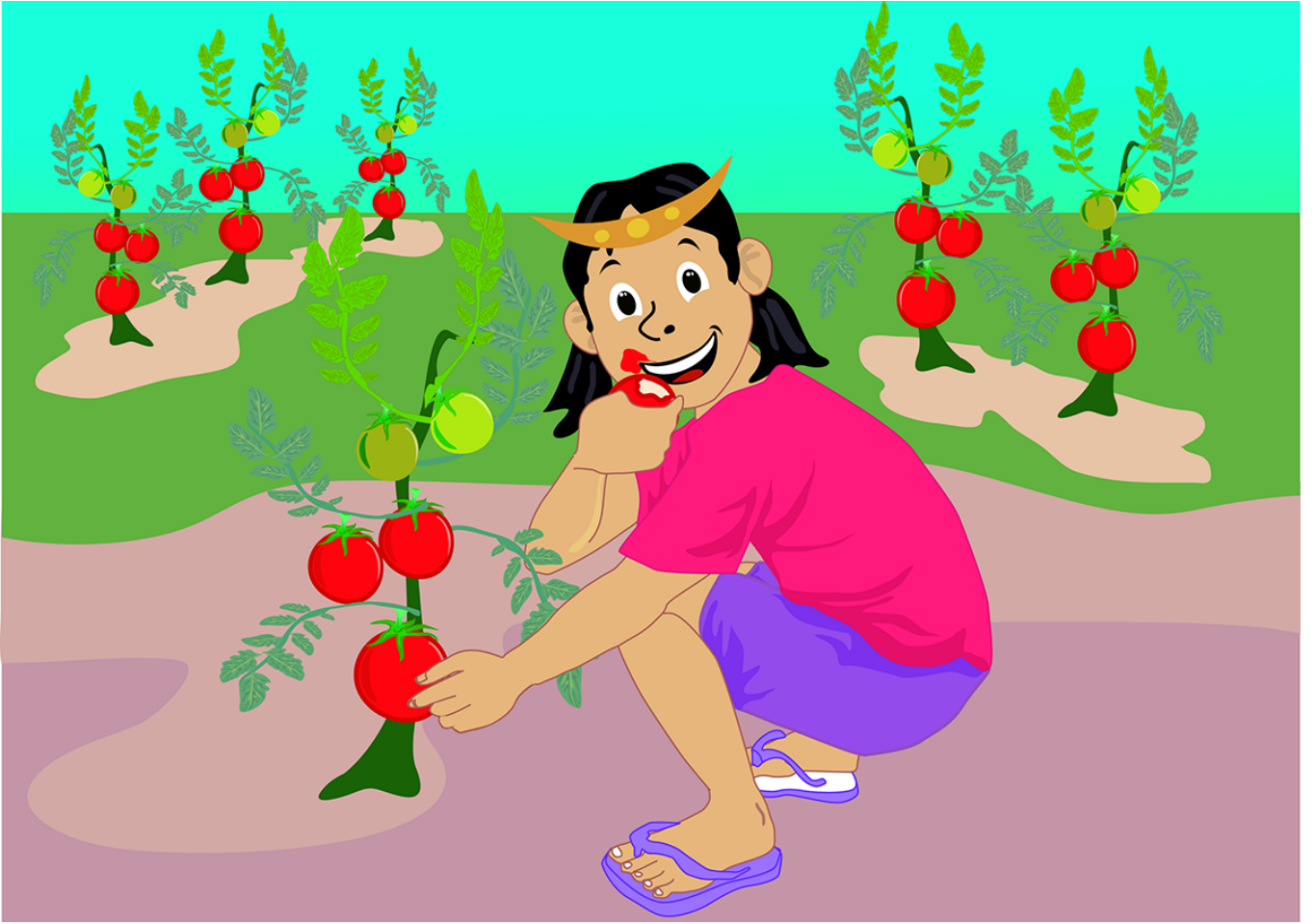
A red tomato.