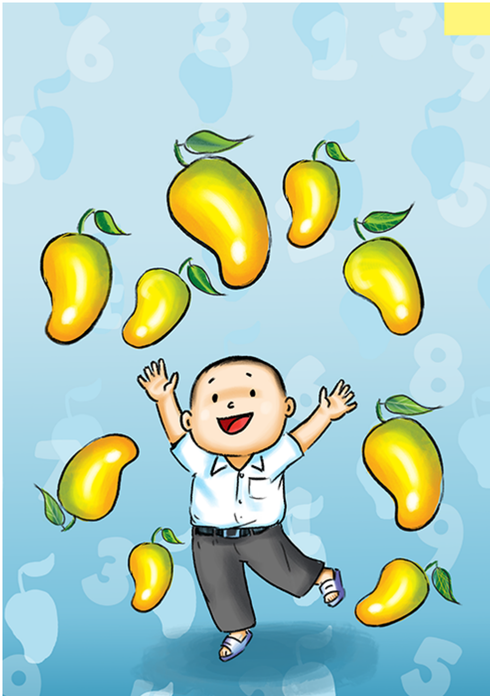
Counting Together Room to Read