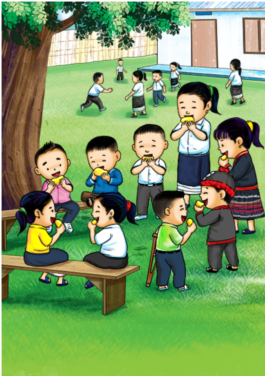
All the friends eat one mango each.