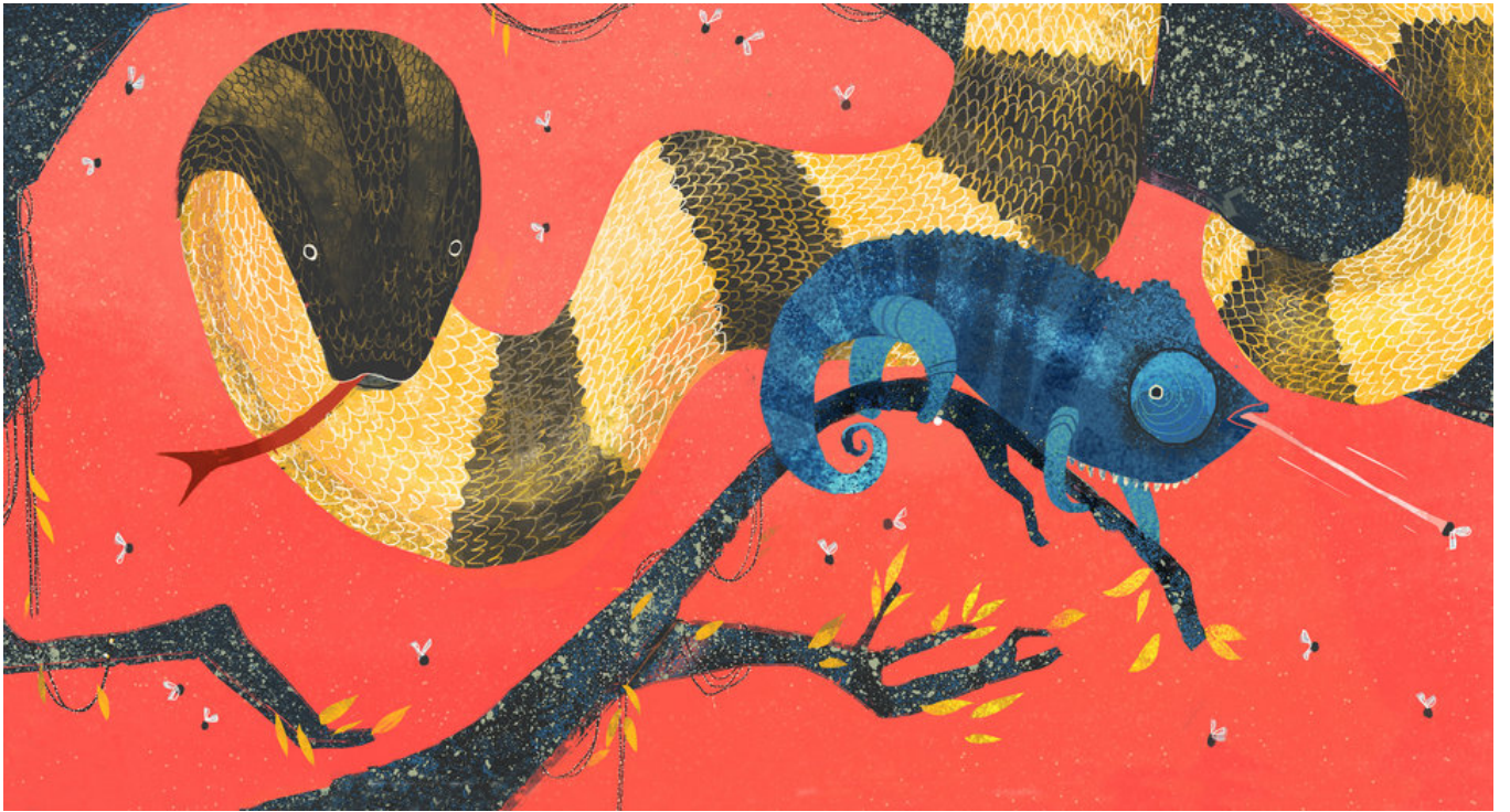
Forked tongue Fast tongue