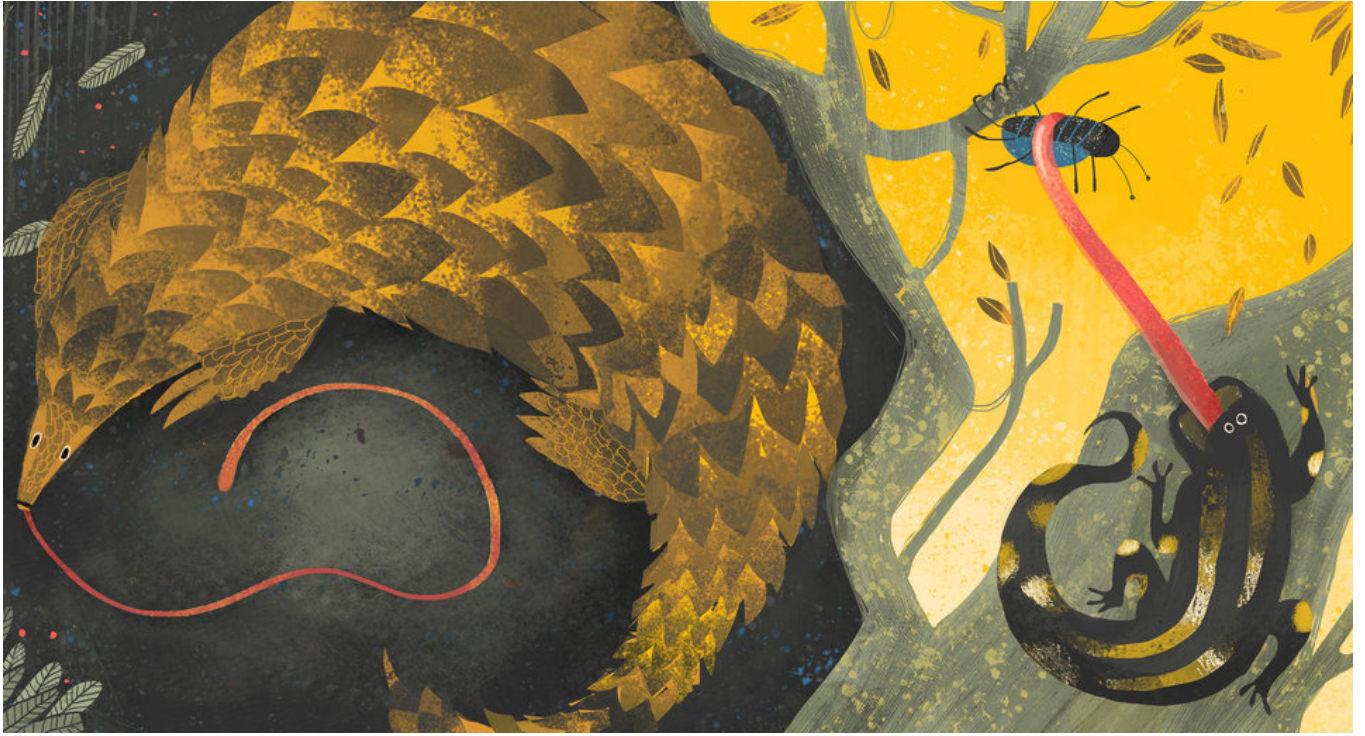
Long tongue Strong tongue