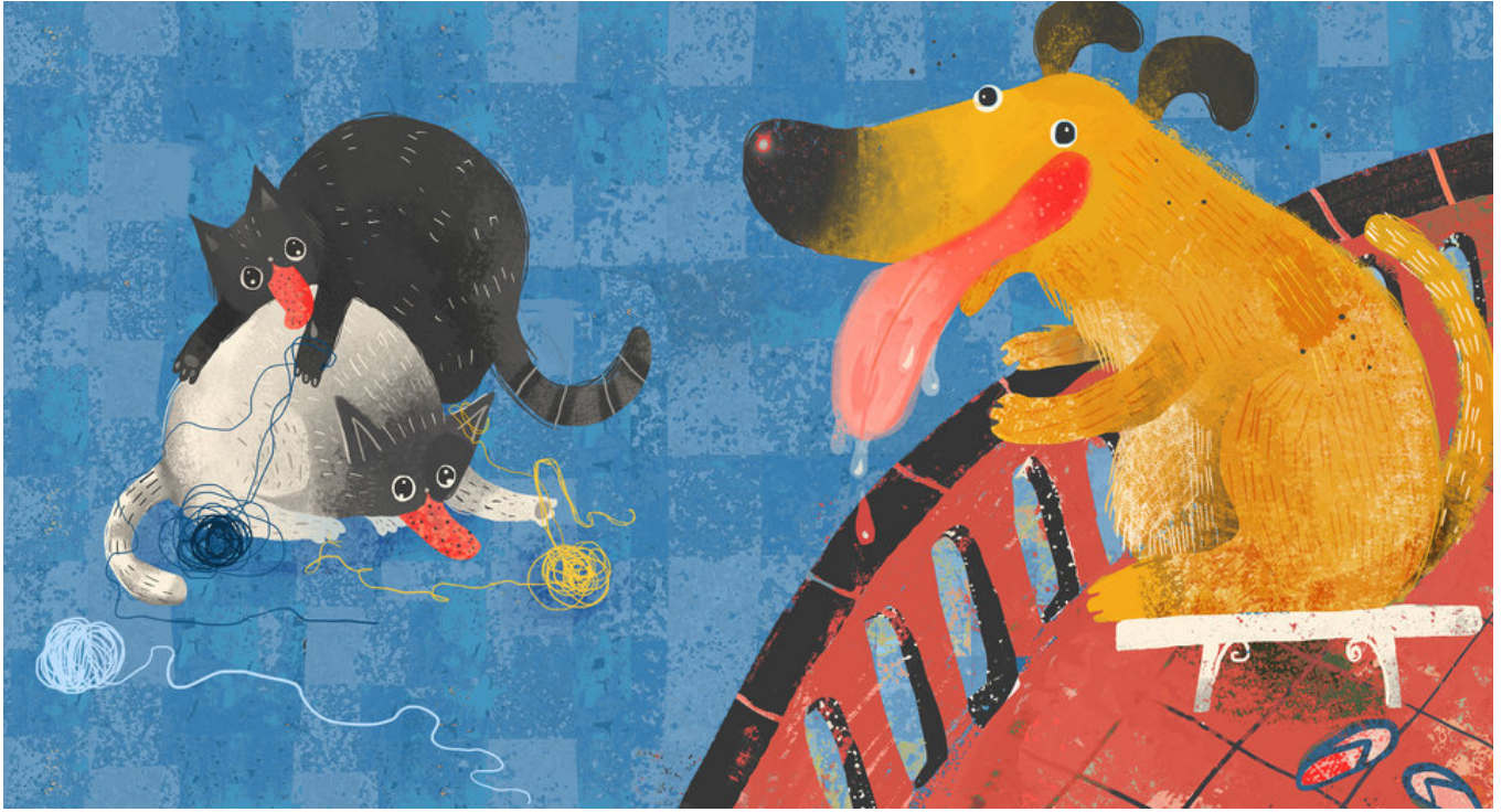
Rough tongue Smooth tongue