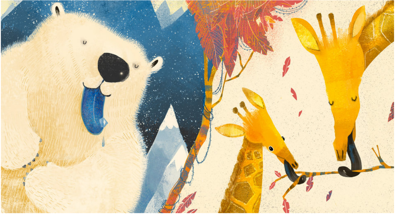
Blue tongue Black tongue