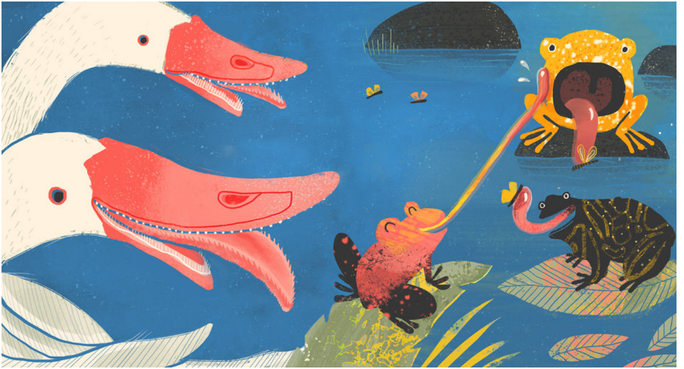
Spiky tongue Sticky tongue