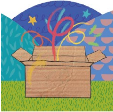
The Box Tania Kliphuis