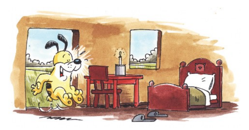
But Cat is not inside the house. Oh! Oh! Where is Cat?