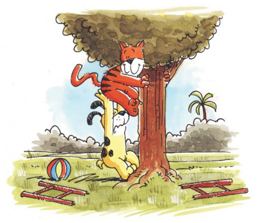
Dog helps Cat. Dog helps Cat to get out of the tree.