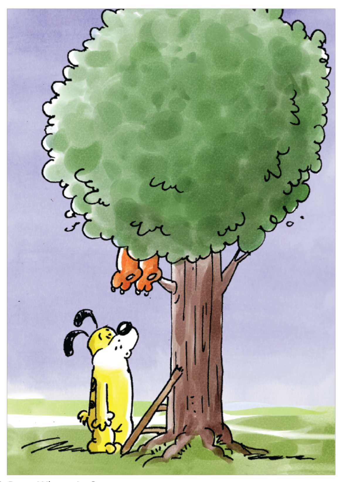
Cat & Dog: Where Is Cat