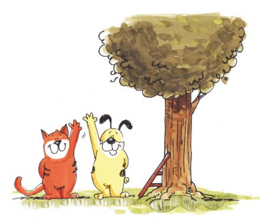
Bye-bye, Cat. Bye-bye, Dog.