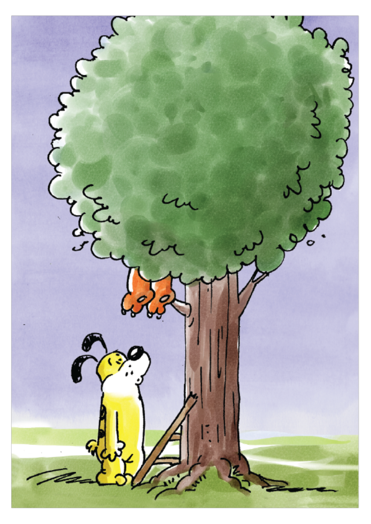
Cat & Dog: Where Is Cat