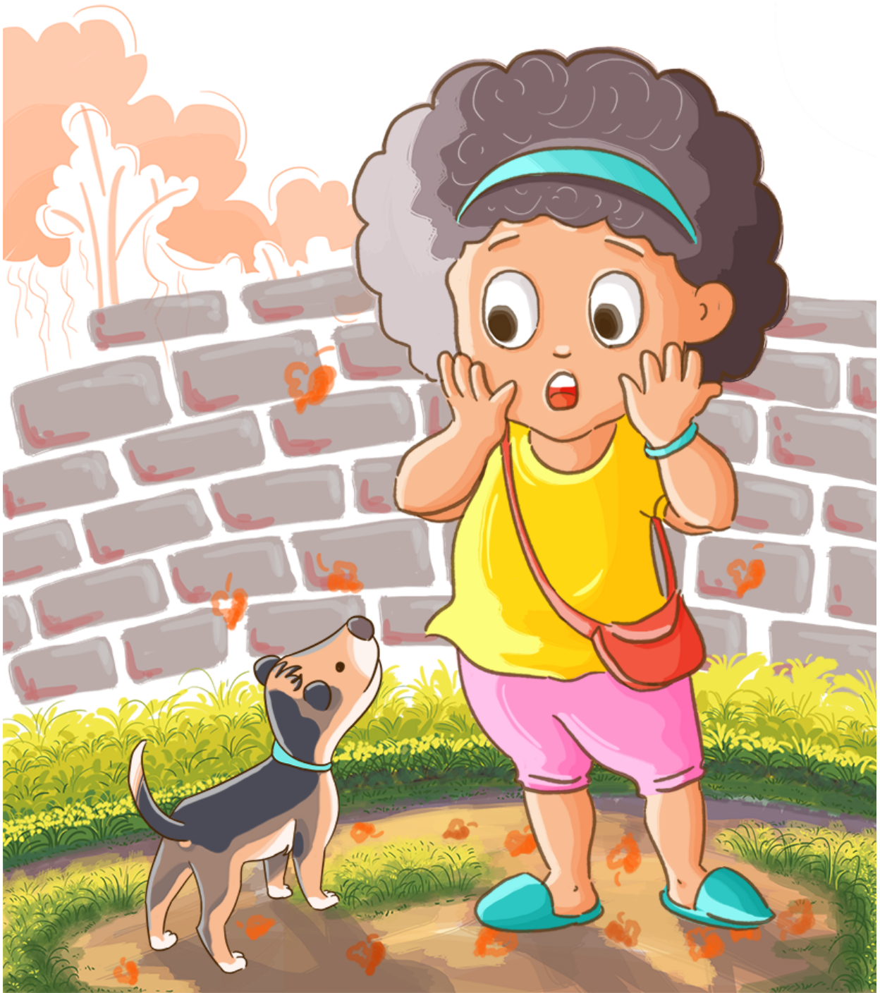
The Way to Grandpa's House