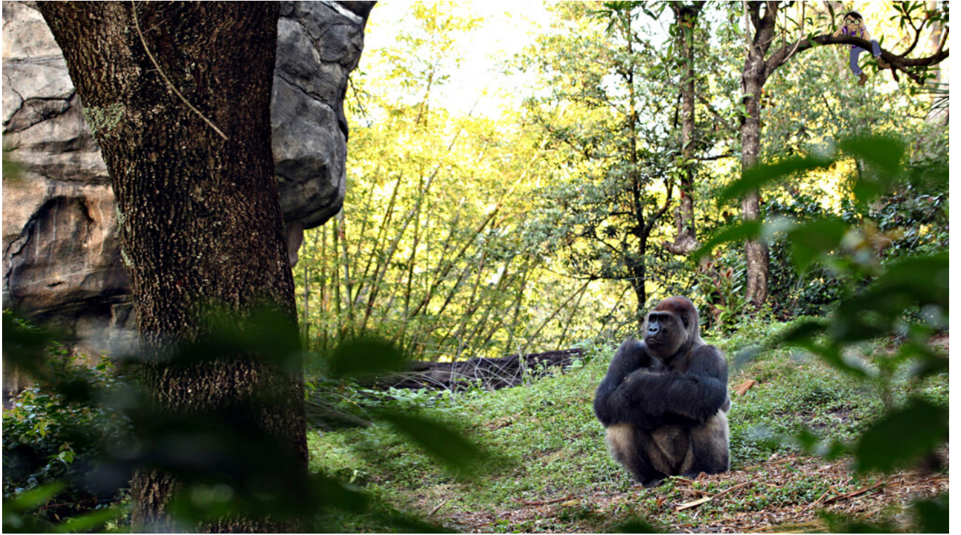
This is a gorilla.