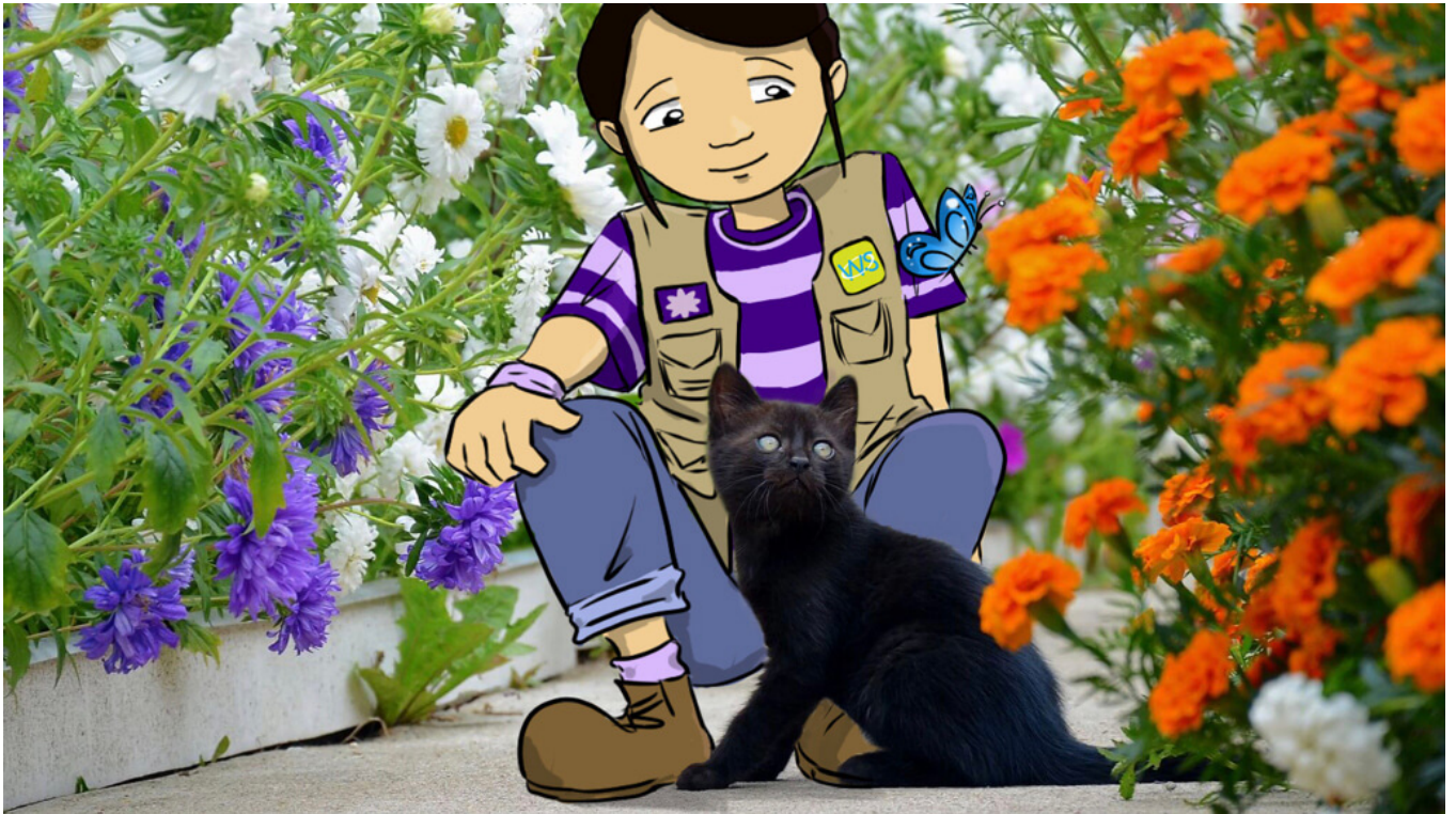
This is a kitten in a garden.