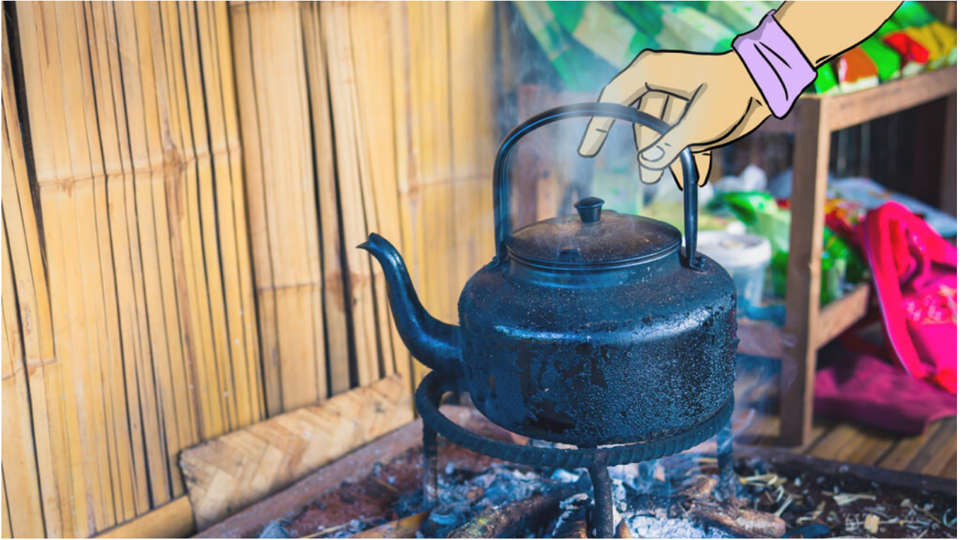
This is a kettle.