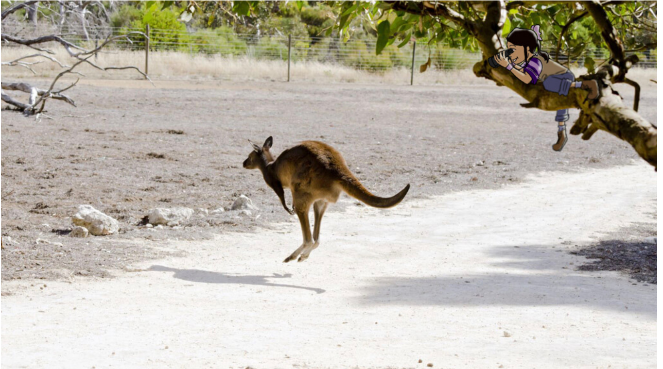
This is a kangaroo.