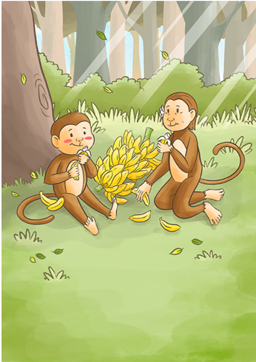
Little monkey is happy to see his mom and eats the delicious bananas.