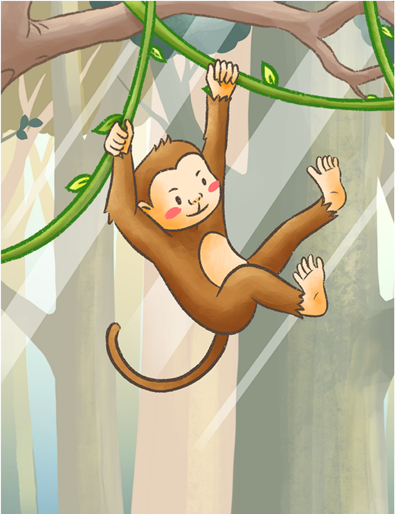
Monkey and Banana Room to Read