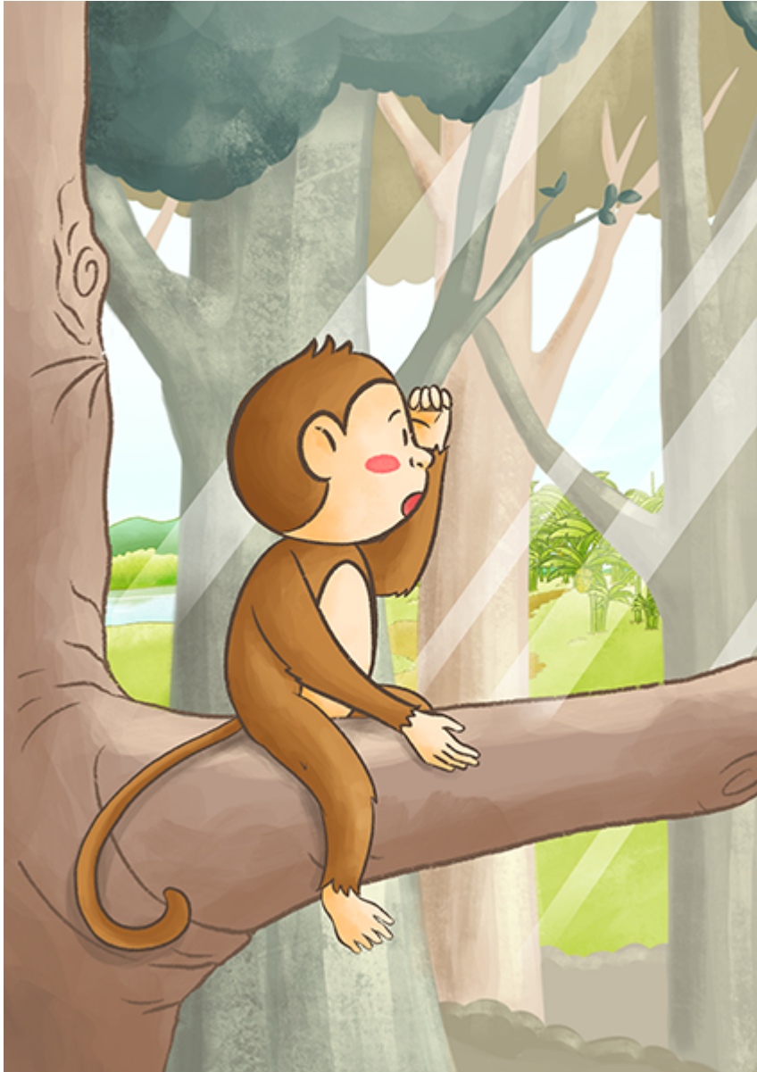
Monkey and Bananas