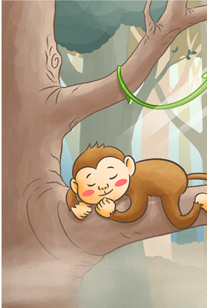
Little monkey sleeps.