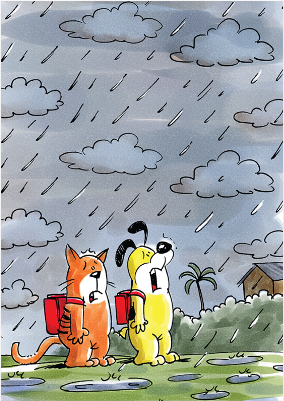
Cat & Dog and the Rain