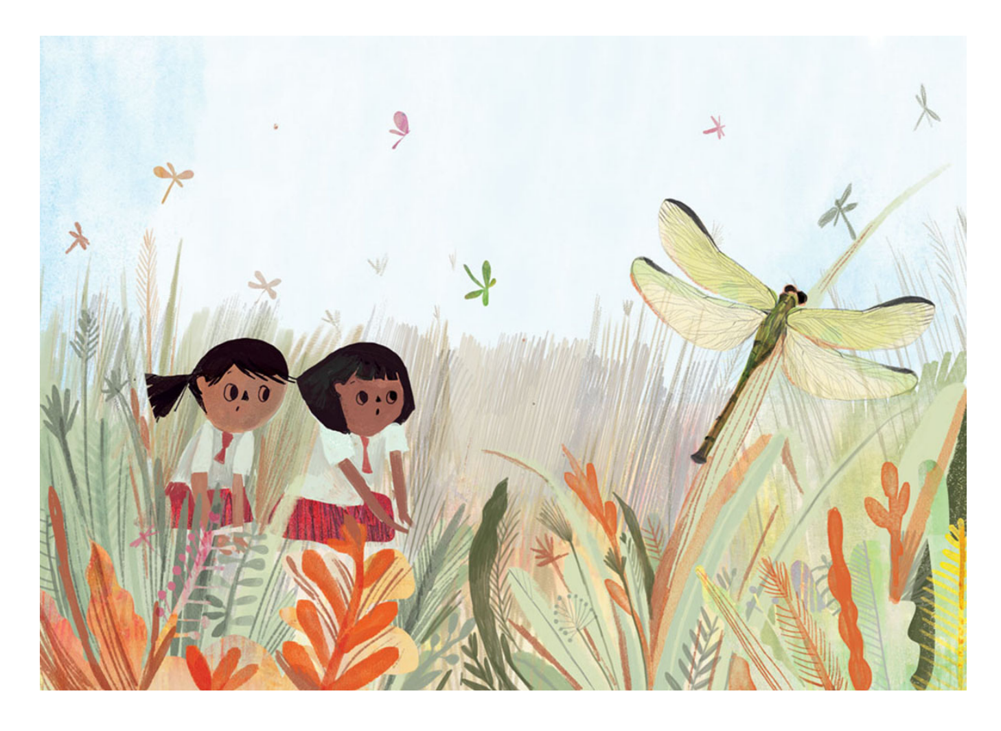
Such beautiful dragonflies!