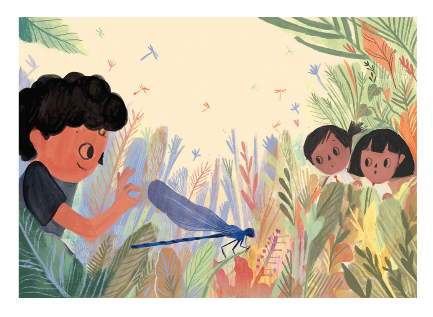
A boy from their class approaches. "Catching dragonflies, huh? I know how to get them!"