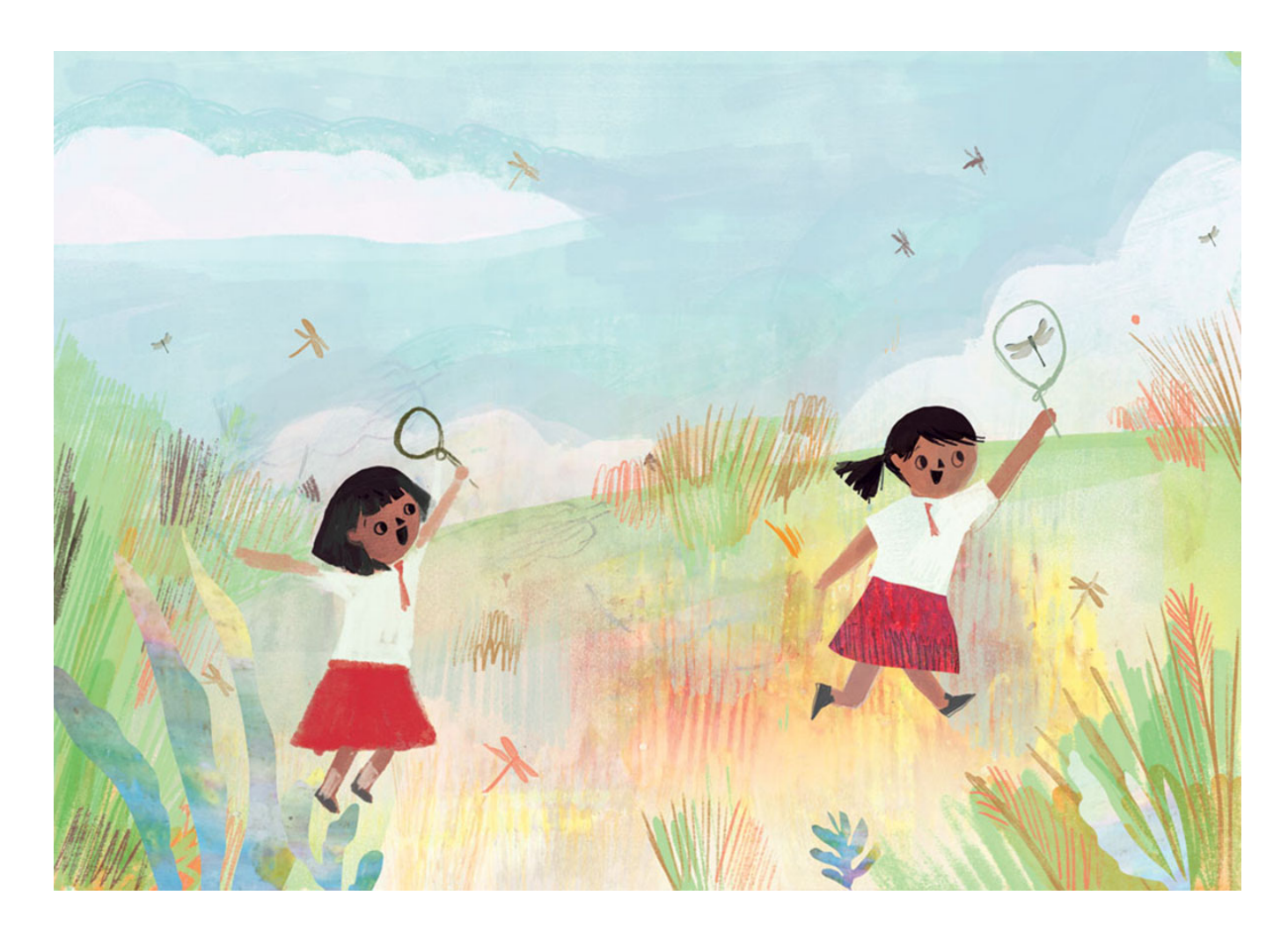
We did it!