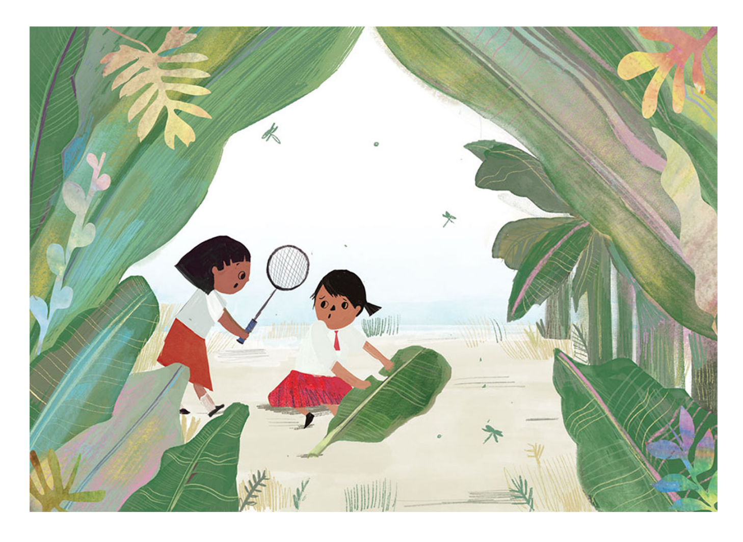
"Let's make a racquet!" Trisna suggests. "No, no, not that kind, Sukma!"