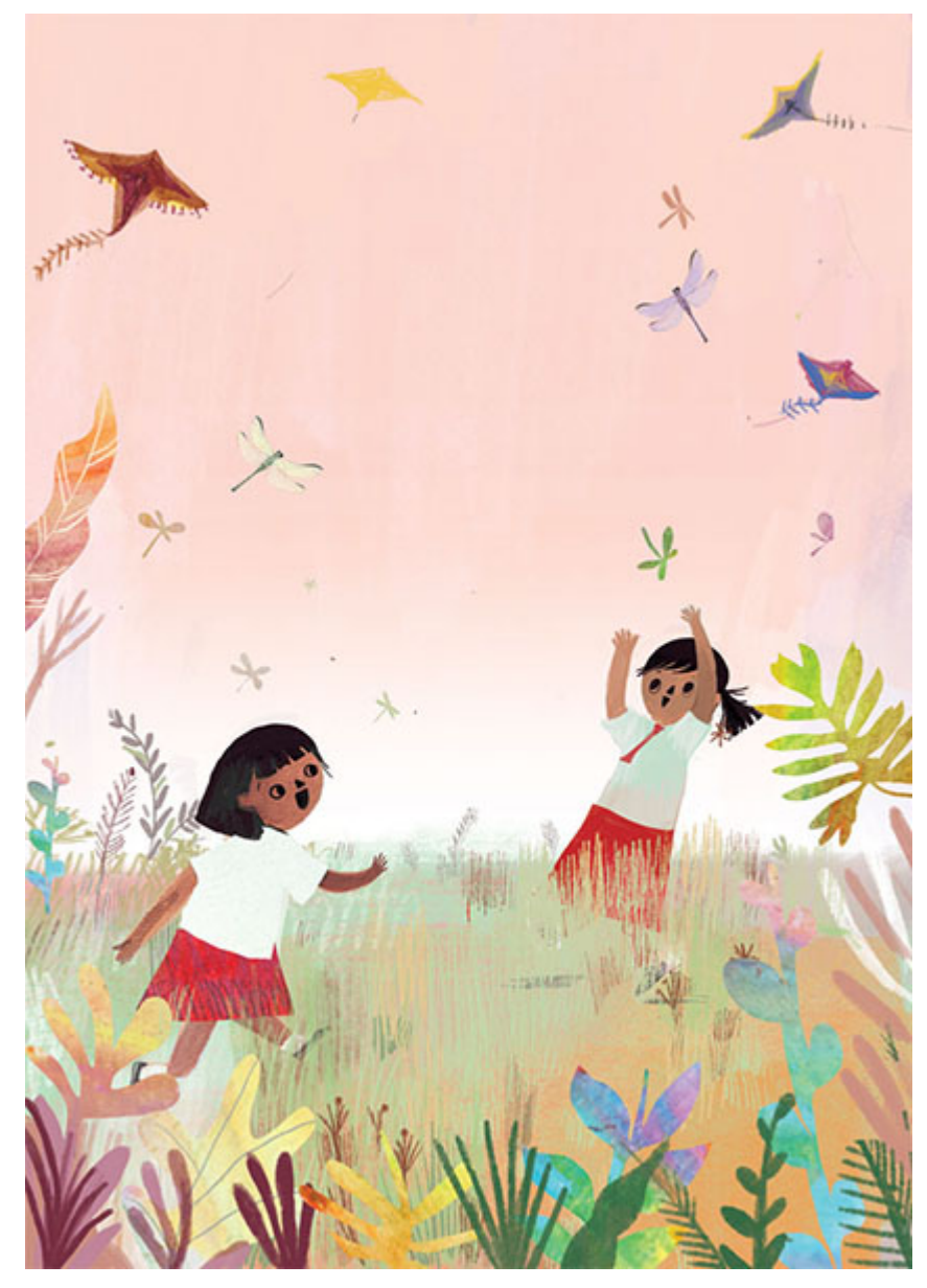
Let's Find a Dragonfly! Sri Widyowati Kinasih