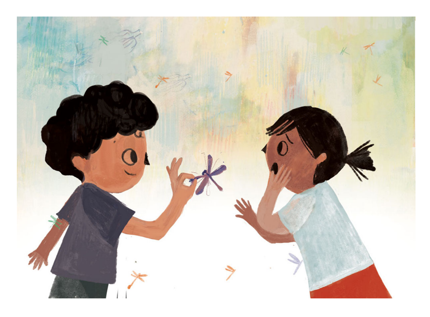
"See?" the boy says proudly. He pinches the dragonfly's wing. Oh no! That could hurt the dragonfly, too.