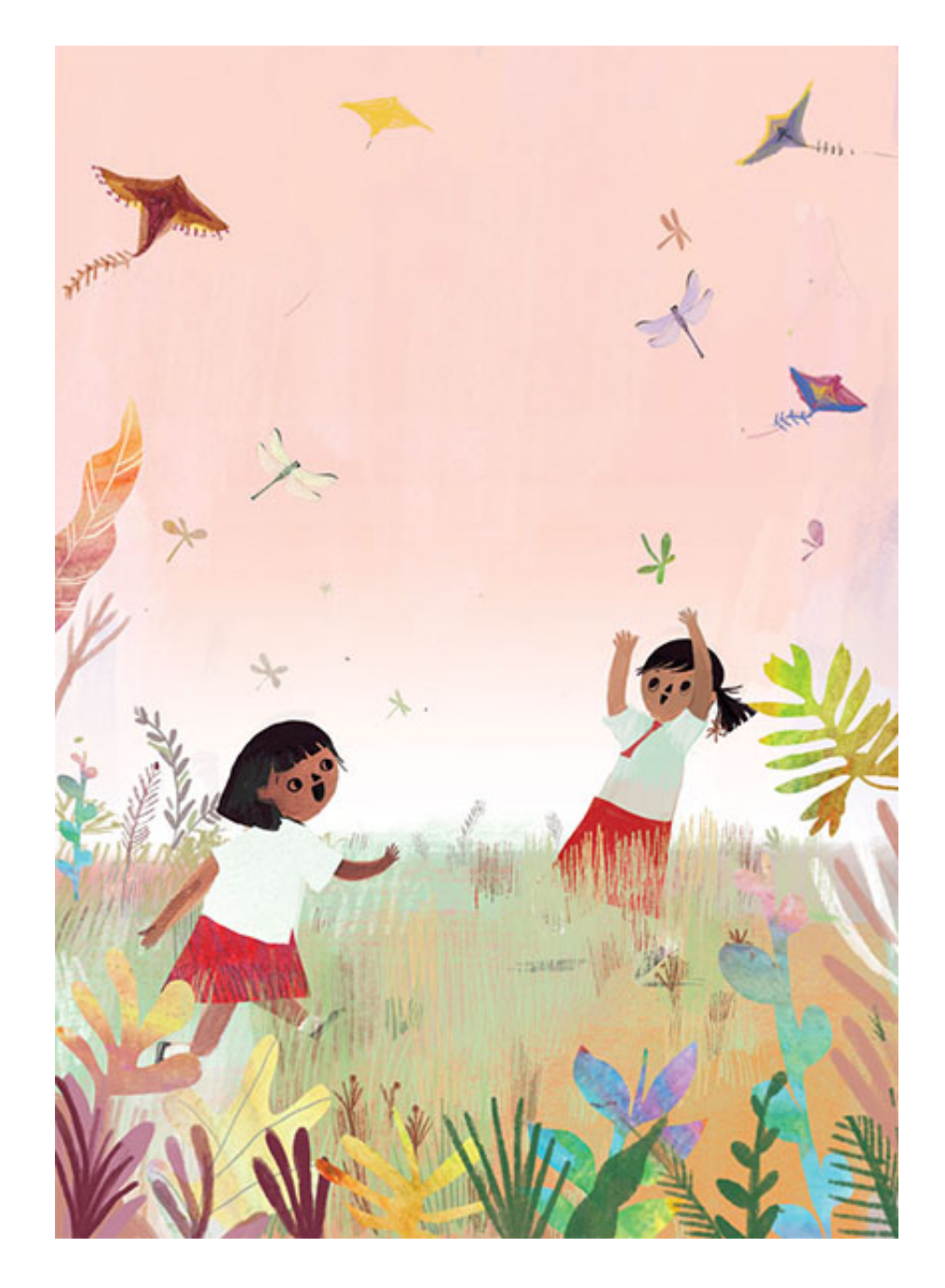
Let's Find a Dragonfly!

Trisna and Sukma are observing dragonflies for their homework. But catching dragonflies turns out to be harder than they expected!