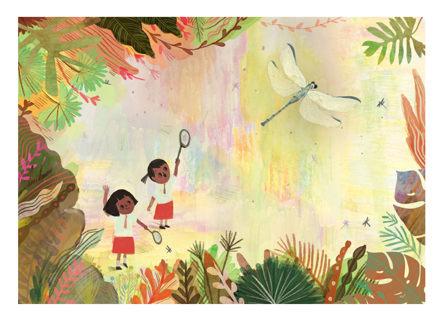
Fly away, Dragonfly! Thank you for helping us understand you.