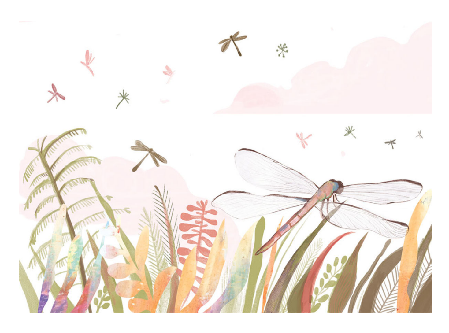
Will she catch one?