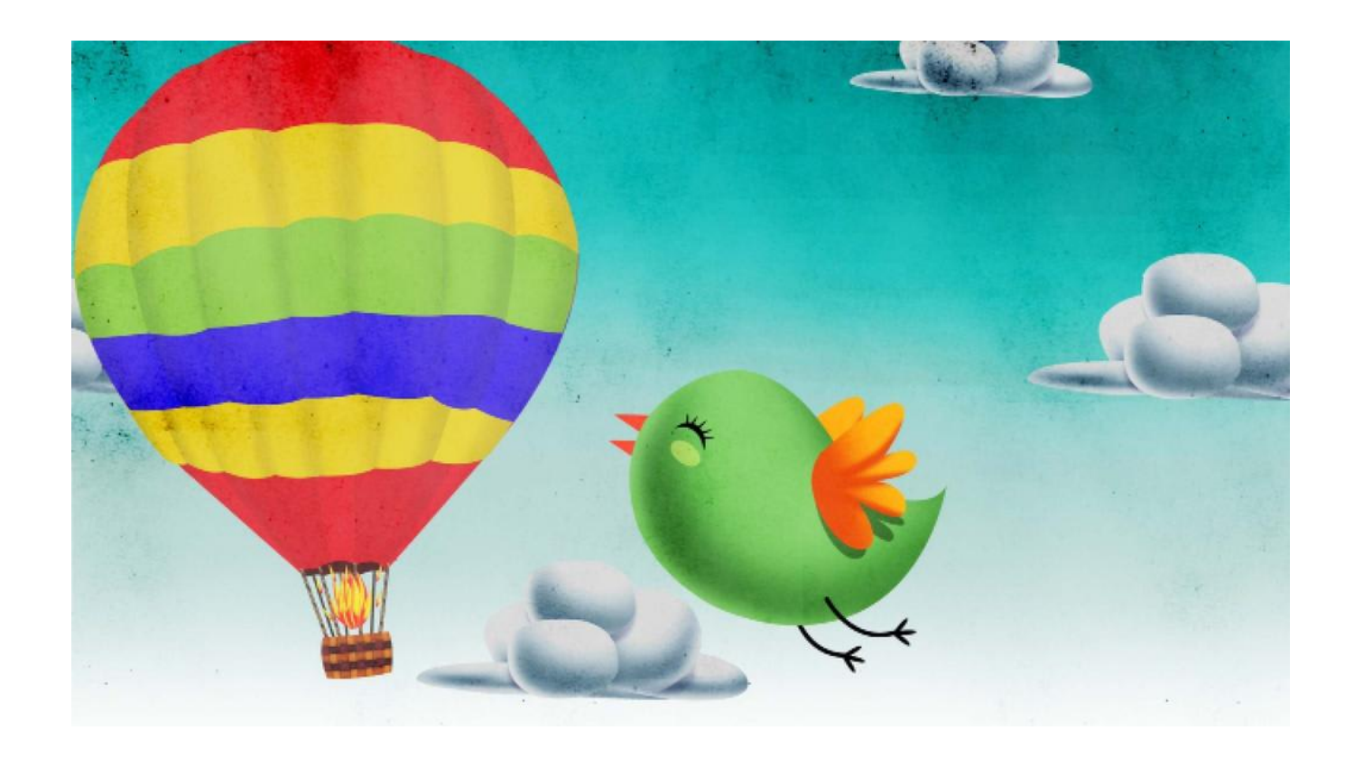
He flew away a bit to more clearly see, "Ah! It's a hot air balloon!"