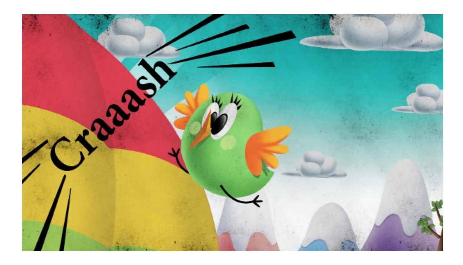
When he suddenly crashed into something huge.