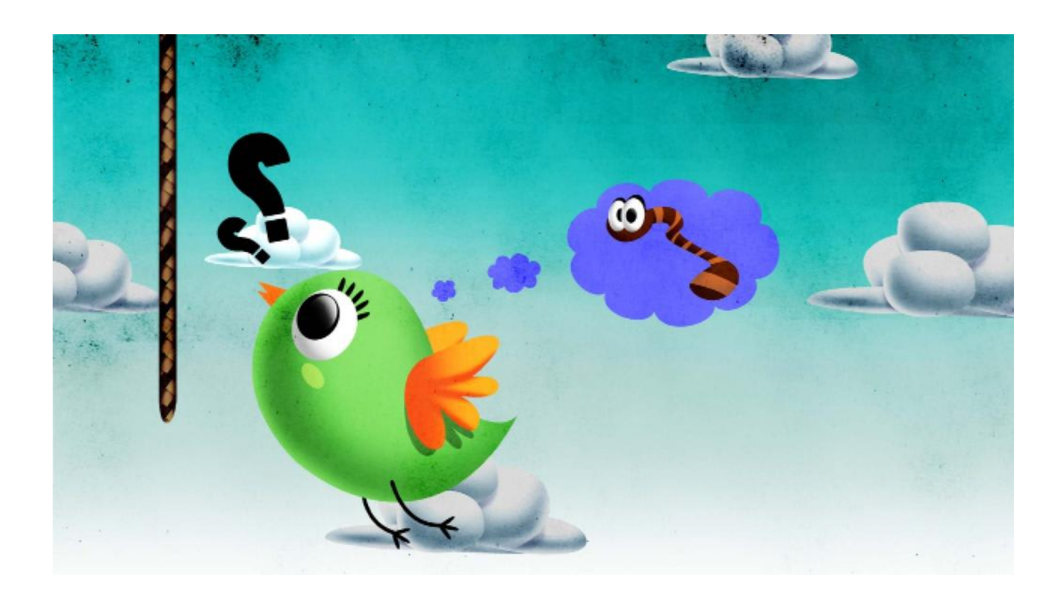
He flew higher and guessed again, "Maybe a giant long worm? No, no, no..."