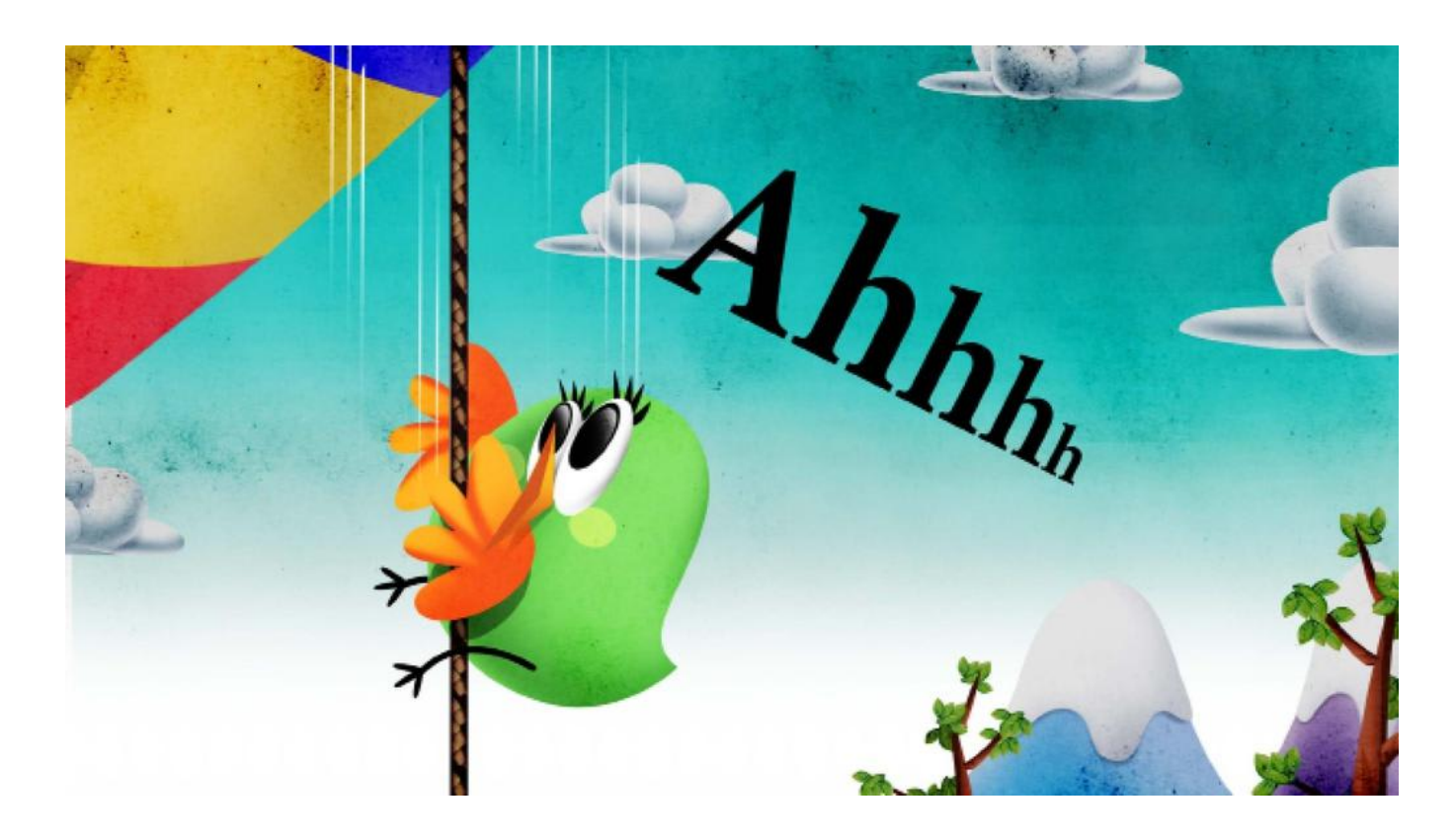
Then down a long rope...