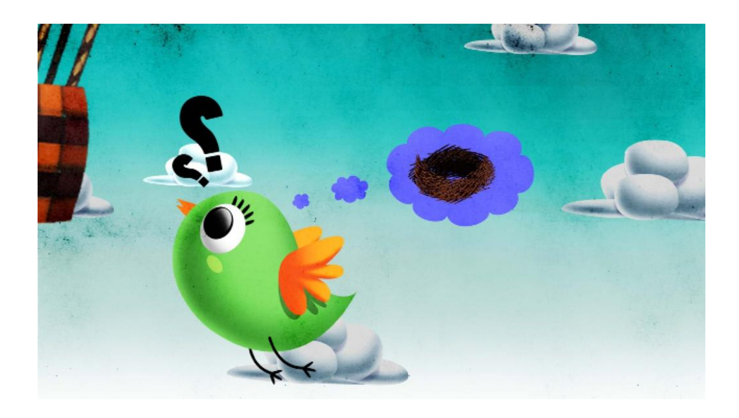
He guessed, "Perhaps a nest? No, no, no..."