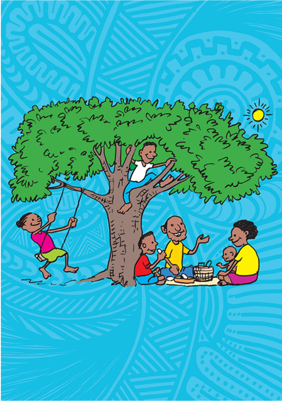
Trees Tandi Jackson