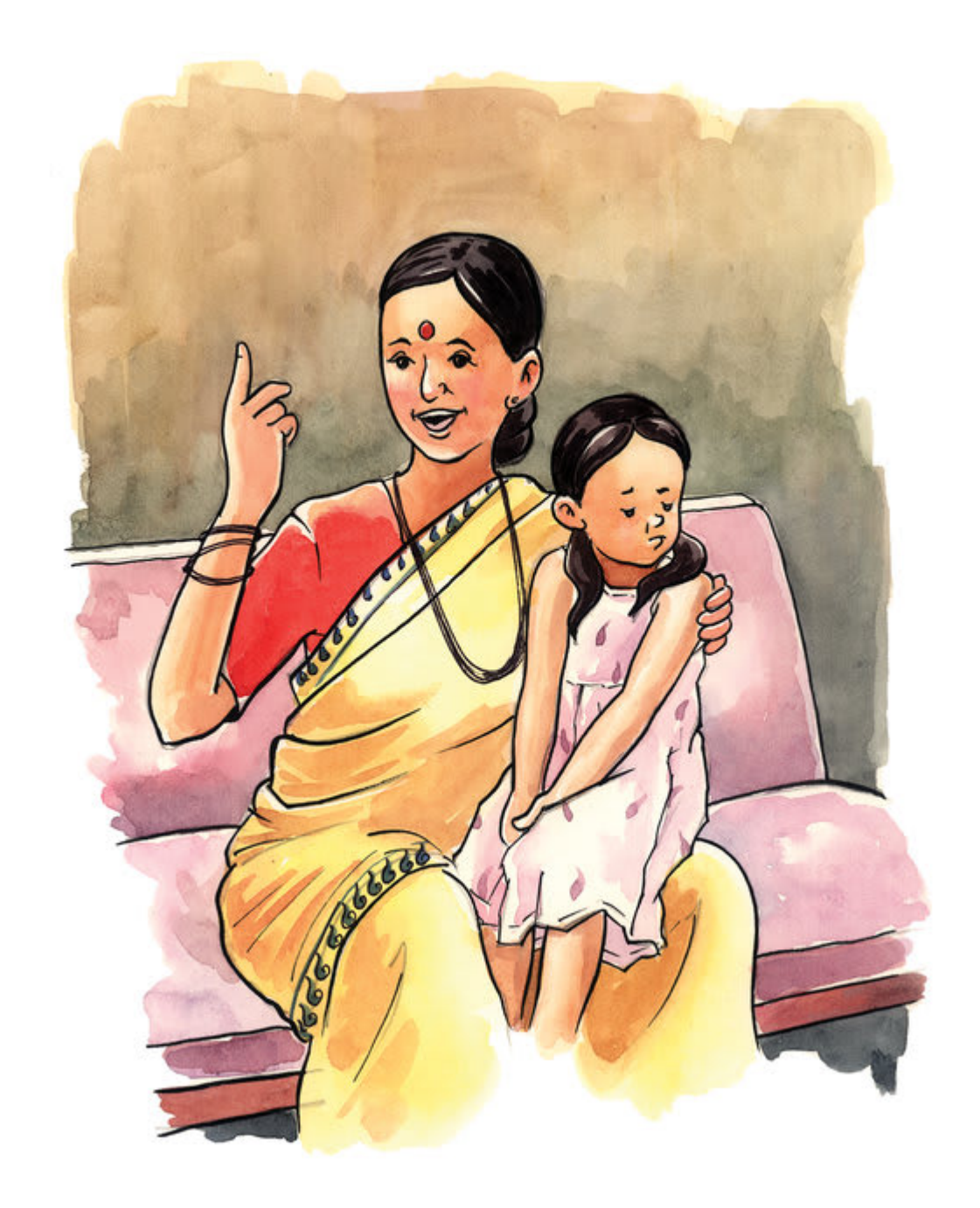
"What fun!" Mother happily said, "The dentist couldn't even open my daughter's mouth after hours of trying, but these biscuits helped in seconds!"