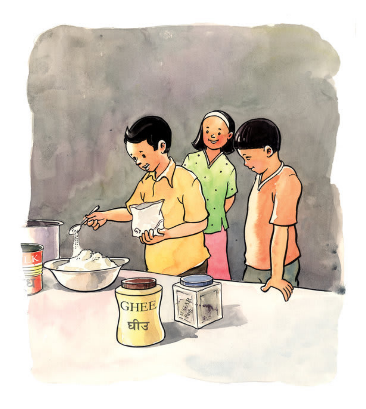
"Baking powder must be another name for salt," thought Barun. Barun added a spoonful of salt to the flour mix.