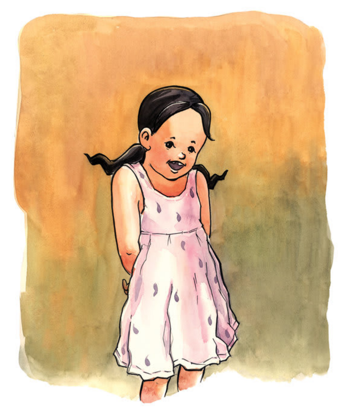
Just then Charu smiled back with a wide, toothless, grin.