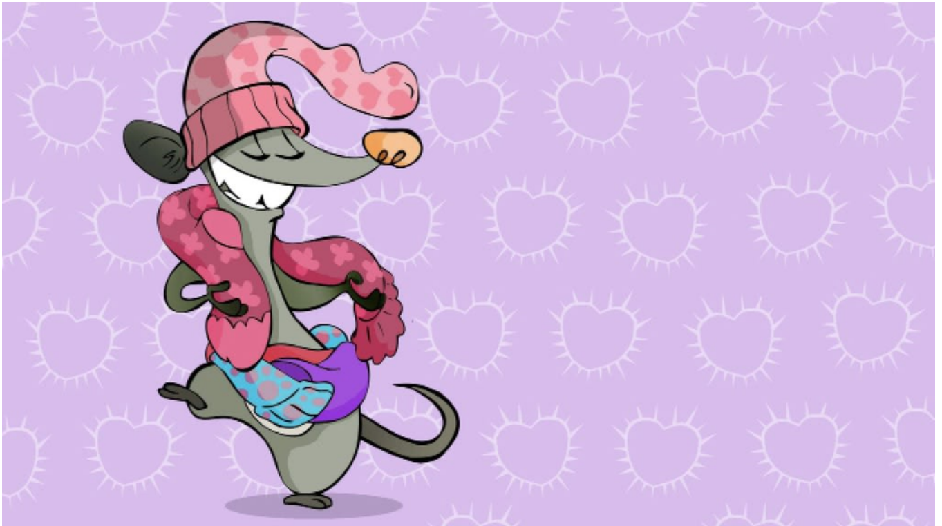
The Rat in the Sock Hat