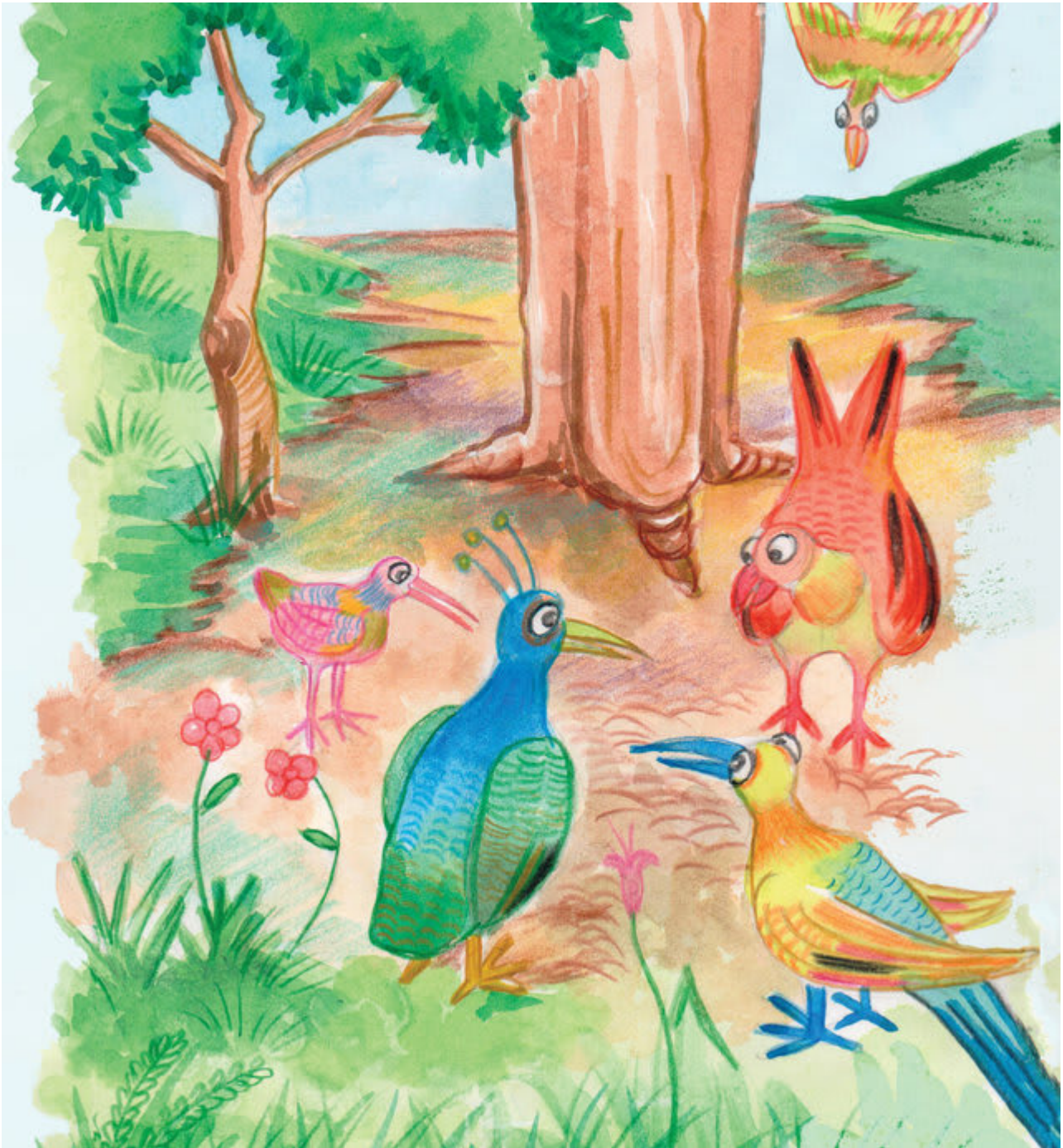
Tausi, the Peacock was a kind and gentle bird.