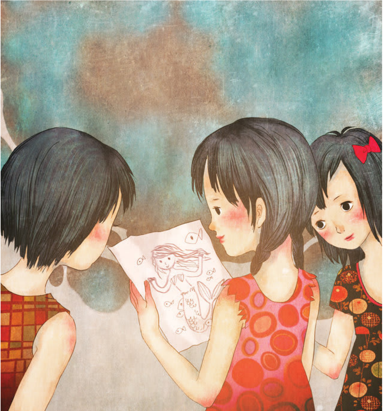
Coral dreams of becoming a great explorer.