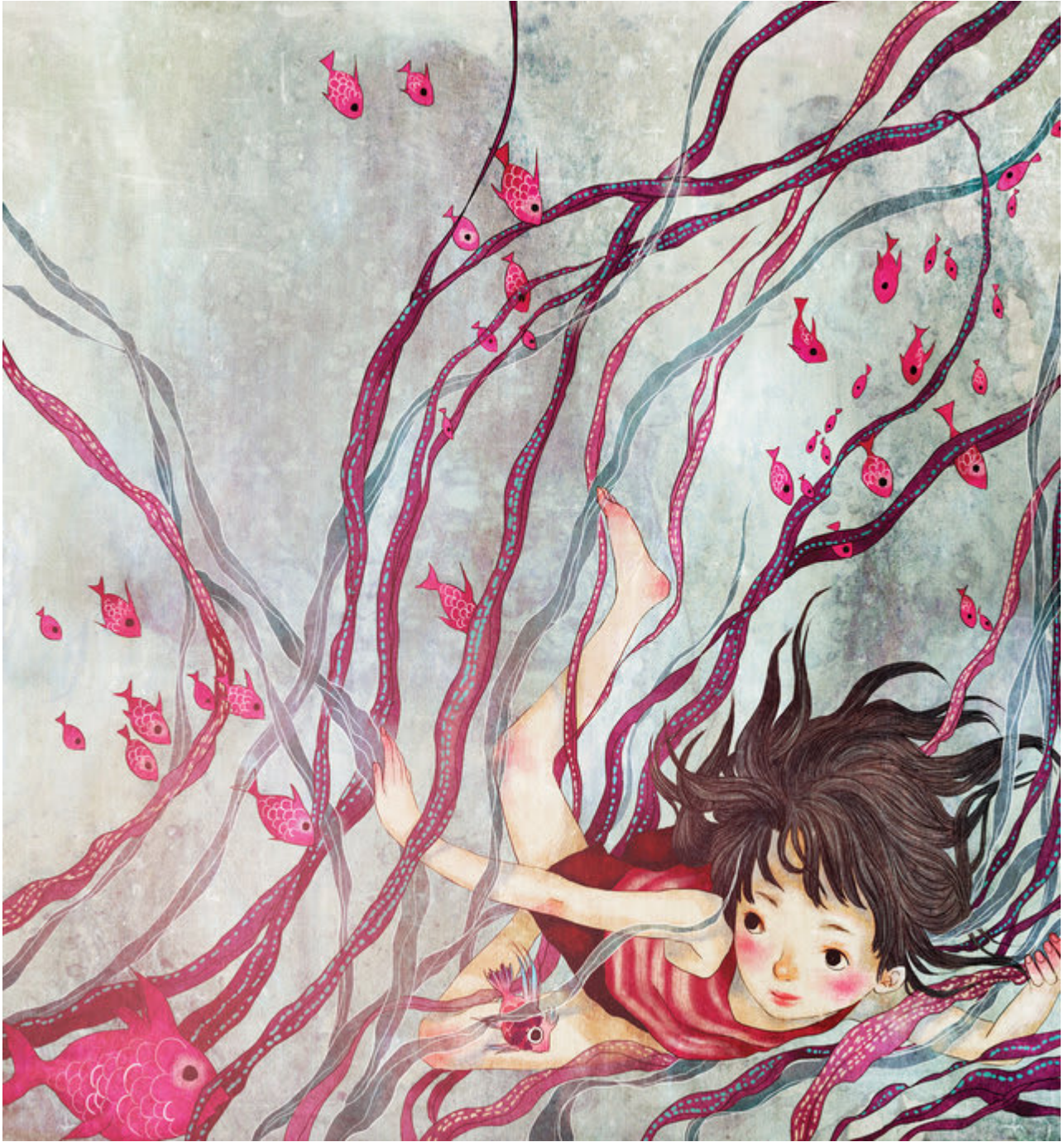
Coral can barely believe what she sees.