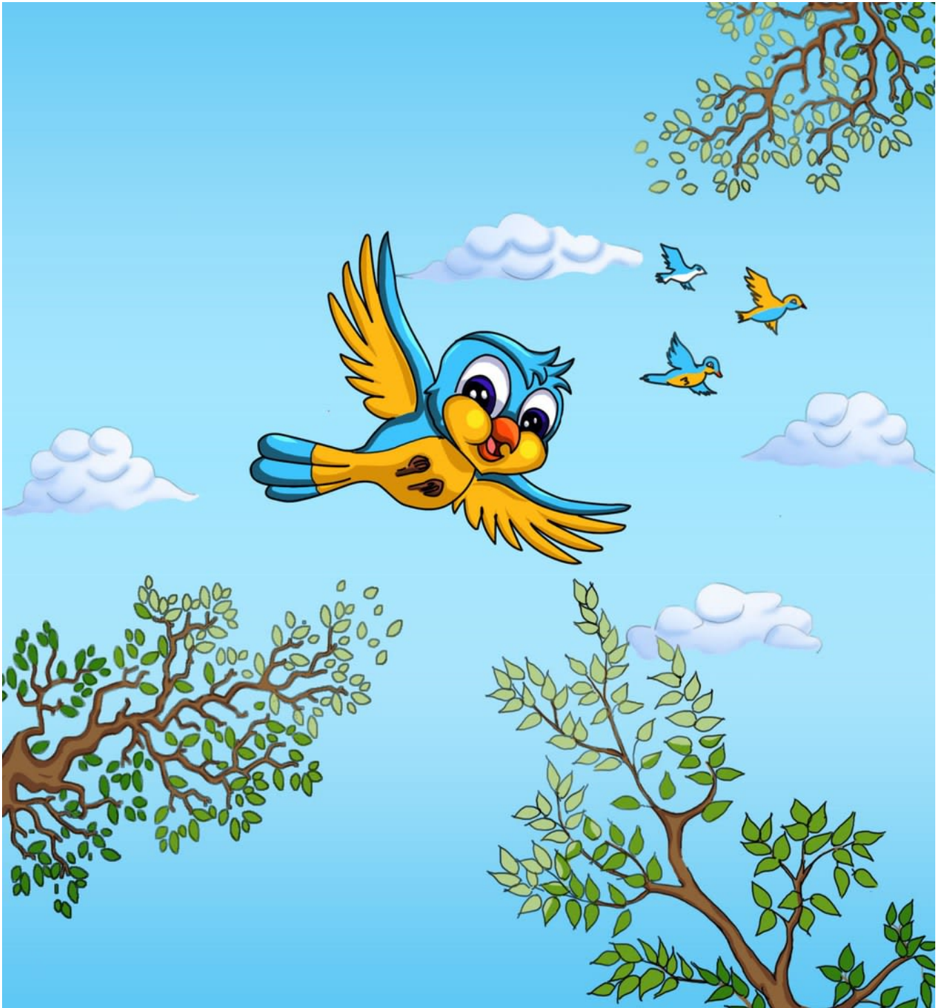
Birds fly in the sky.