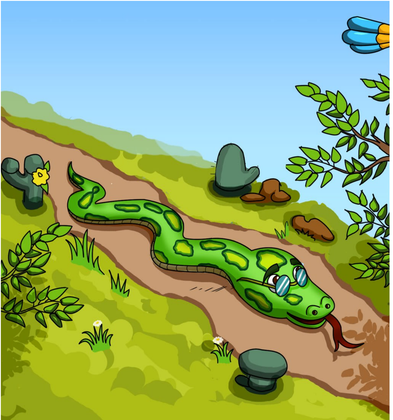
Snake crawls on the ground.