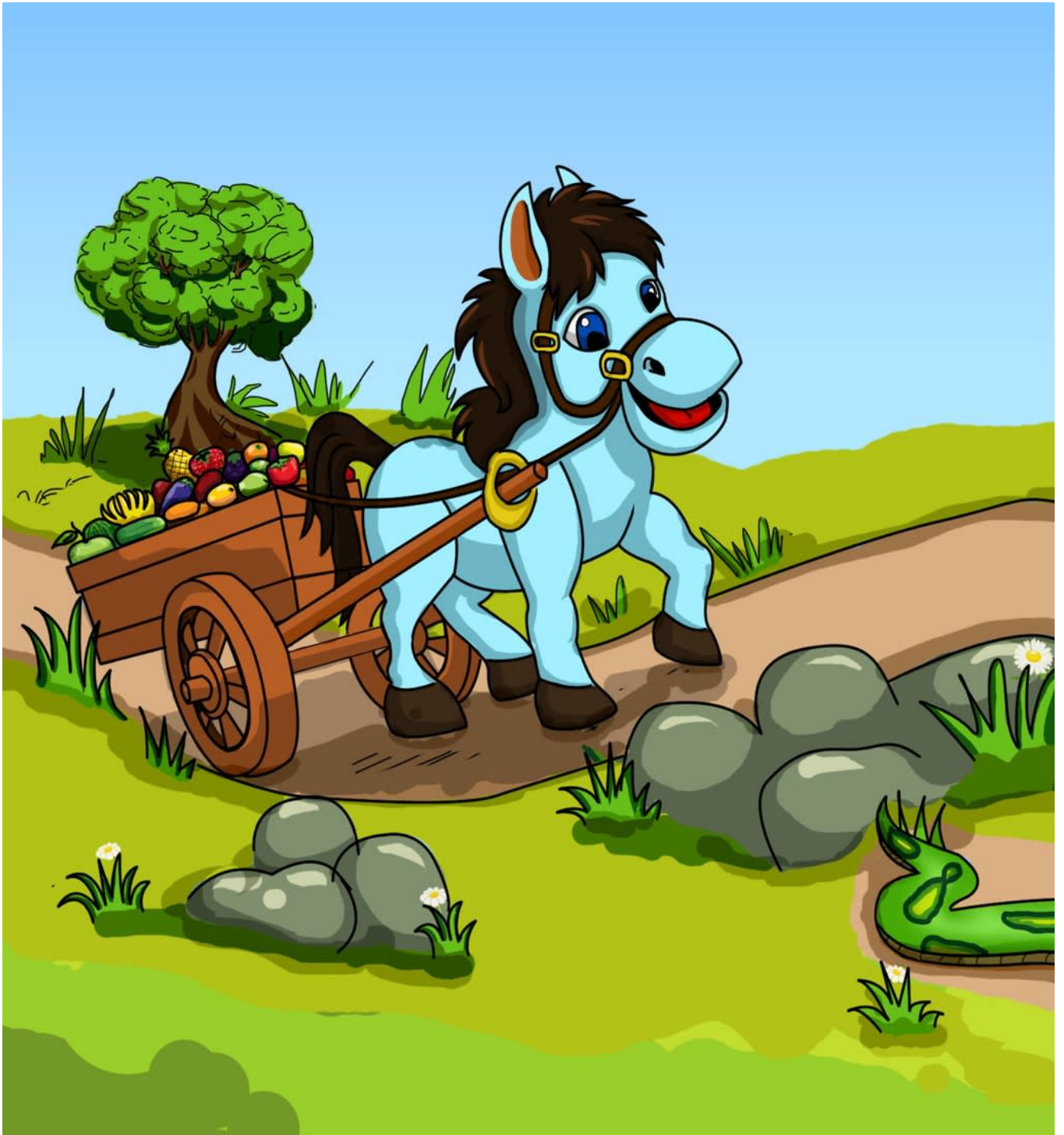
Horse pulls a cart.