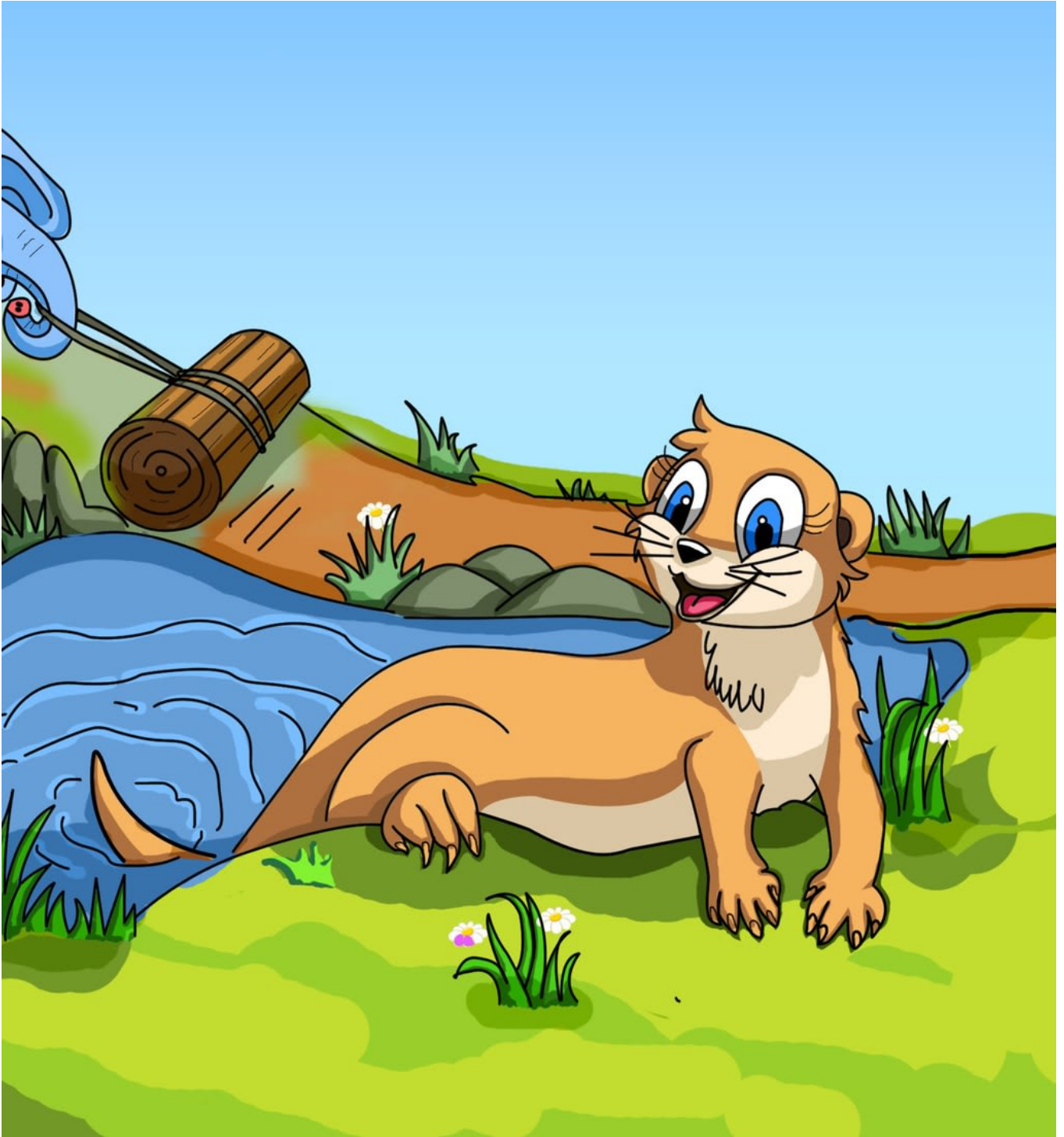
Otter goes back onto land.