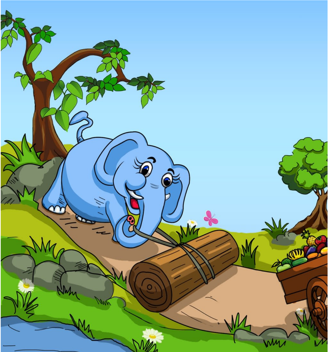
Elephant pulls a piece of wood.