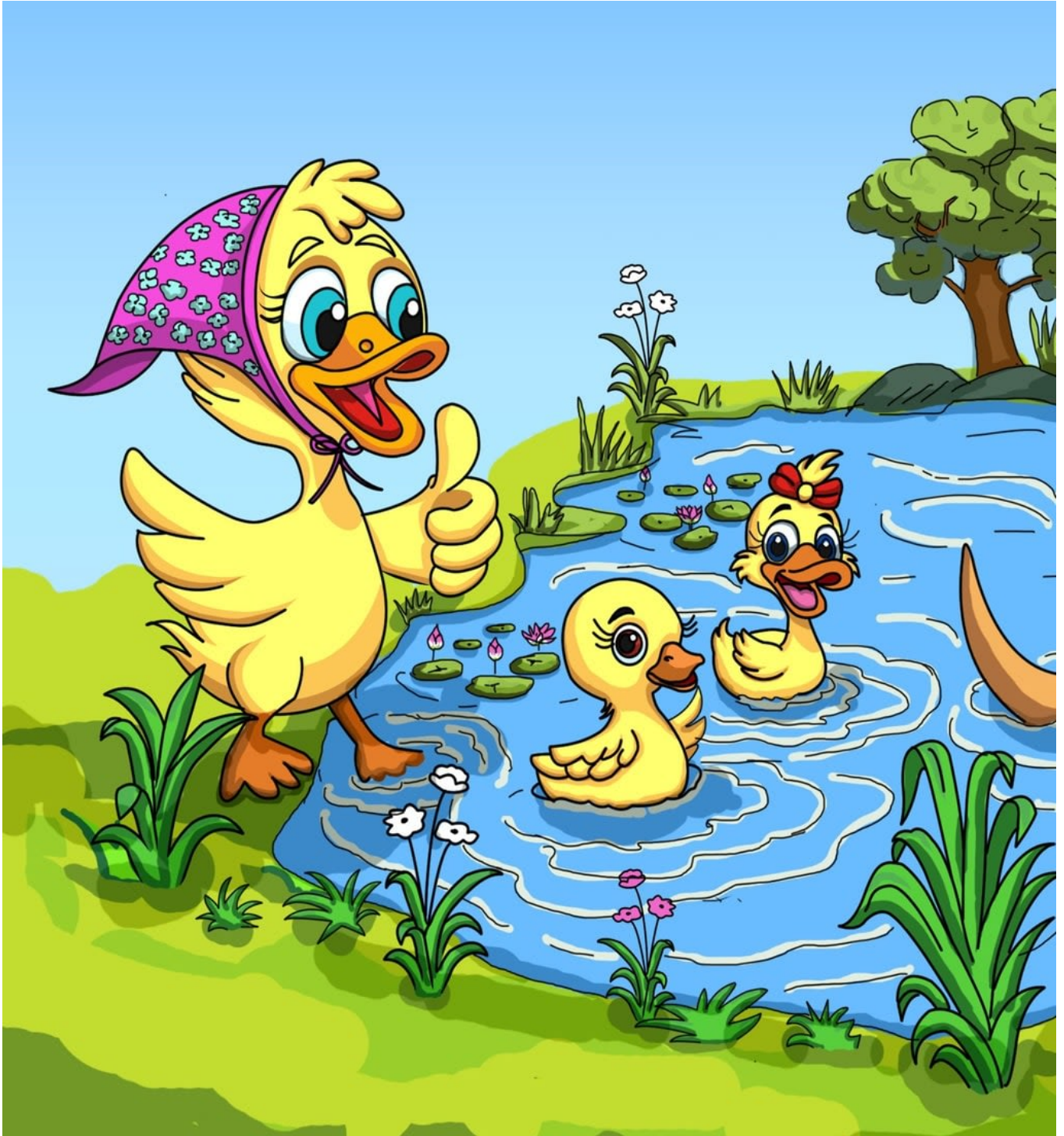
Duck goes into water.