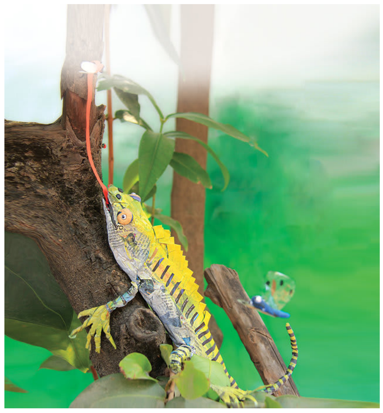
And so they decided to switch back. The green lizard went back to her tree and happily hunted for food in the day.