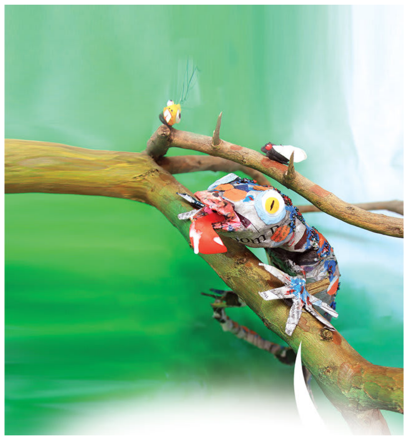
"How about we switch how we live?" said the gecko. "I am bored on the wall. I could hunt on trees and in the grass, like you do!" "And I could climb up walls to hunt, like you do!" answered the green lizard. "It will be such fun!"