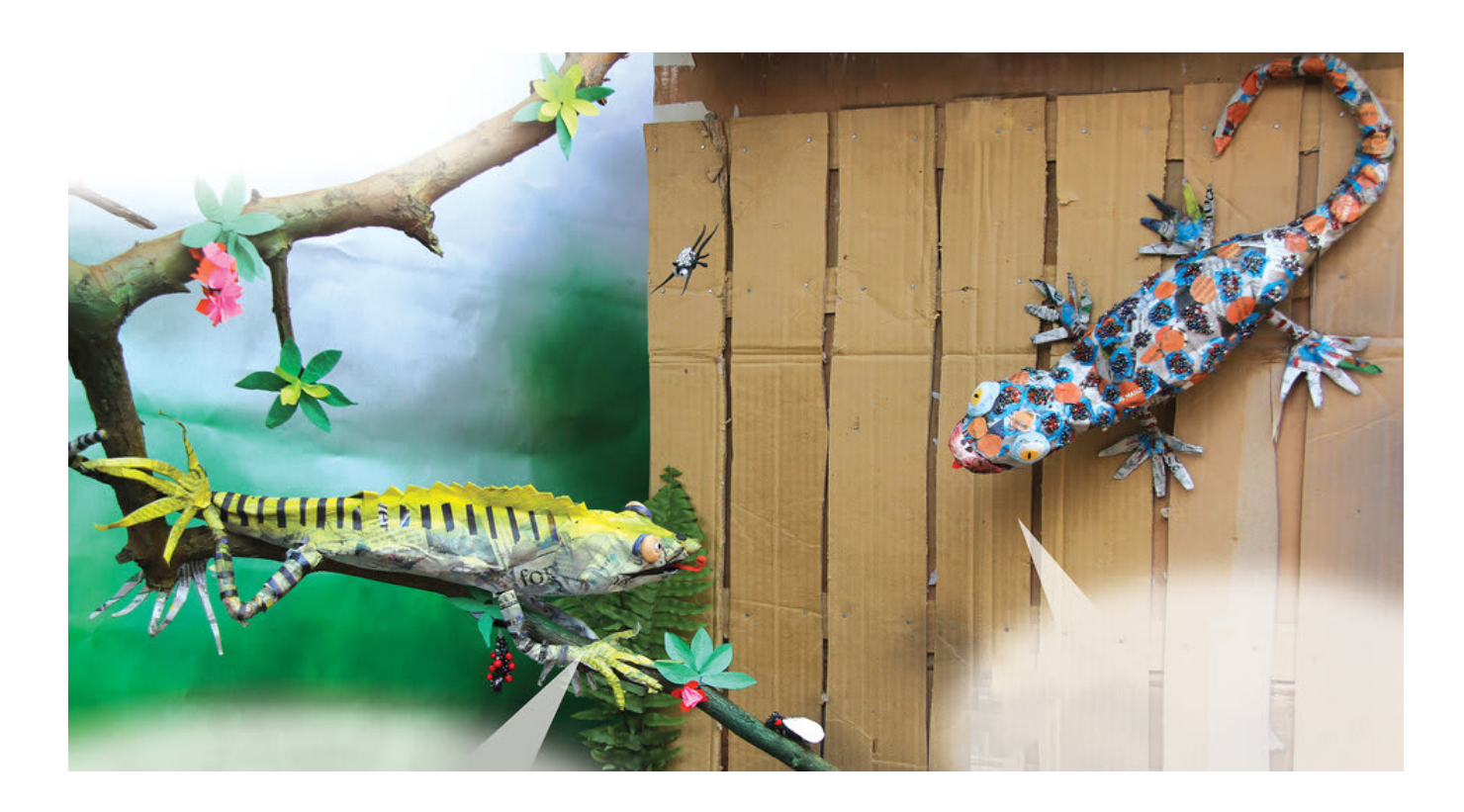
"Hello, I am a green lizard," she said. "I like to hunt for food in the day." "Hello, I am a gecko," he said. "I like to hunt for food at night." The two reptiles were very interested in one another's lives.