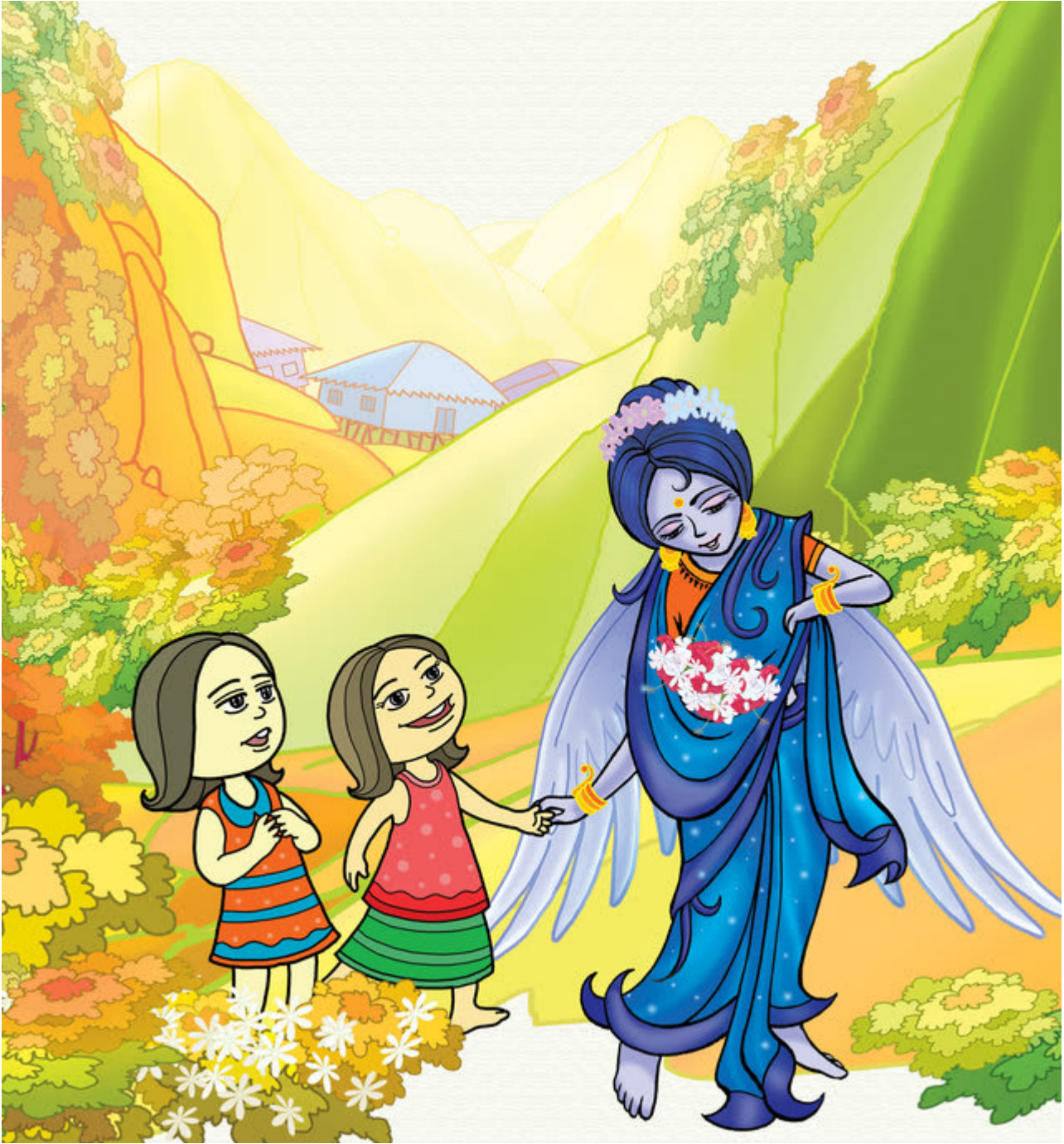
She holds their hands.