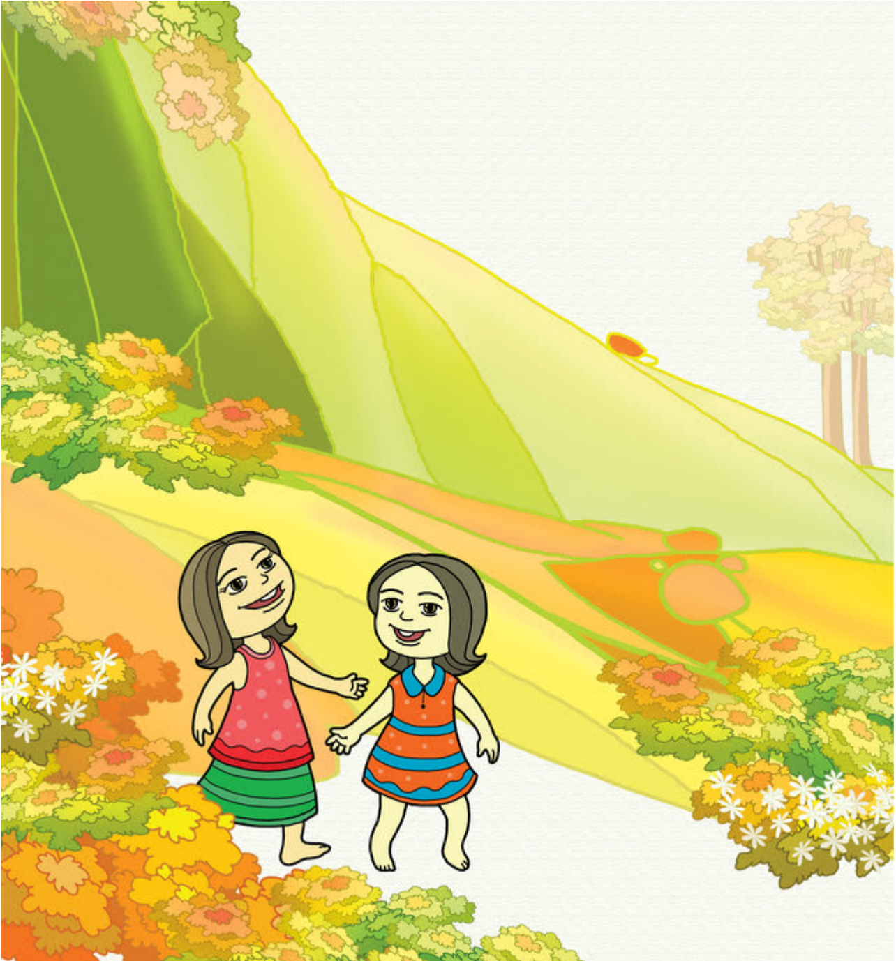
Tina and Thina are classmates.