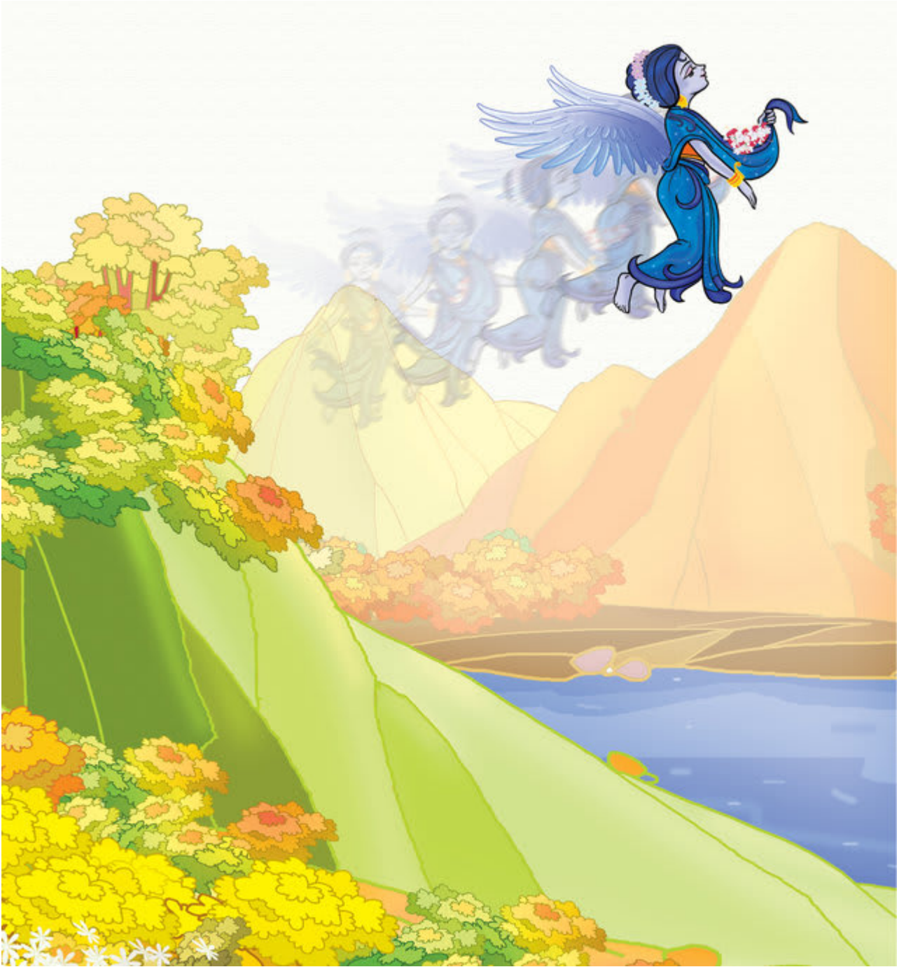
The blue fairy flies away with the flowers, far far away.