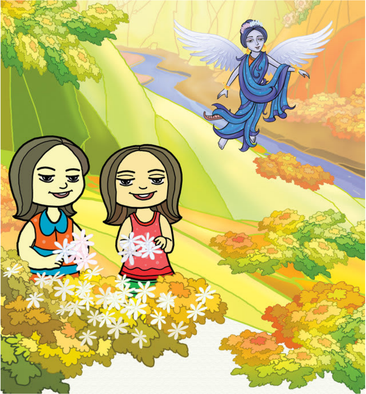
The fairy asks them for flowers.