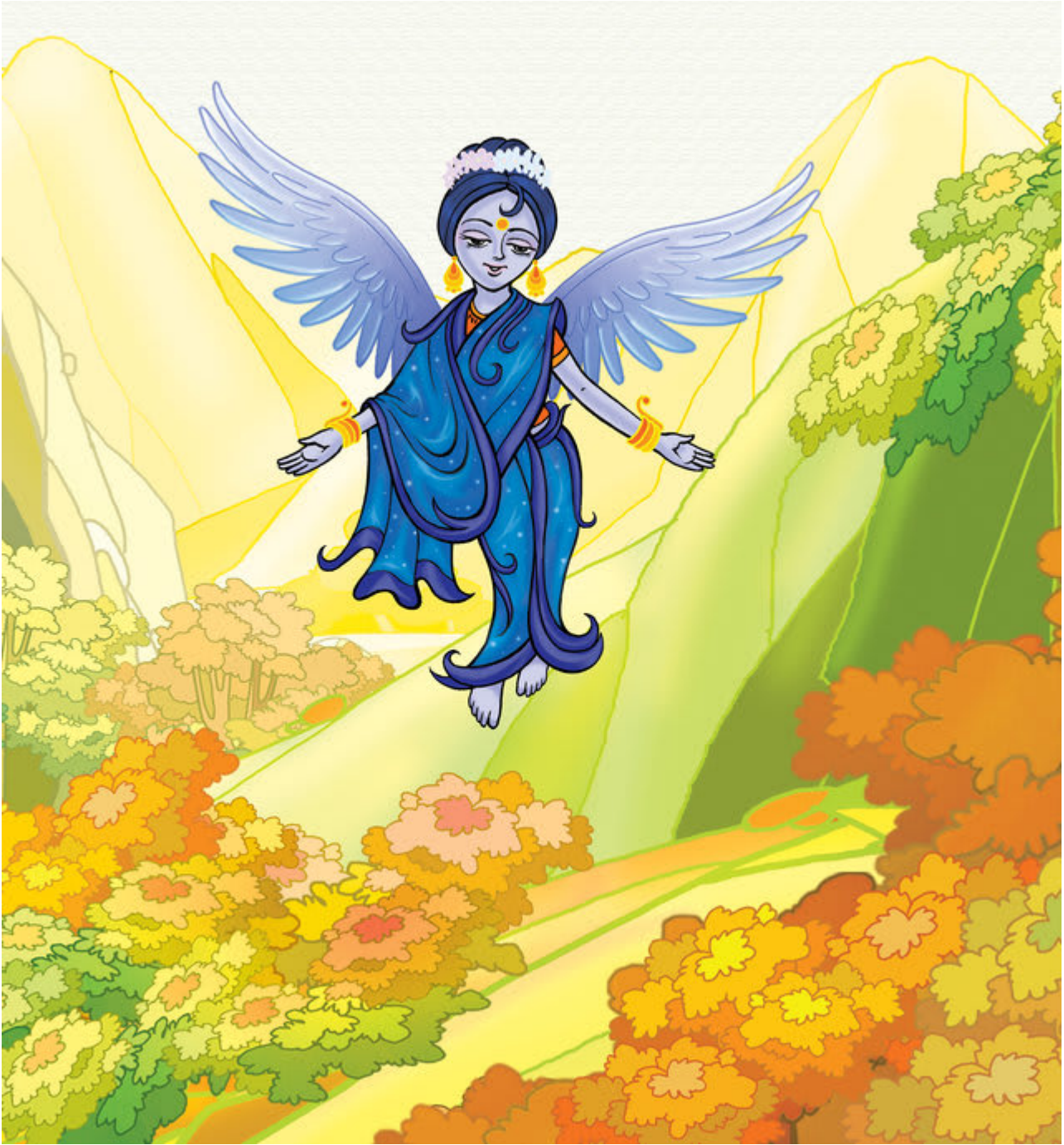
When suddenly a blue fairy appears!