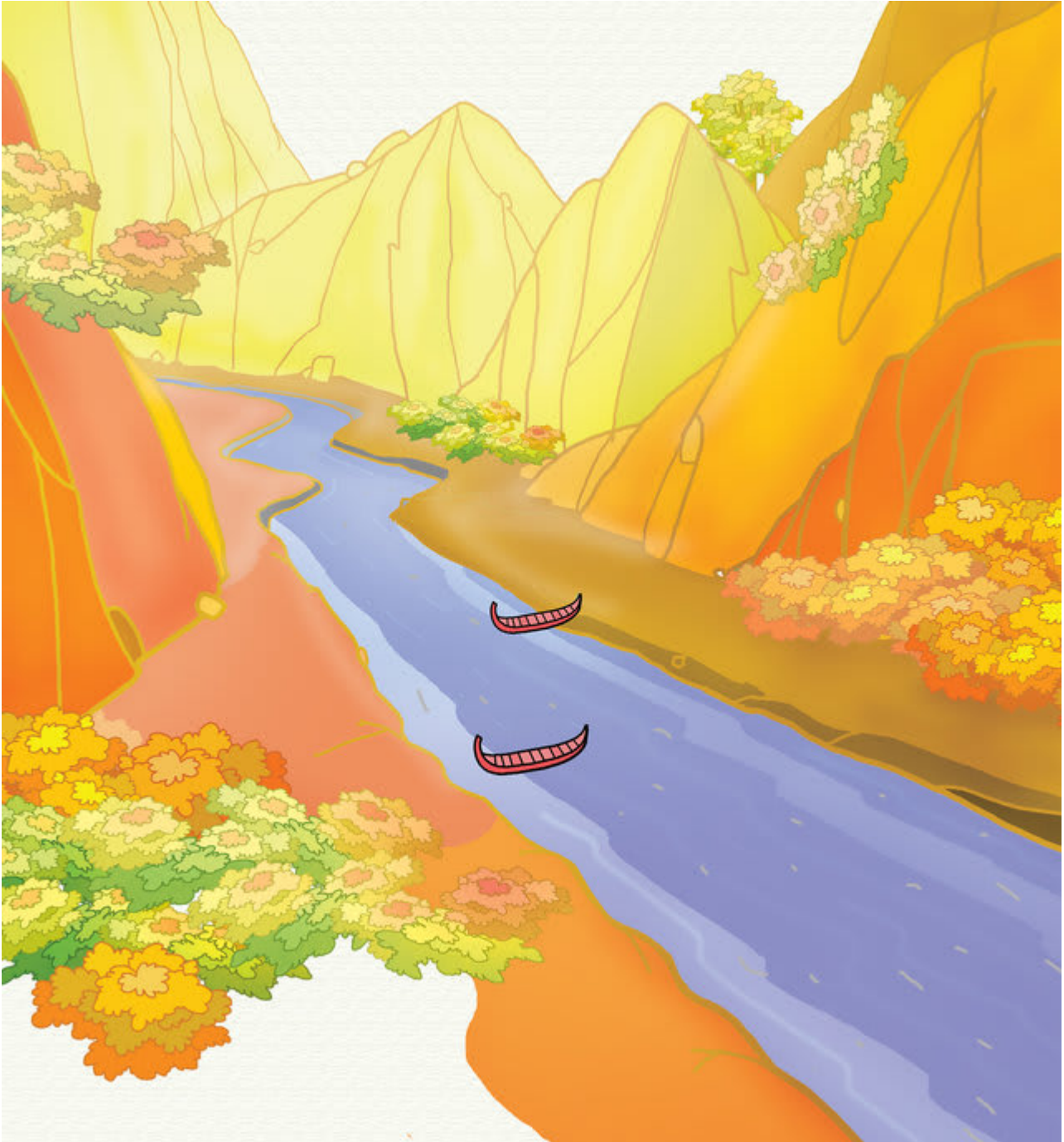
This is the River Piyang.