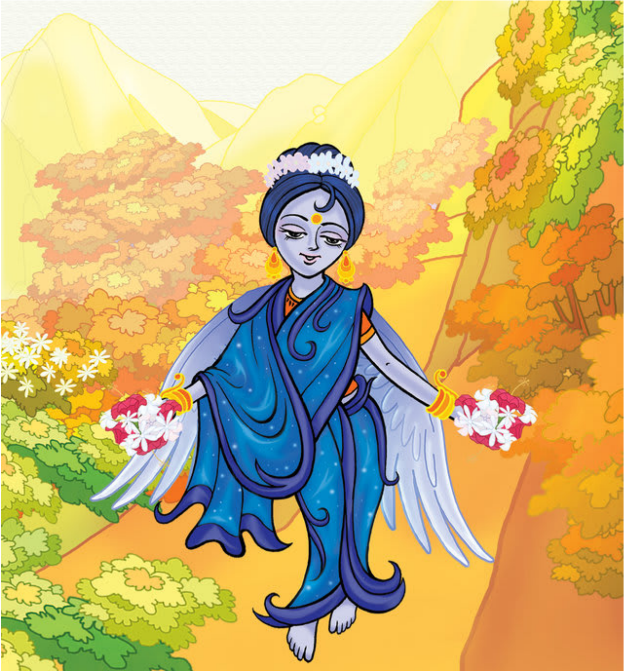
The blue fairy happily takes the flowers from the girls.