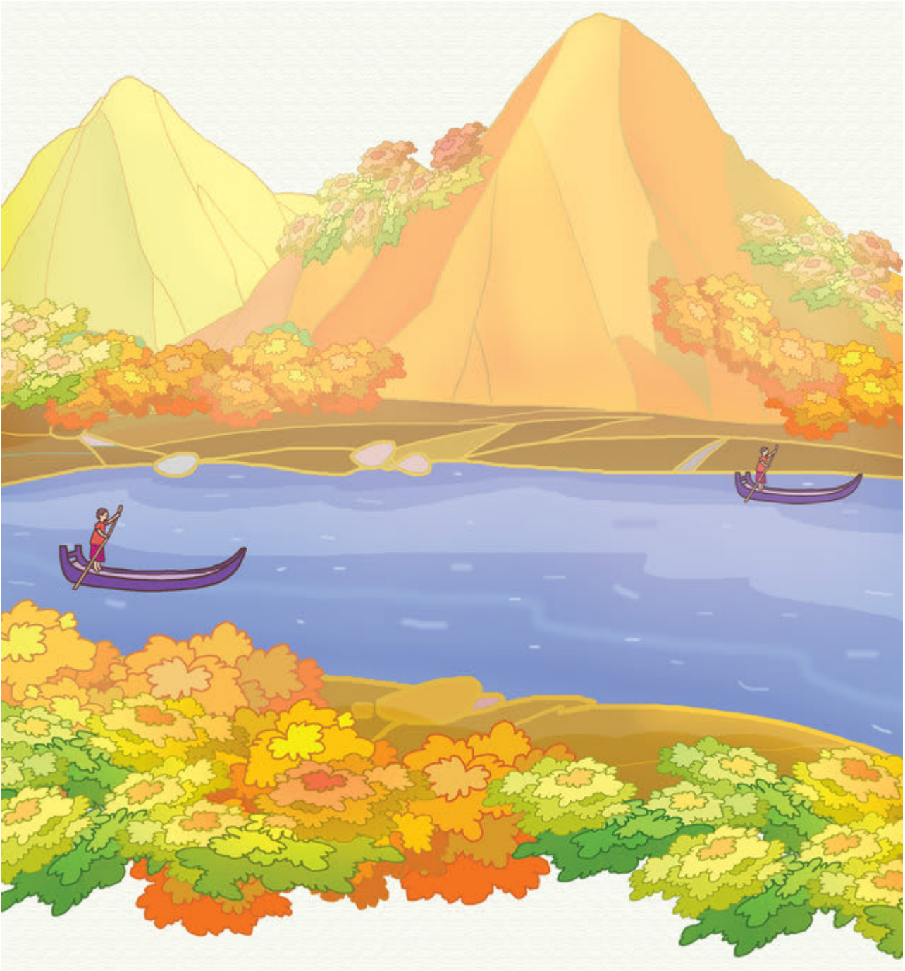
The hill on the other side of River Piyang is Diyang.