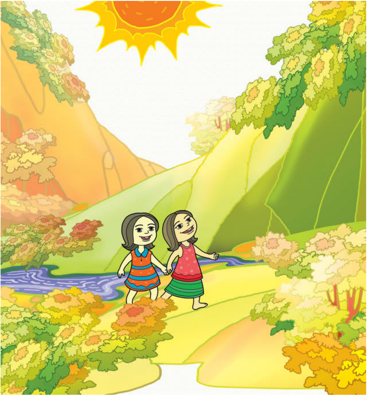
They cross a wide stream.