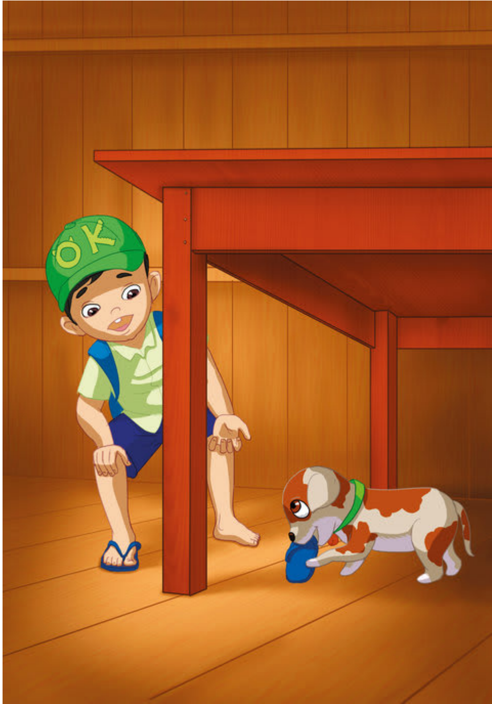
Jojo is getting my slippers.