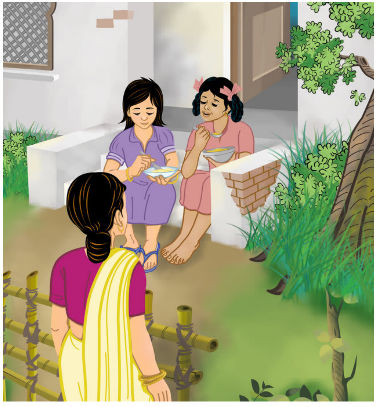
Ma walks out and sees Rani eating noodles.