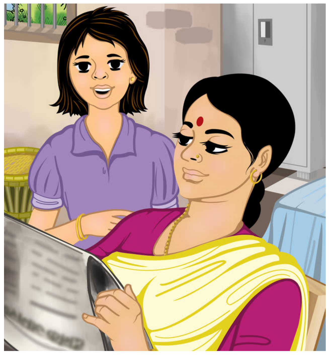
After school, Rani feels hungry. She calls out, "Ma, I'm hungry! Please give me something to eat."