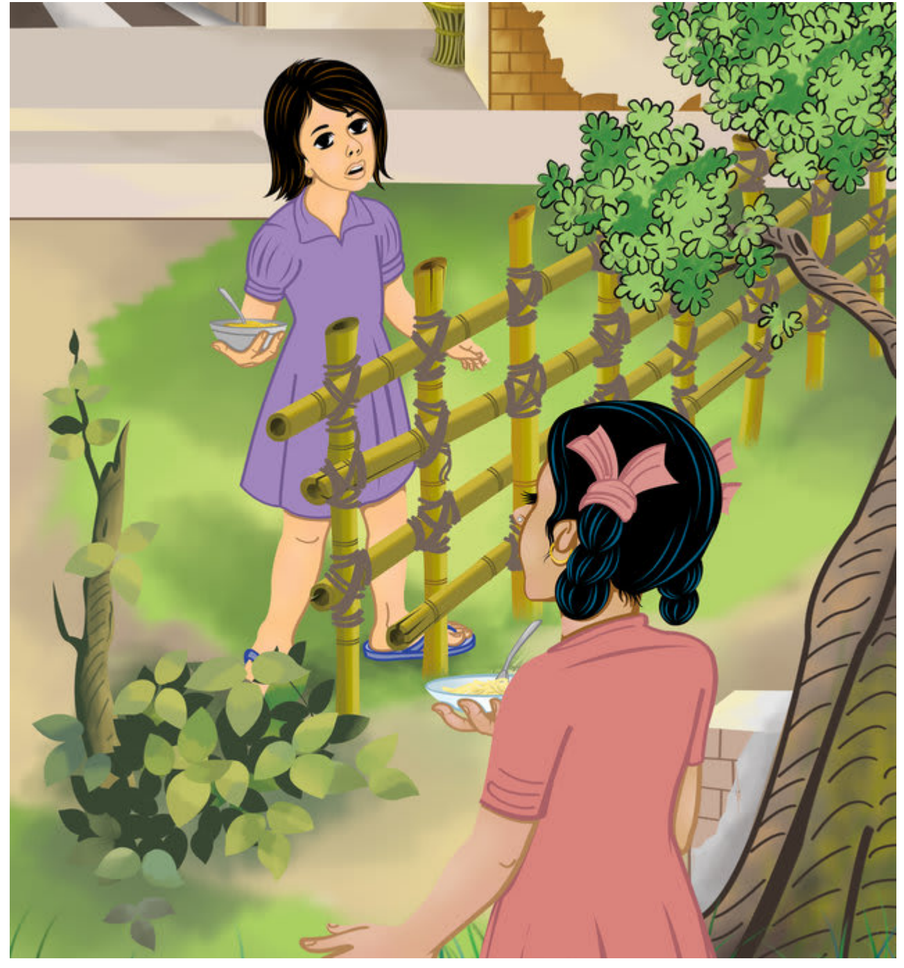
Rani notices Bala's bowl of noodles and says, "Oh! I love noodles!"