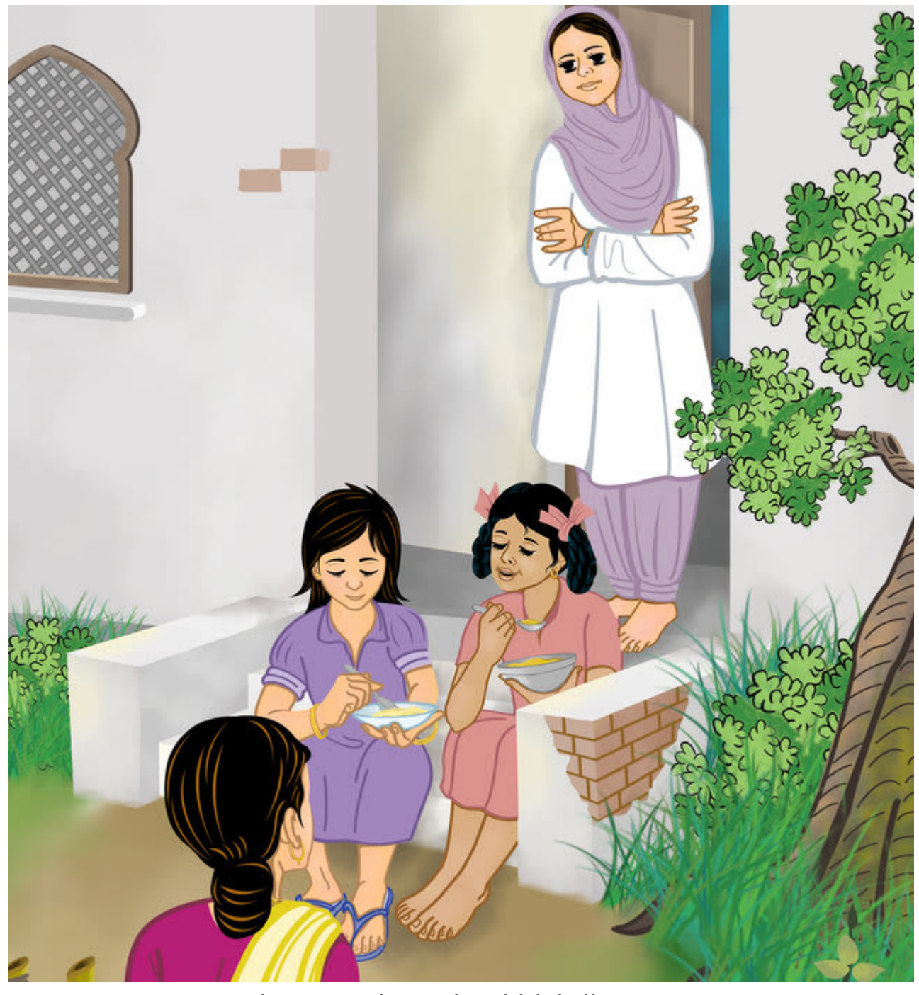
Aunty comes out and sees Bala eating khichdi.