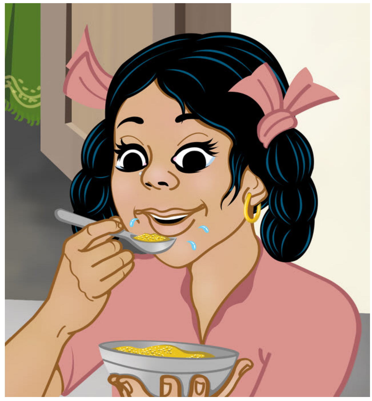
"YUM! This khichdi is so good!"