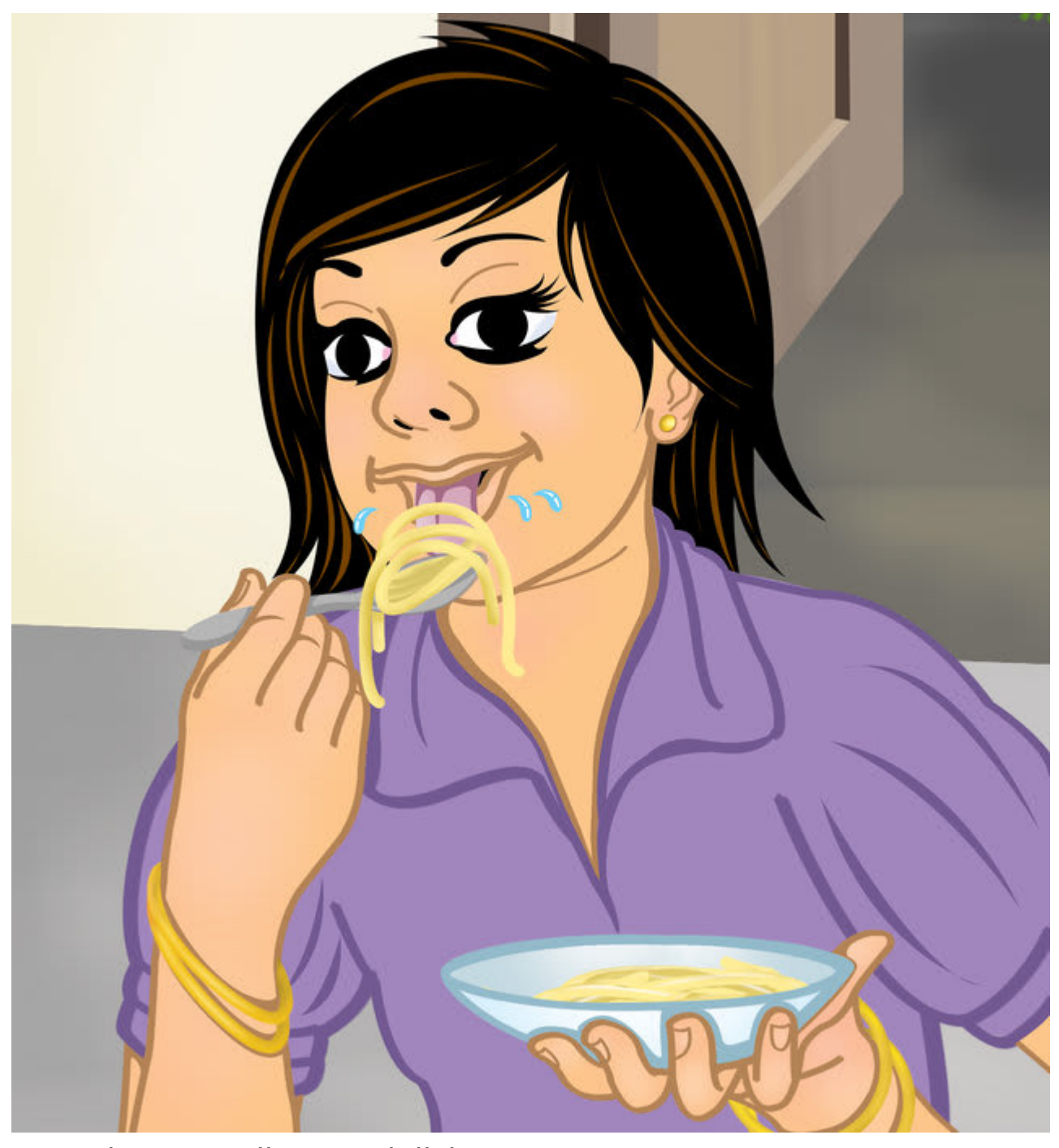
"YUM! These noodles are delicious!"