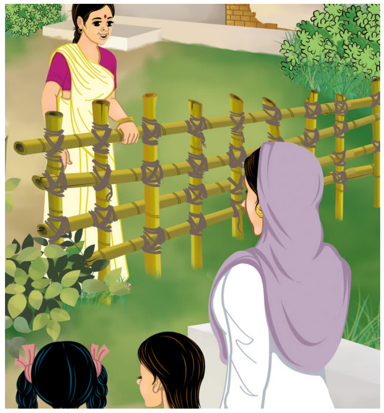
Ma and Aunty look at each other and smile. Aunty says, "The girls are so happy to share their food!"