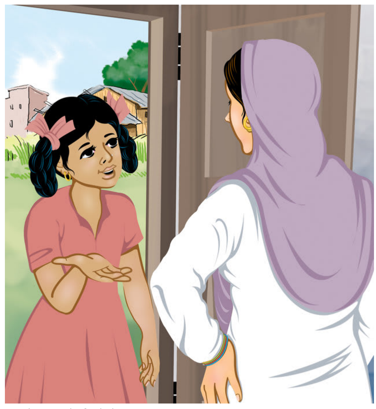
Next door, Bala feels hungry. She calls out, "Aunty, I'm hungry! Please give me something to eat."