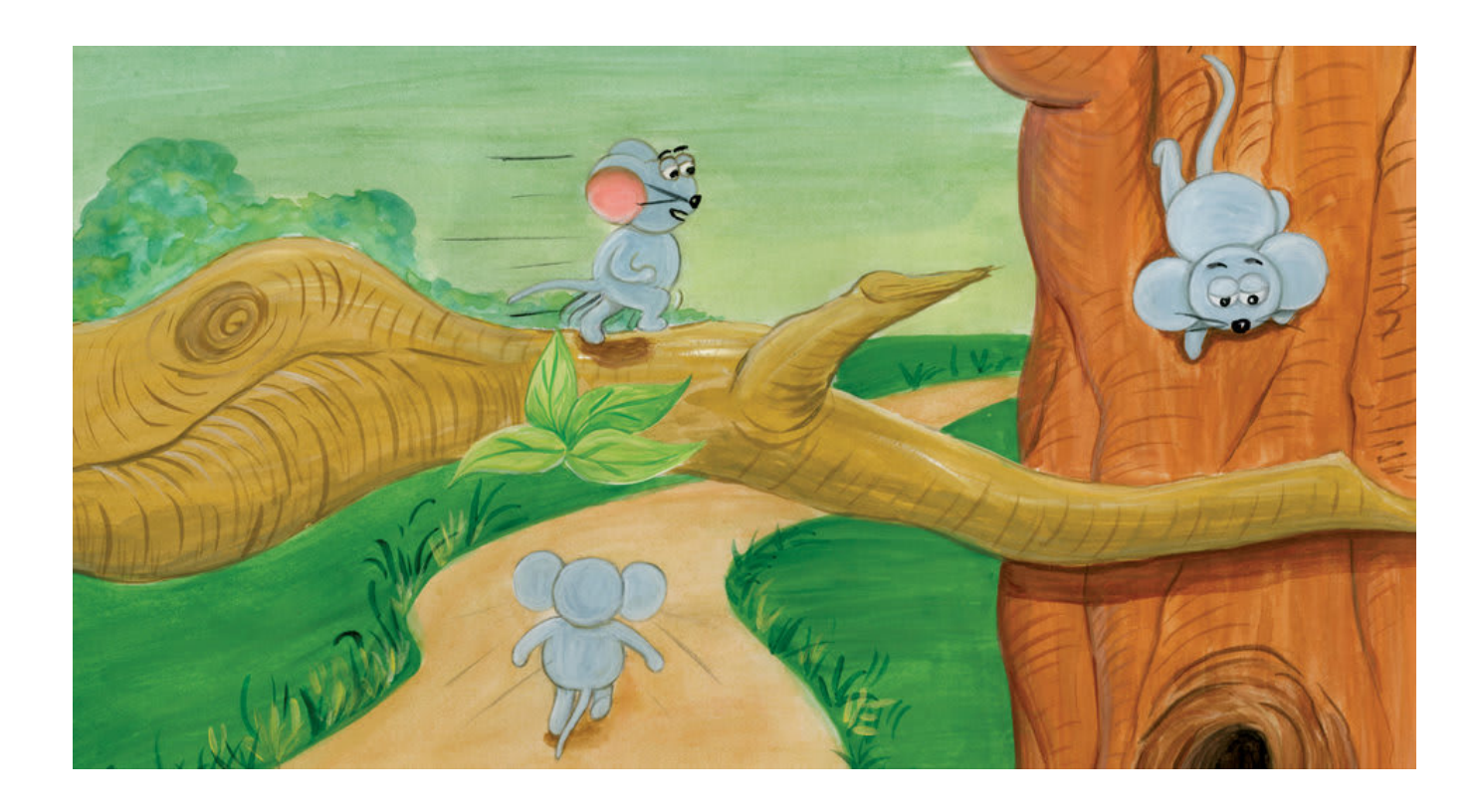
Rat loves to play outside.