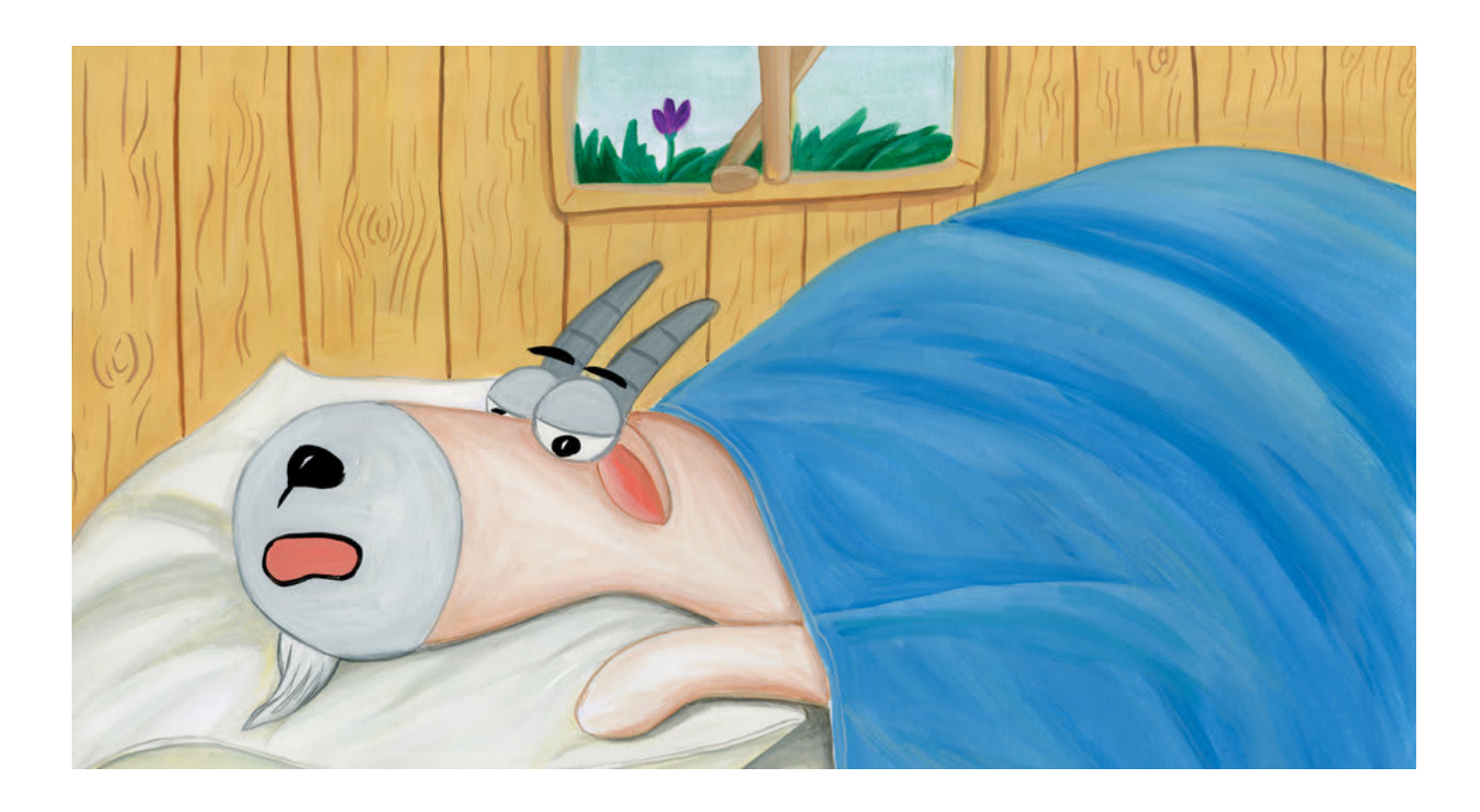
"No, no!" Goat says. "I need to sleep. I don't want to play."