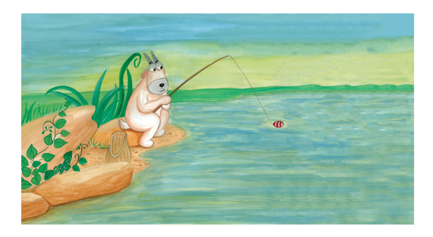
Goat likes to spend time alone, fishing and napping.