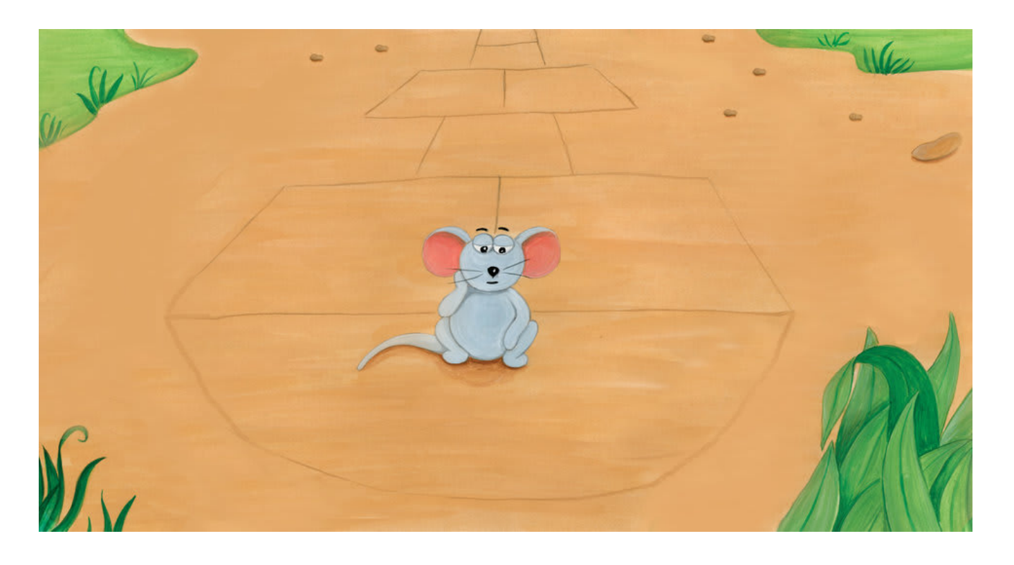
Today he wants to play Moek (hopscotch), but there is nobody to play with.