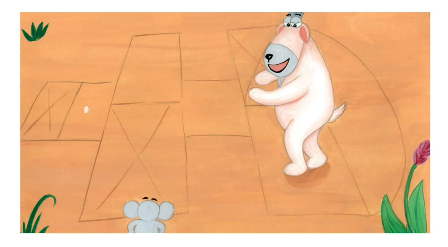
Goat has lots of fun playing with Rat. He decides that next time, he will jump out of bed to play.