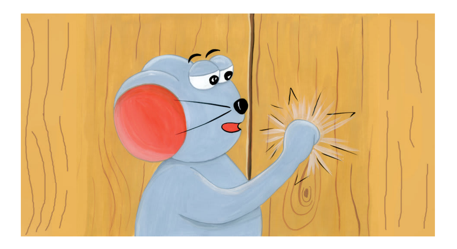
Rat goes to Goat's house and knocks on the door. Tok Tok!