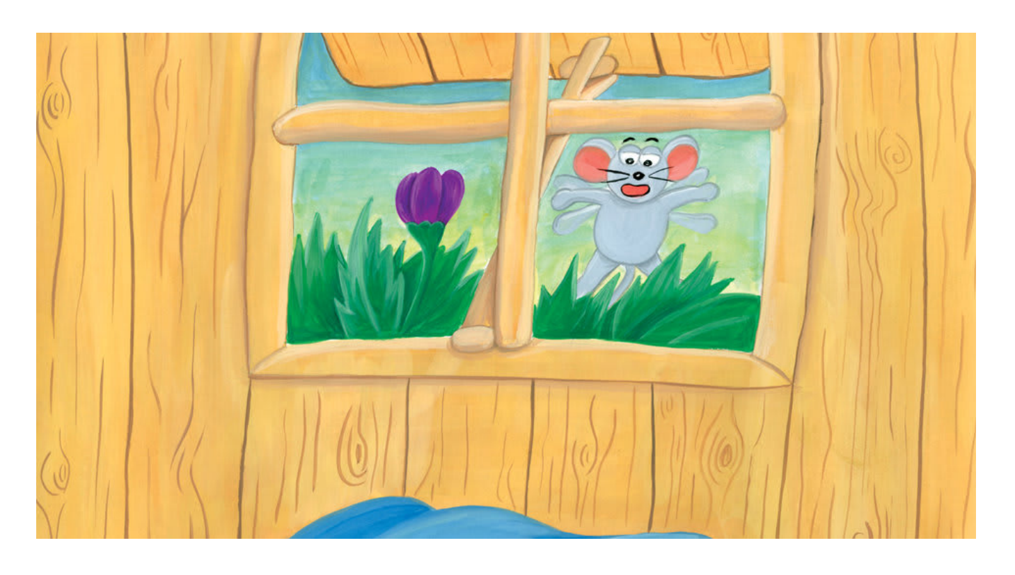
"Brother Goat!" Rat exclaims. "Come play with me!"