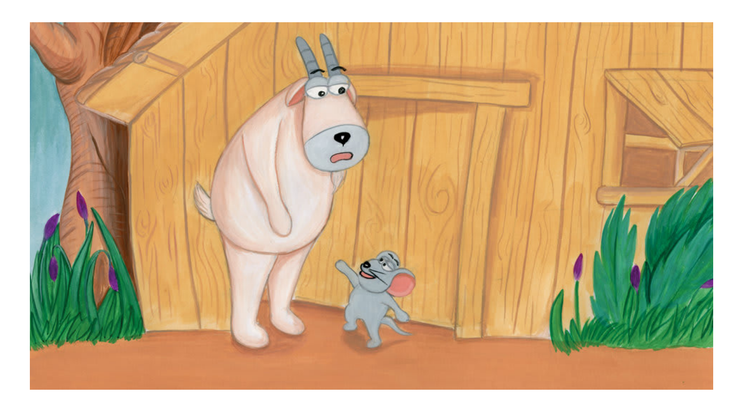
Finally, Goat agrees. "Okay, okay," Goat says. "I will play with you."