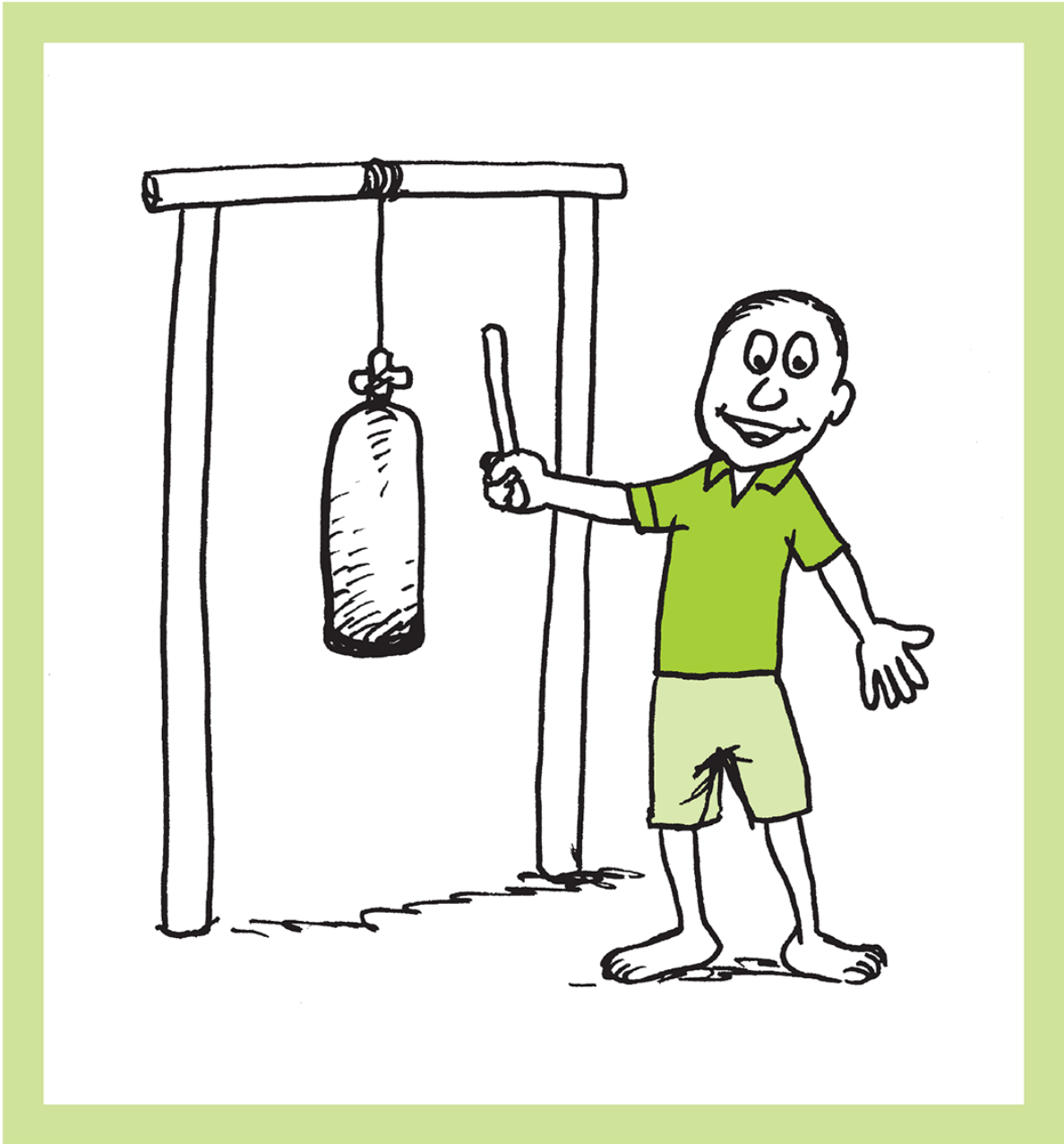
This is the bell.