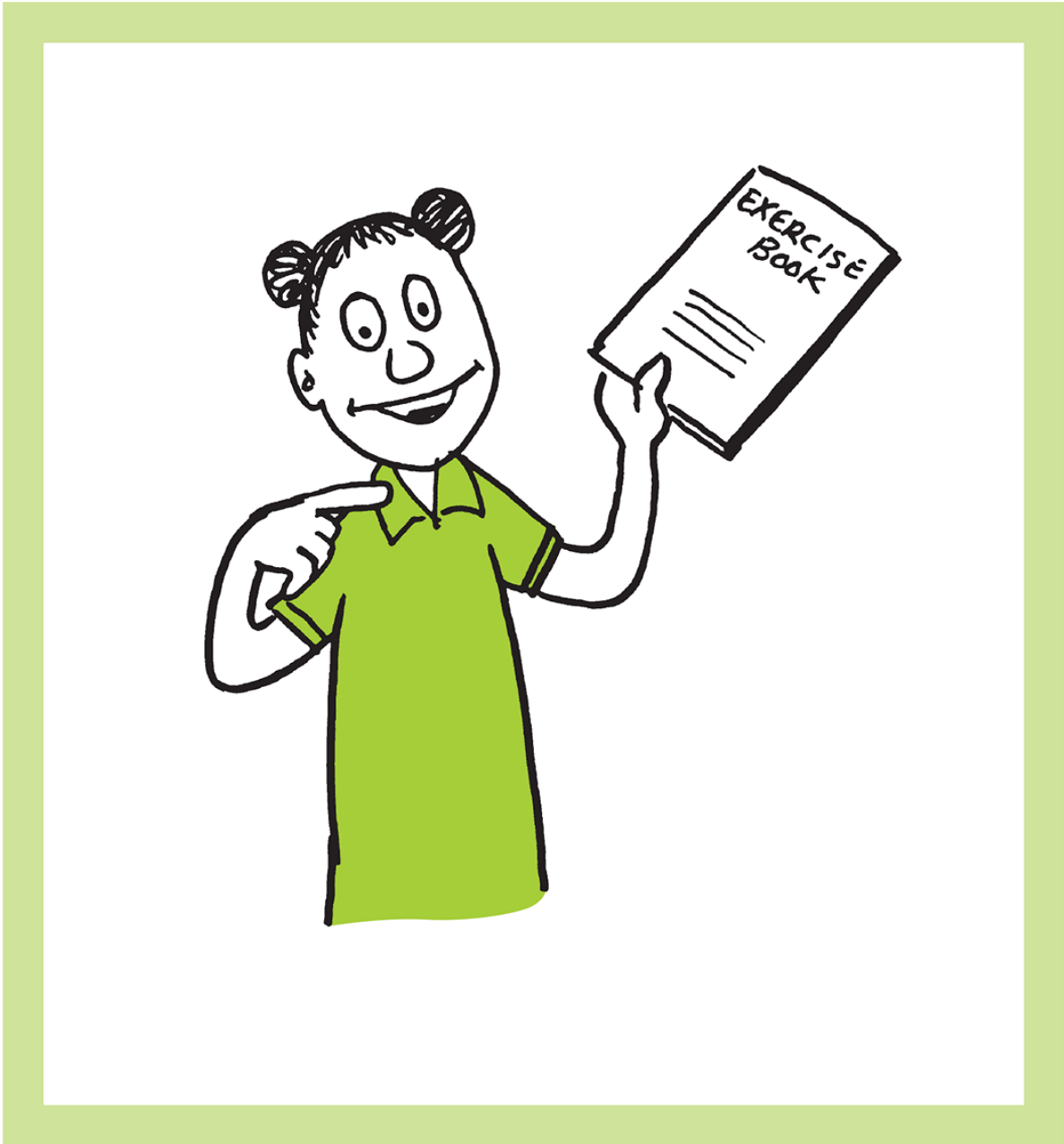
This is my book.