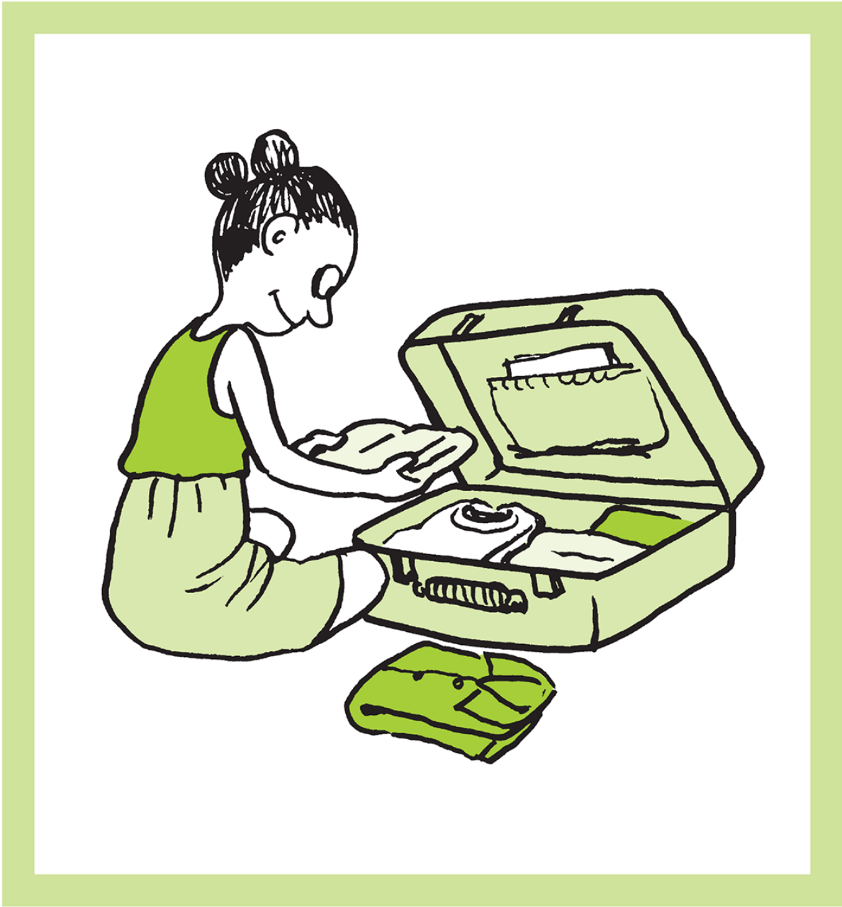
I can pack.