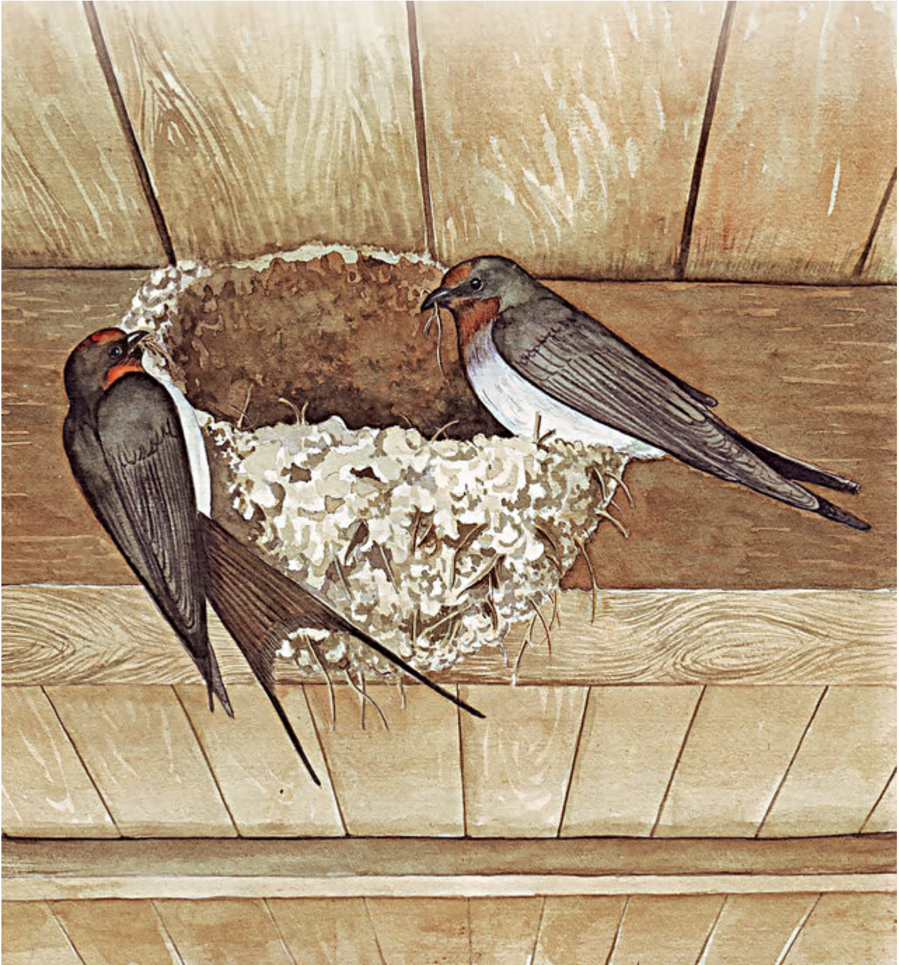
The Builder Bird

A little bit of mud, a little bit of water. The Builder Bird is the swallow!