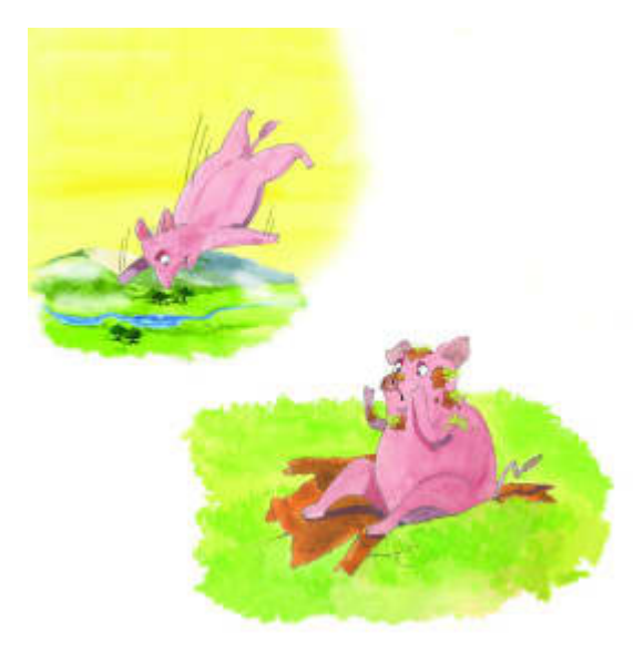
Poor pig! When he fell, he landed on his nose. And his nose was flattened into a snout.