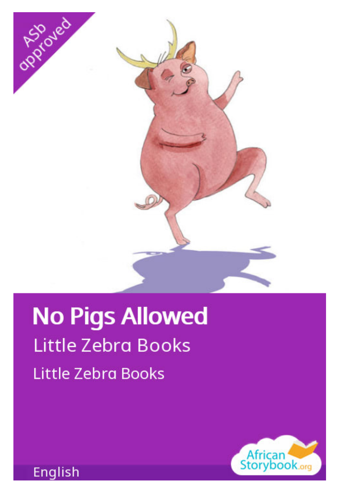
No Pigs Allowed

This tale explains why pigs have flat noses. What else does the story teach us?