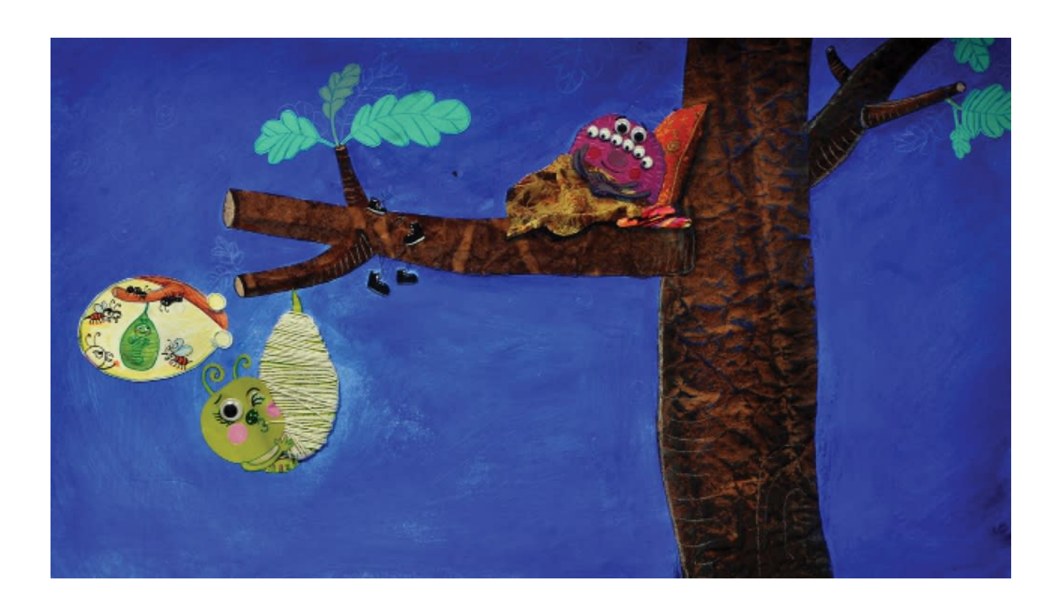
Then Kate started making her cocoon and Baby Spider watched her quietly.